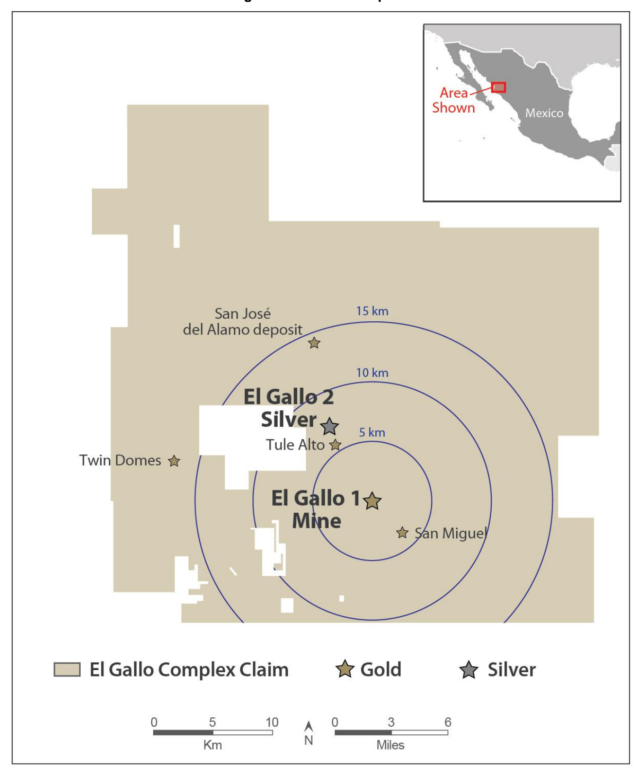
Figure 1: El Gallo Complex