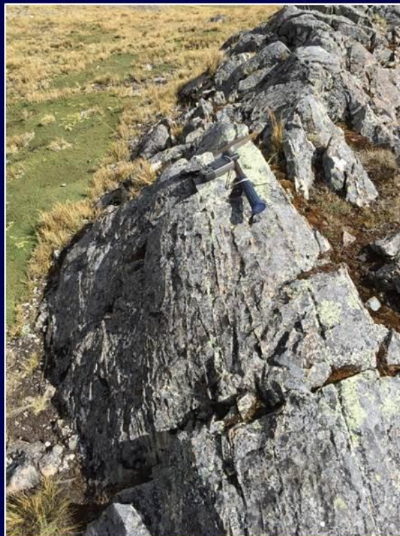
Photo 2. Close up view of the veinlet structures in the Potro Porphyry