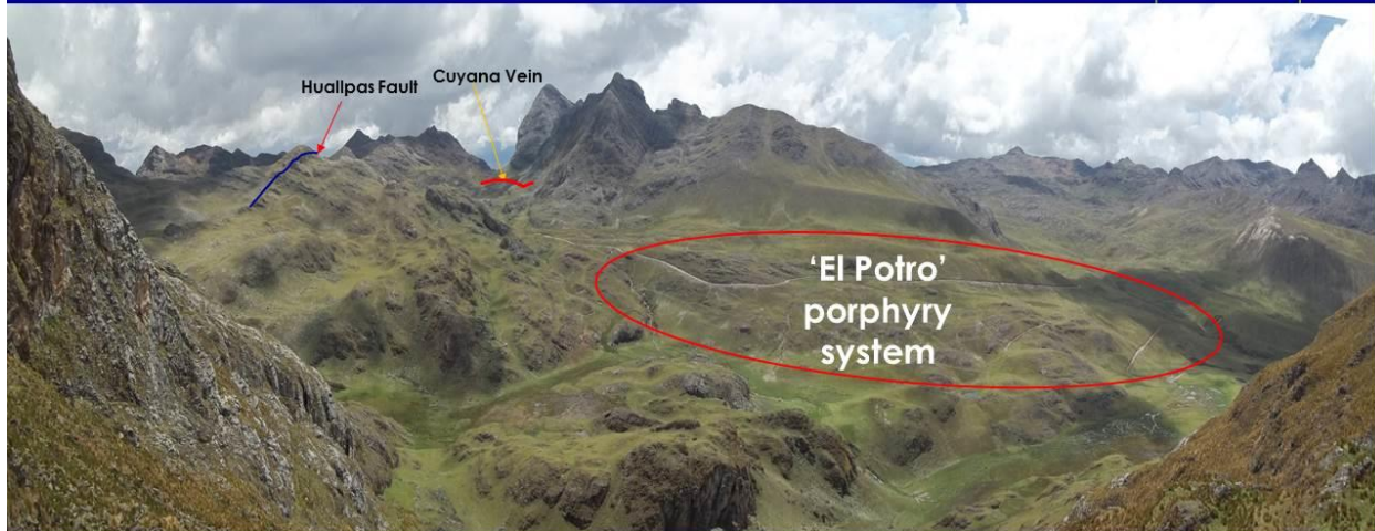
Photo 1. Panoramic View to the northwest of the Tumipampa Property and the 'El Potro' porphyry