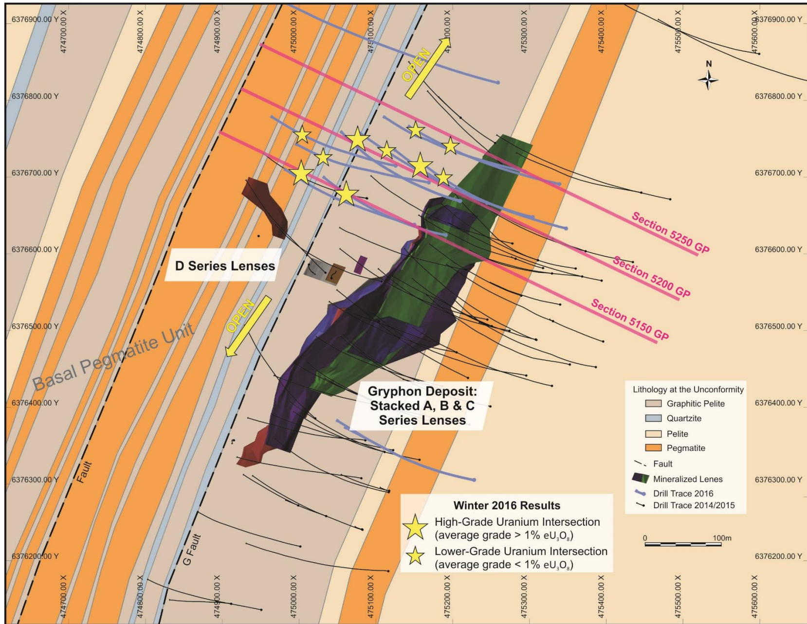
Figure 2: Plan map of the northeast plunging Gryphon mineralized lenses projected up to the simplified basement geology at the sub-Athabasca unconformity