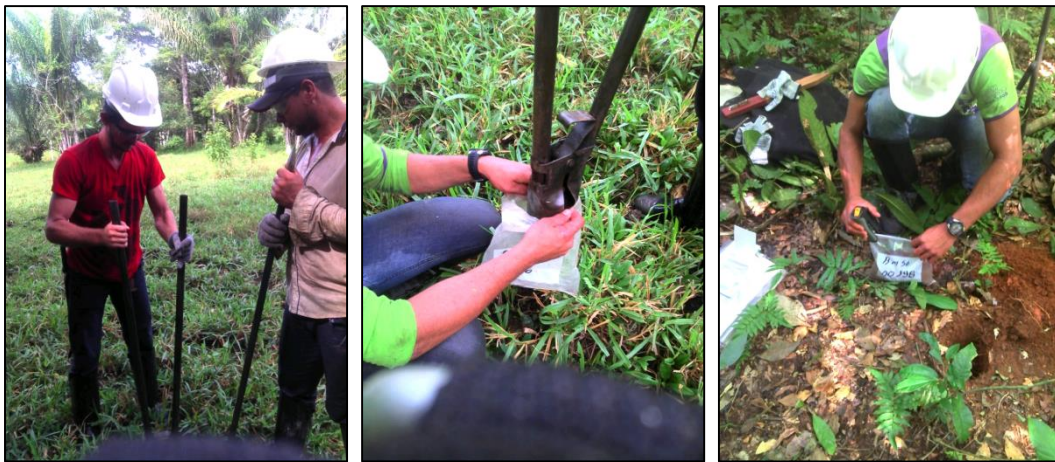
Soil geochemical surveys in progress at the Gazetta Target.