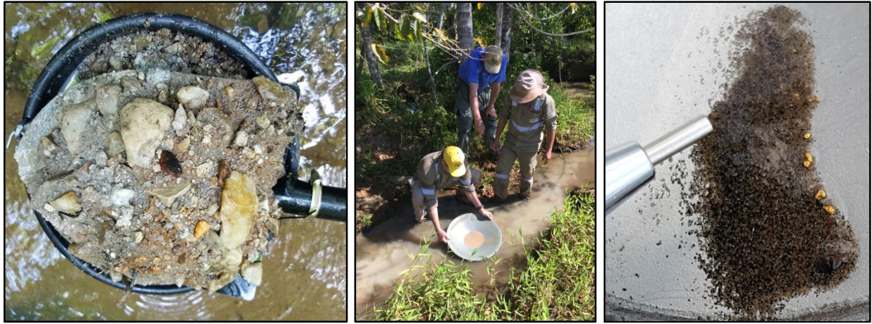
Pan concentrate program at the Sincol – Araçatuba Target