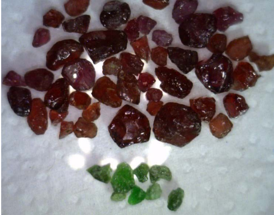
Dark red garnets and green Cr-diopsides recovered from mini-bulk sampling of V2 kimberlite