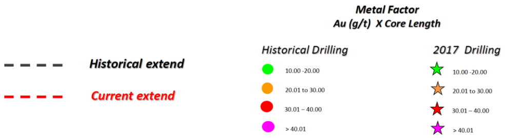
Figure 1 : Long Section – Rolartic Deposit