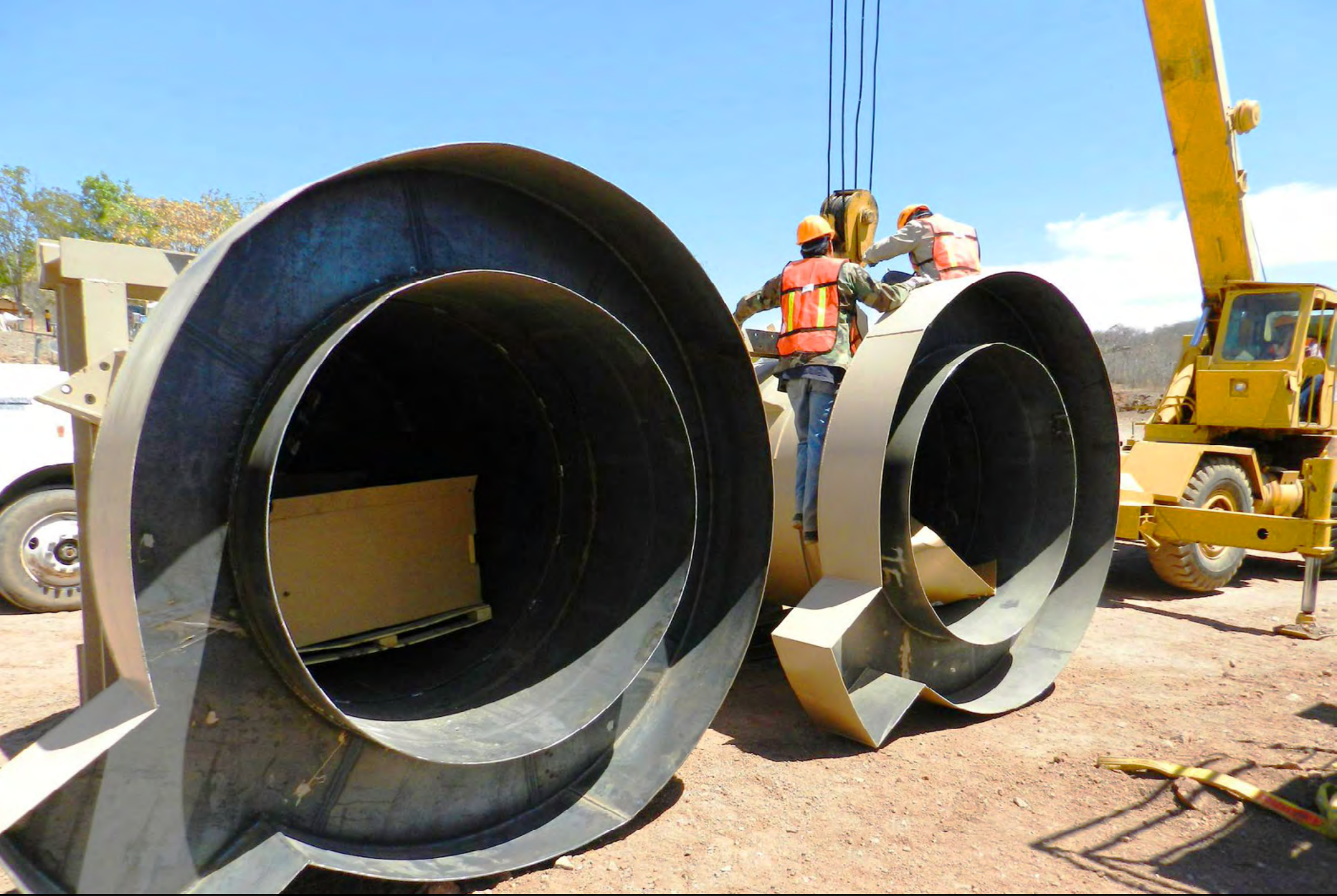
Process plant equipment arriving on site.