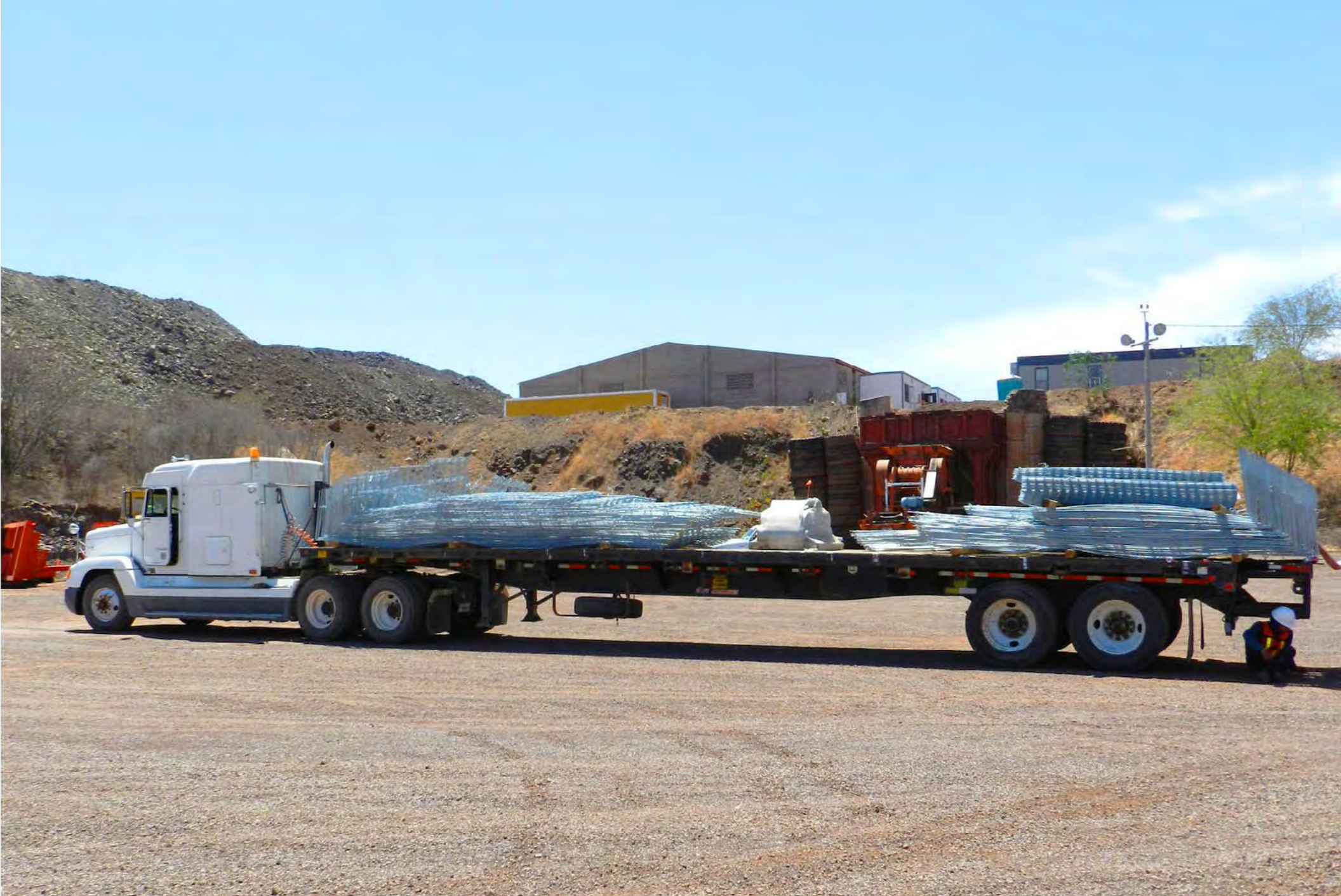
Crushing plant equipment arriving on site.