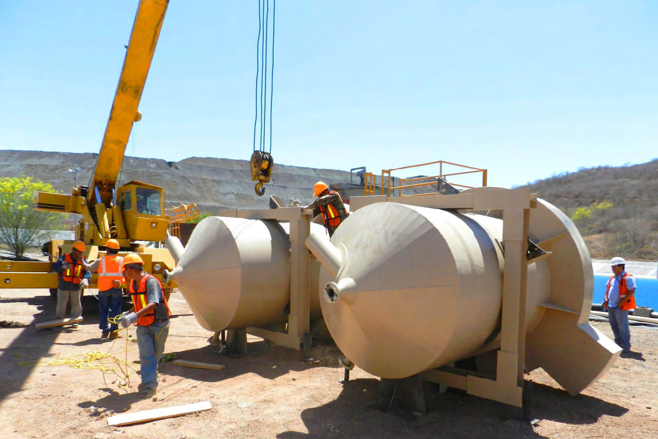
Process plant equipment arriving on site.