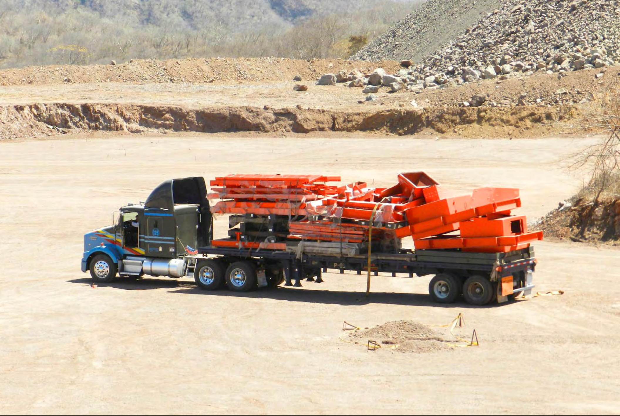
Crushing plant equipment arriving on site.