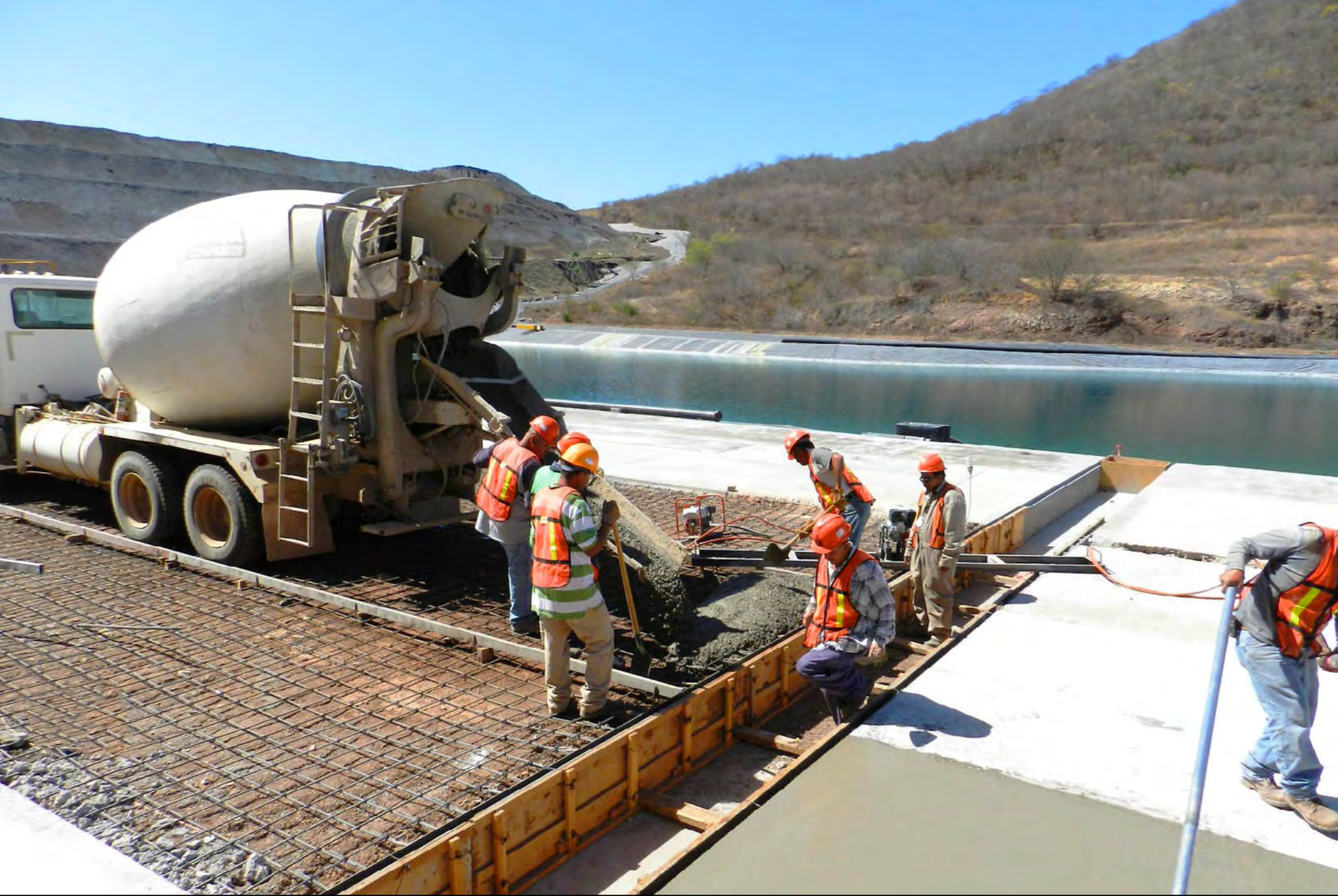
Process plant foundation.