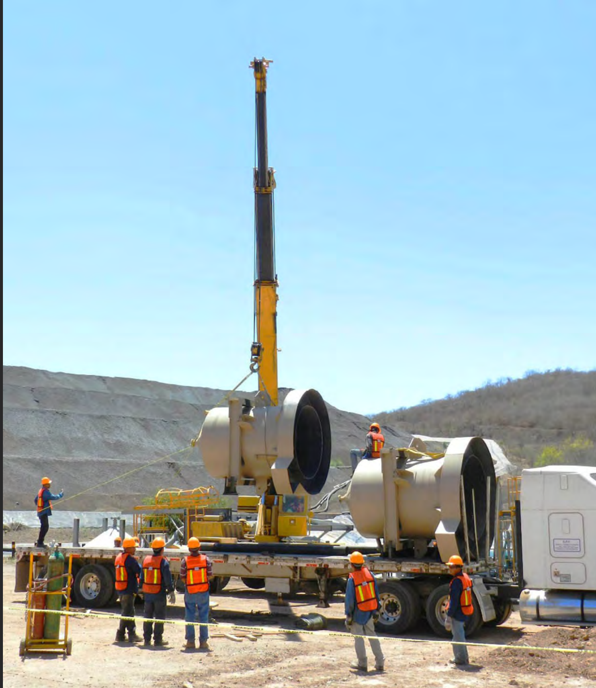
Process plant equipment arriving on site.