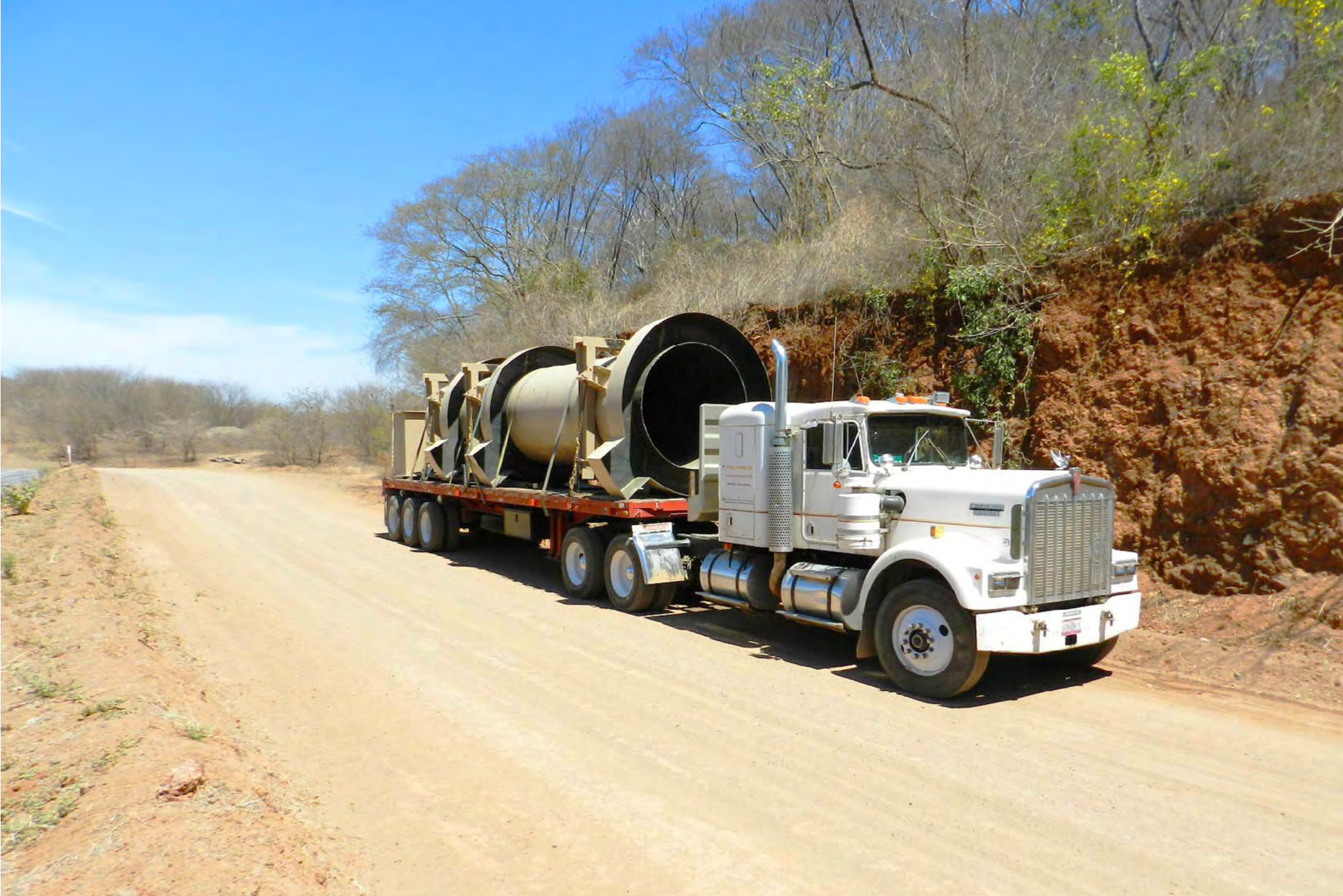
Process plant equipment arriving on site.