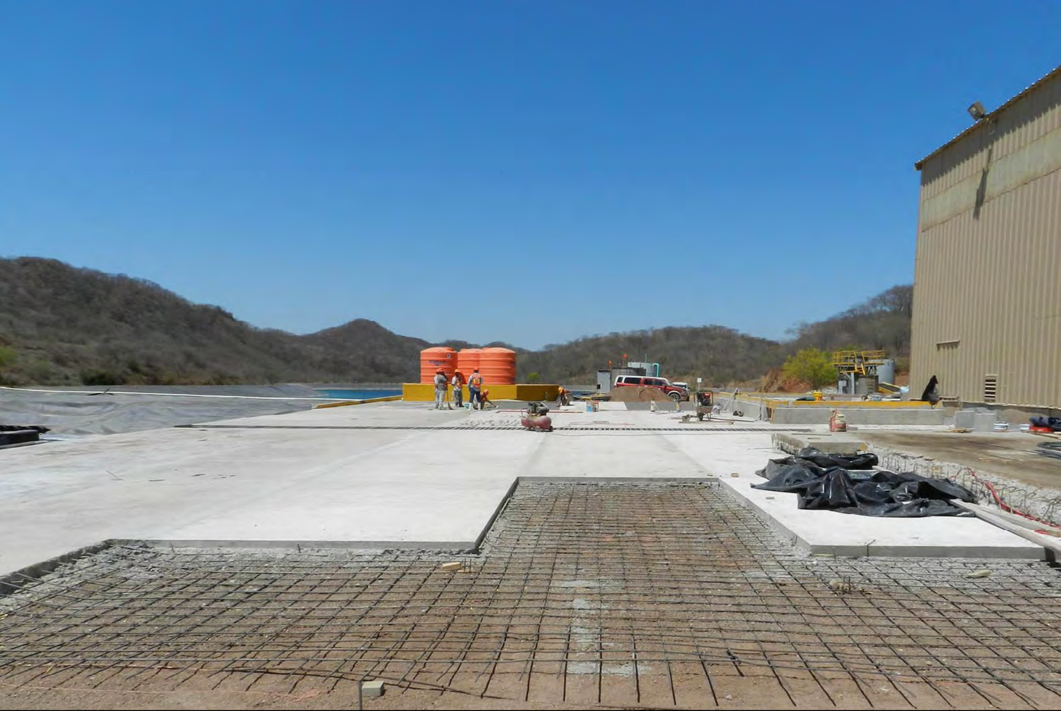
Process plant foundation.