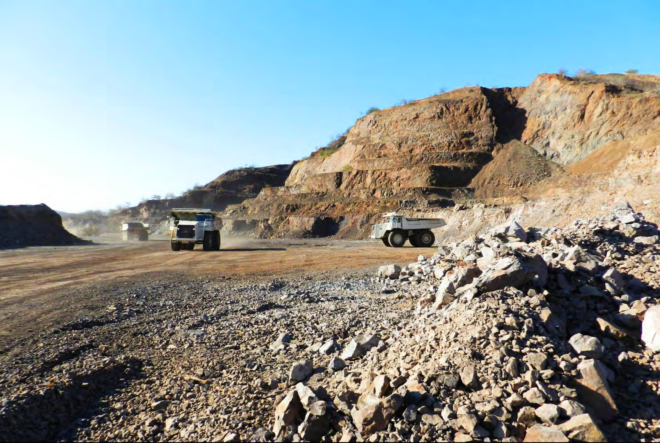
Samanegio open pit mining continues.