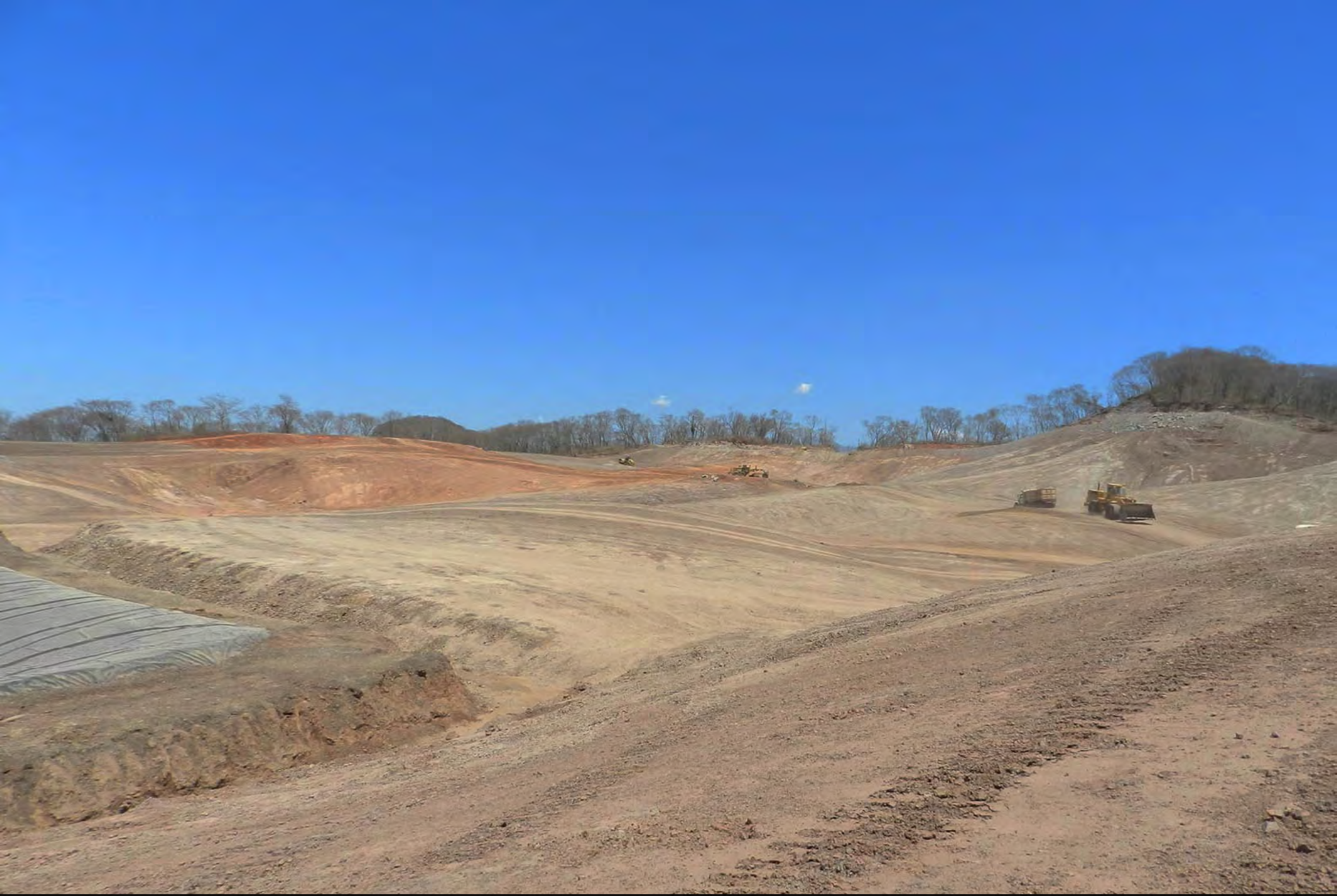
Heap leach pad expansion being prepared for clay lining.