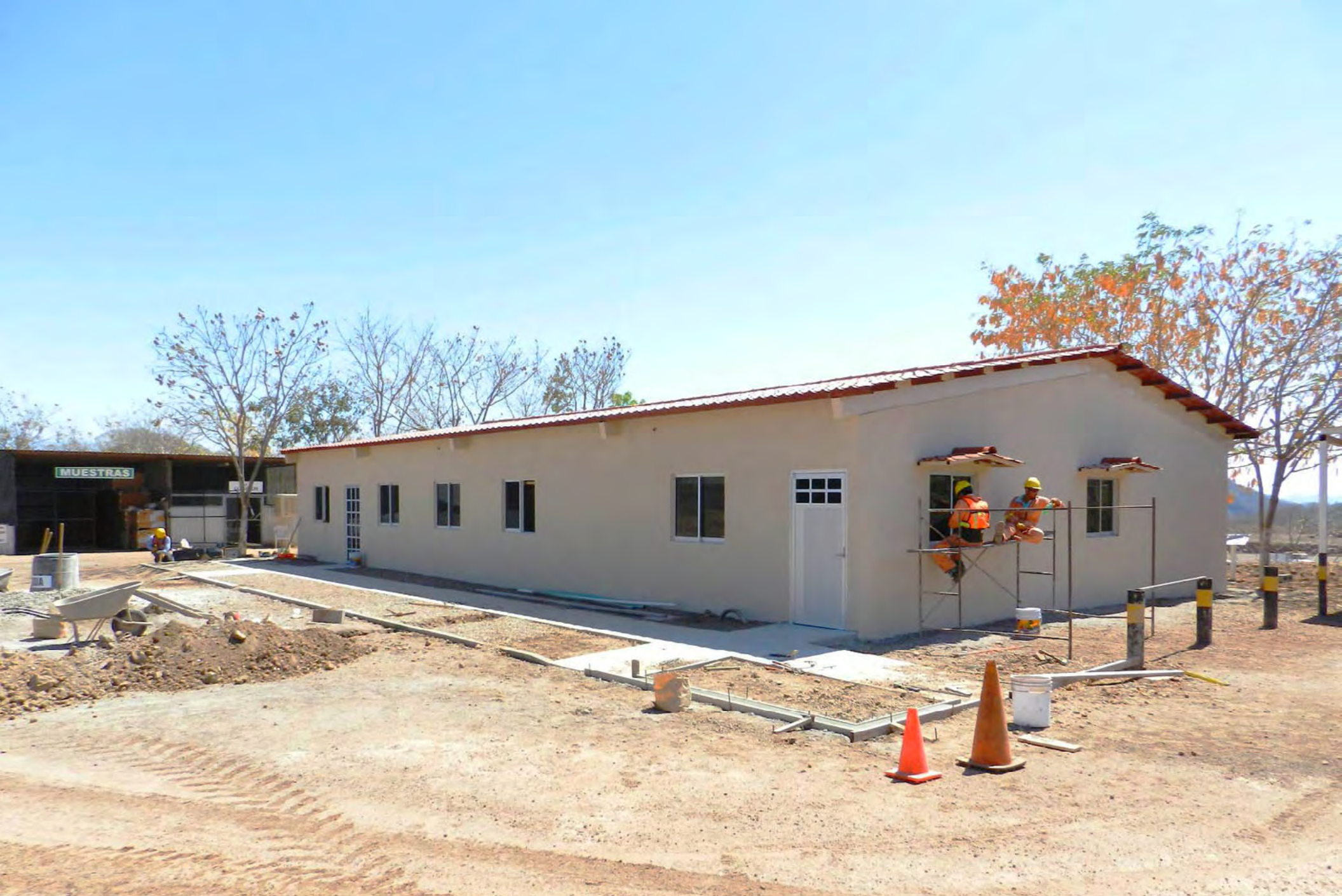
Administration building nears completion.