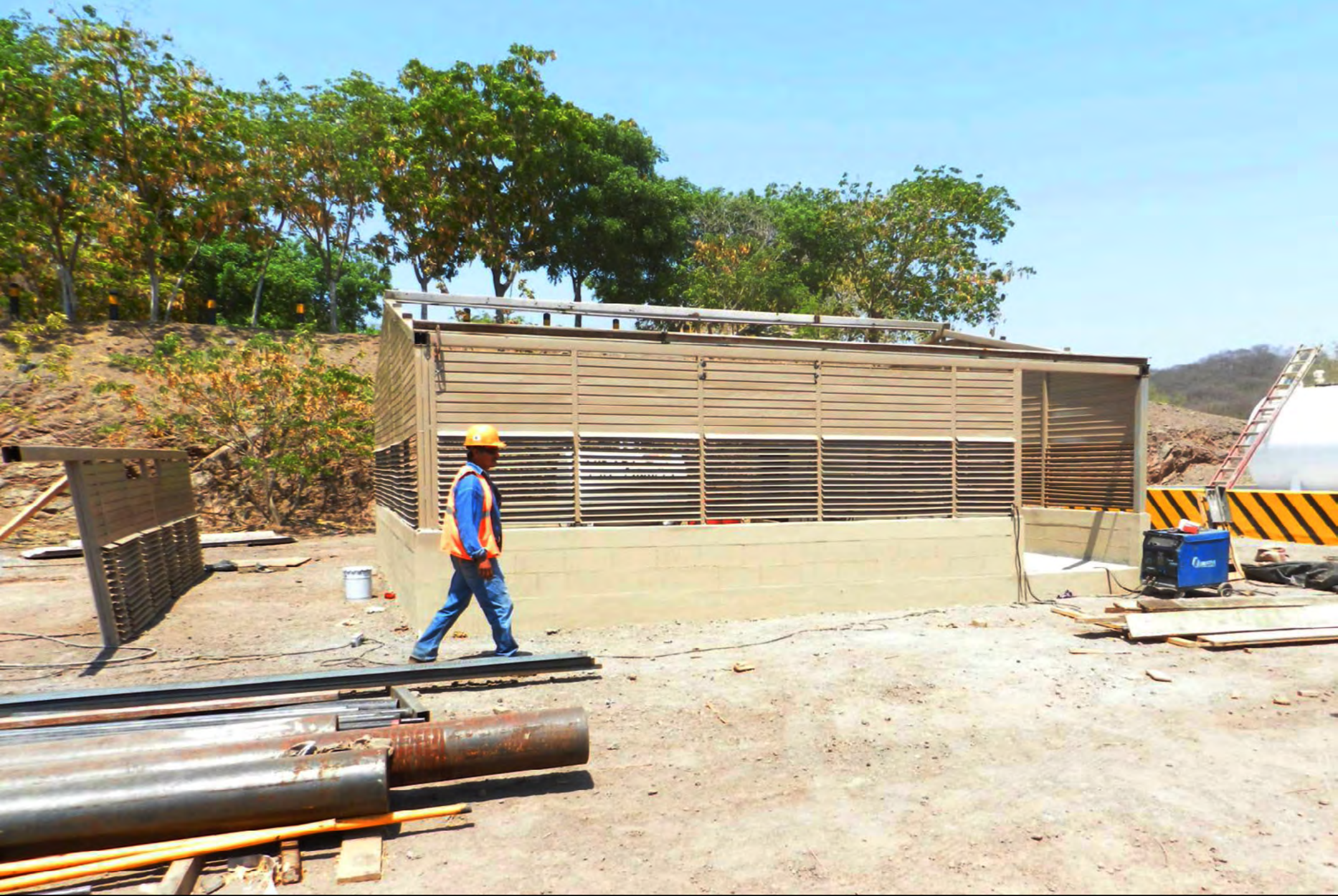
Diesel generator building for process plant.