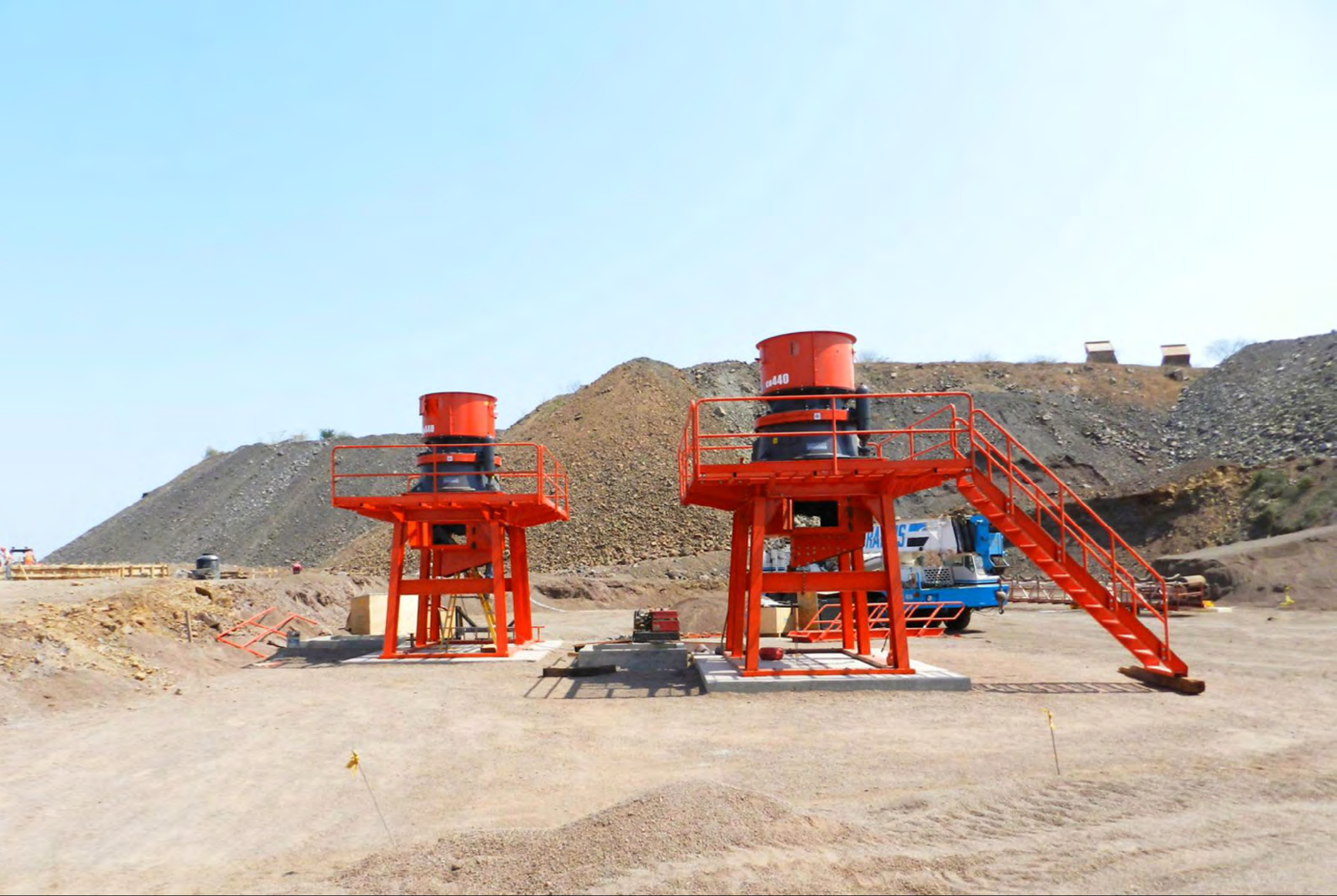
Crushing plant assembly.