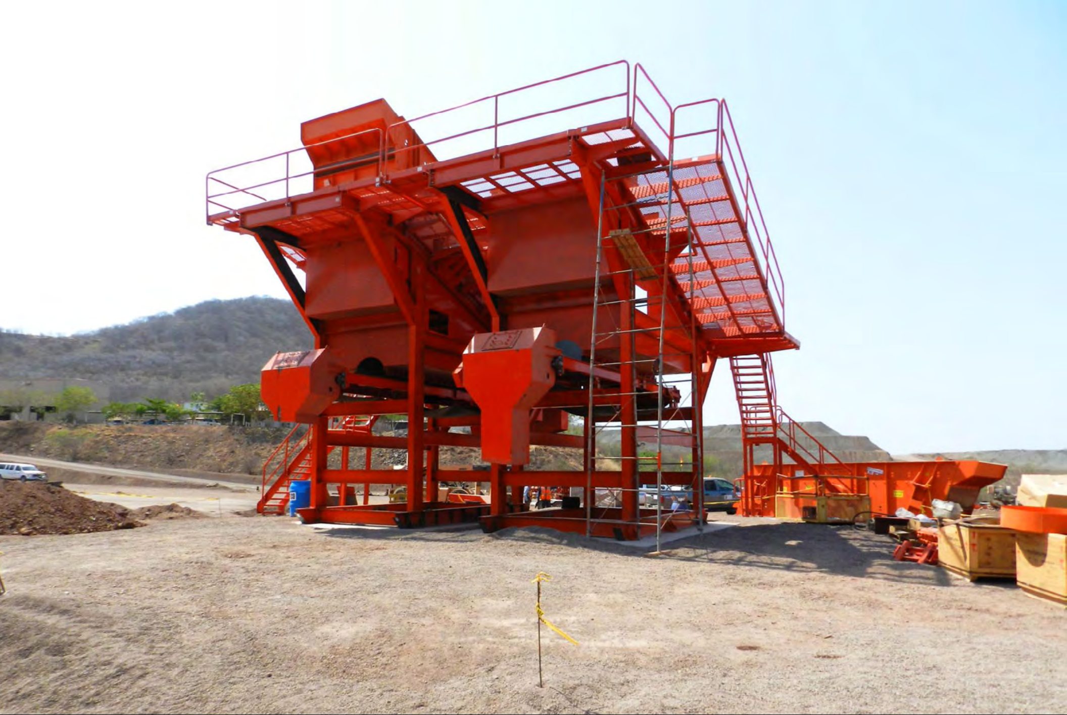
Crushing plant assembly.