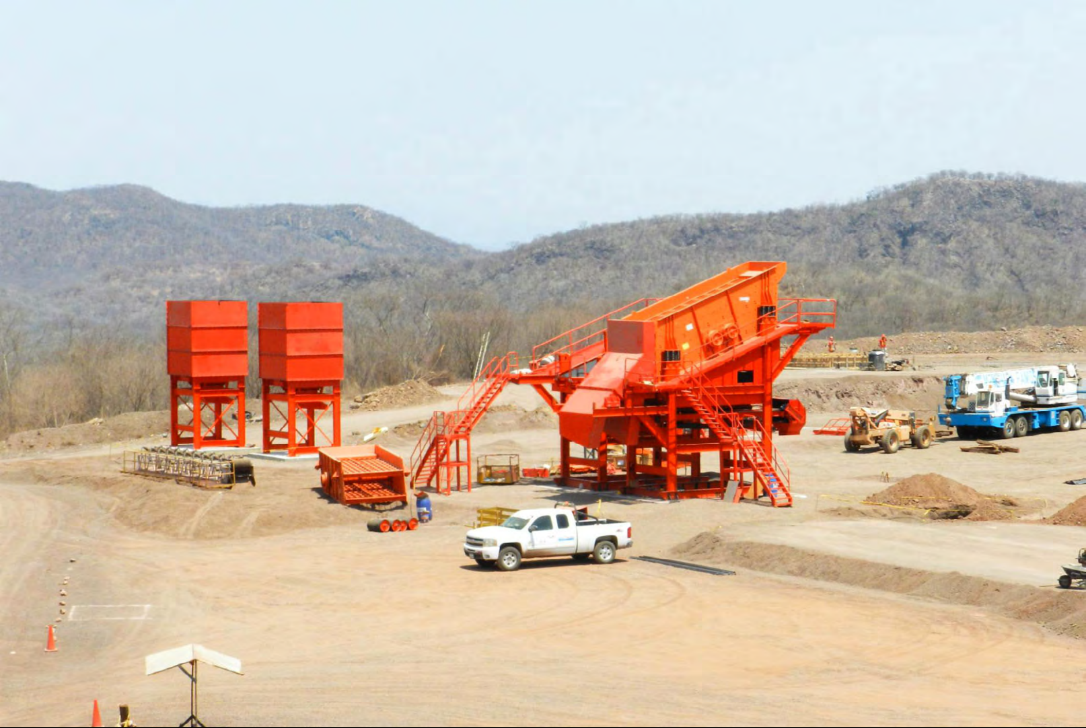
Crushing plant assembly.