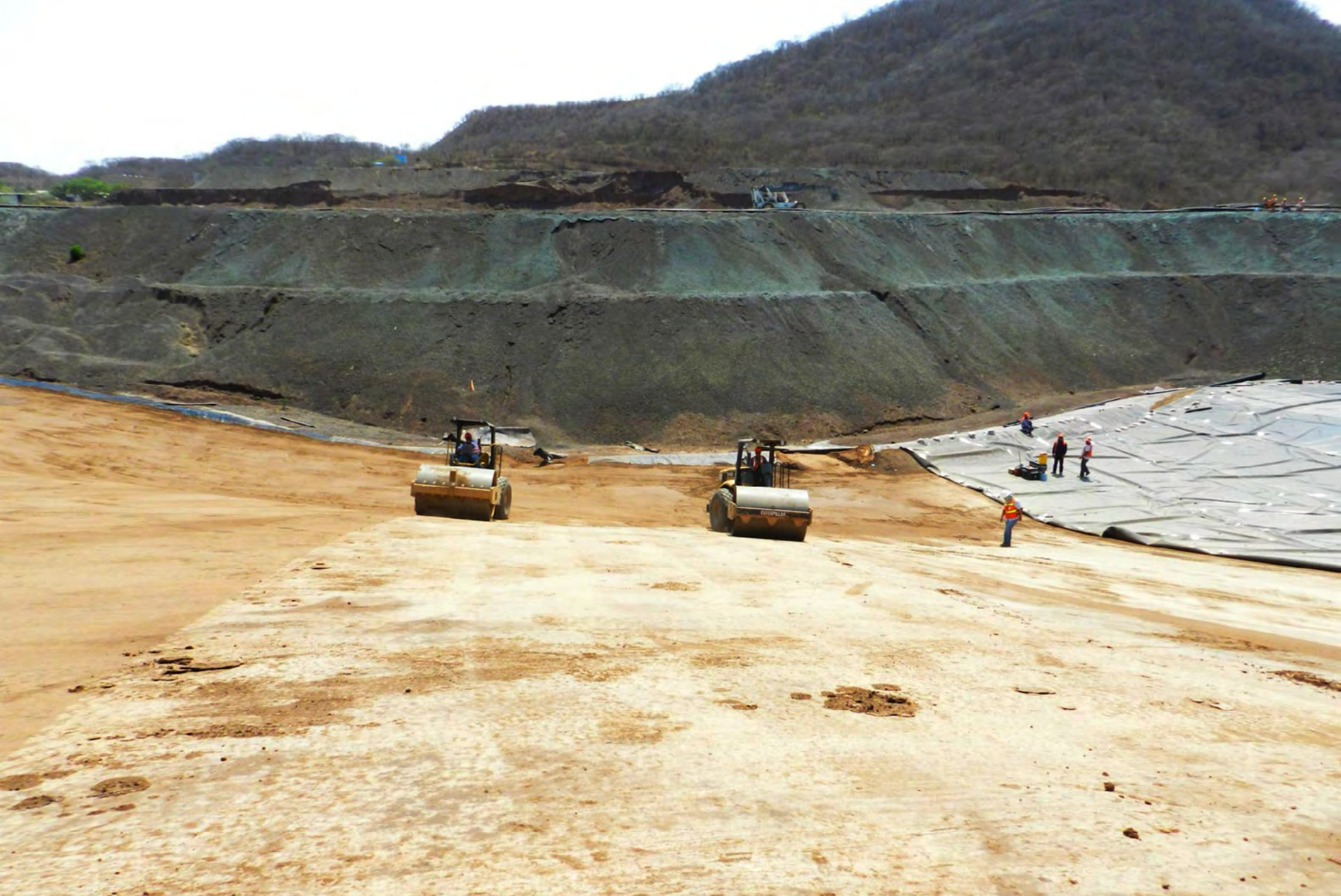
Installing heap leach liner.