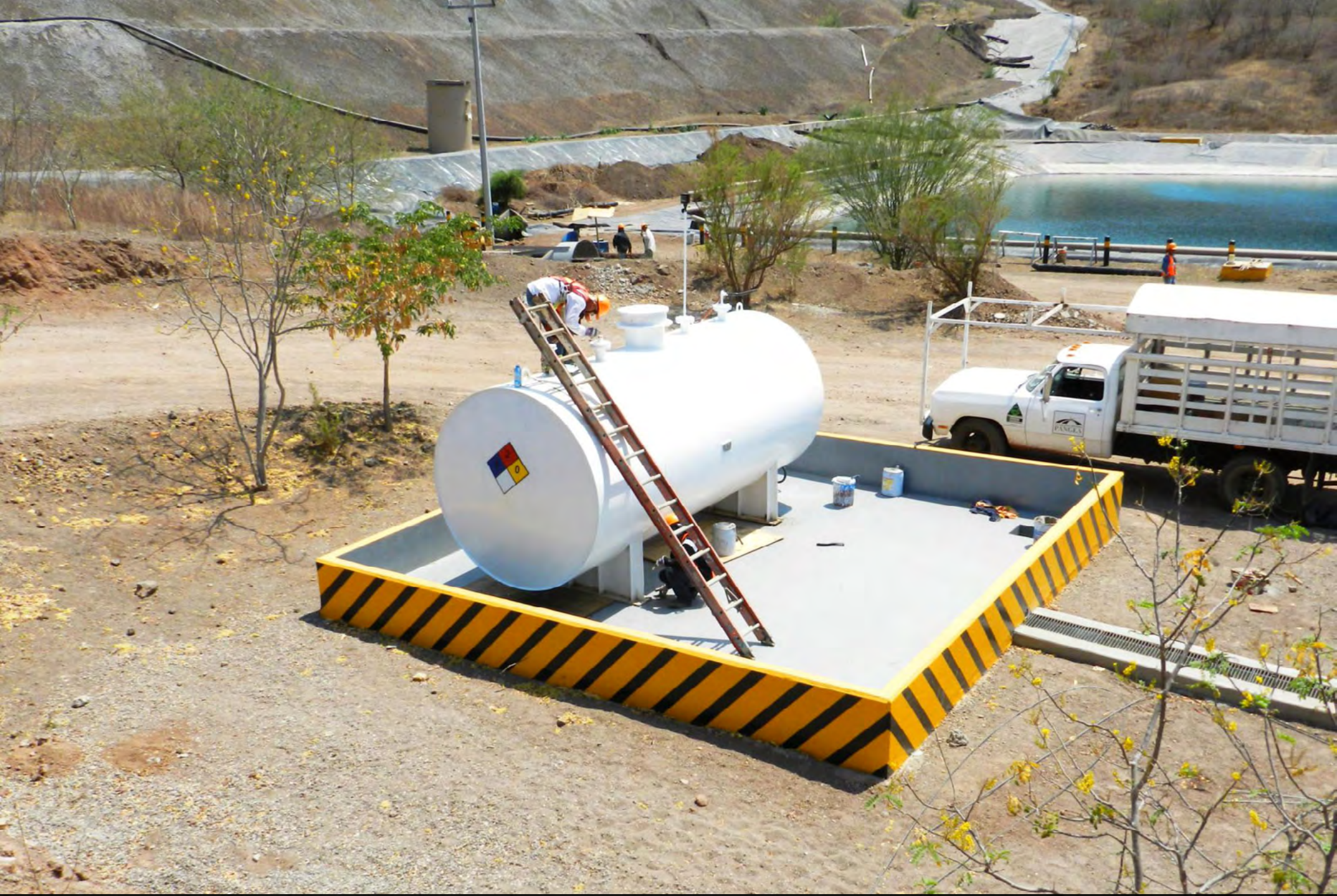
Diesel storage for process plant.