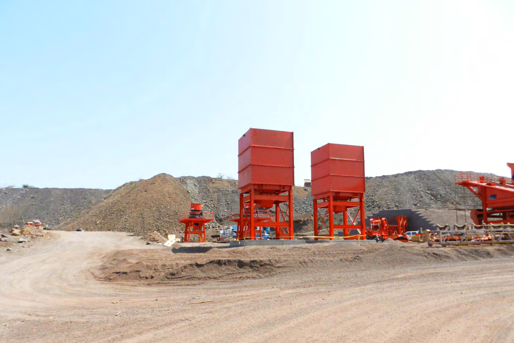
Crushing plant assembly.