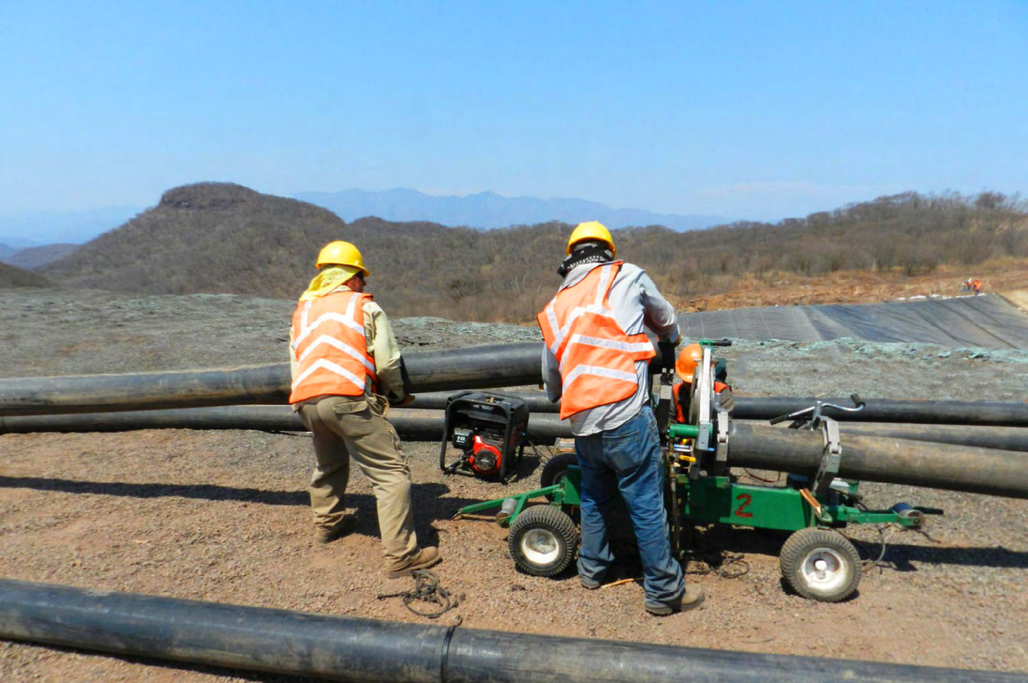
Cutting pipes for heap leach.