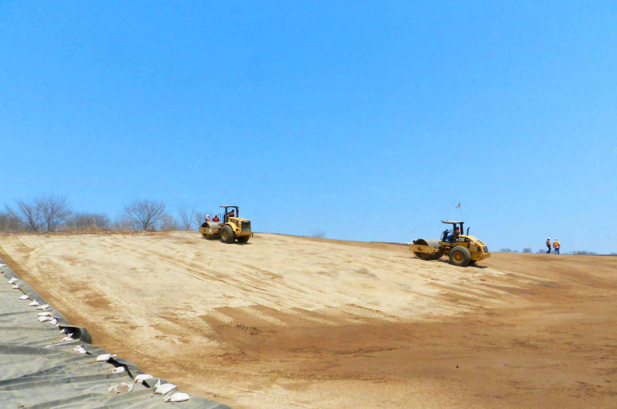
Applying clay foundation.