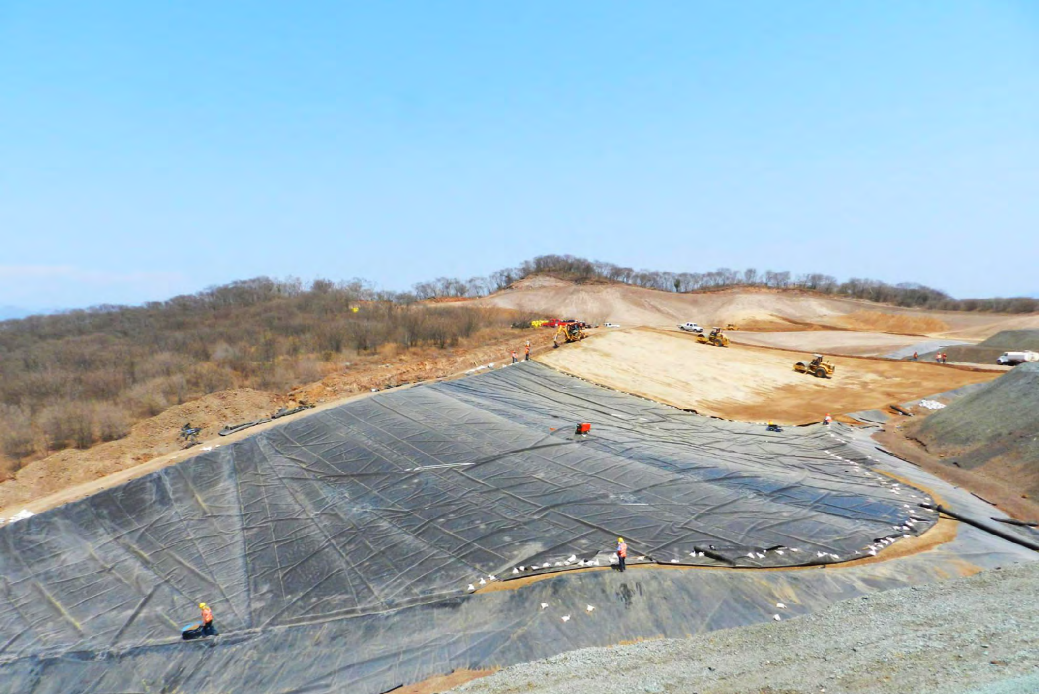
Installing heap leach liner.