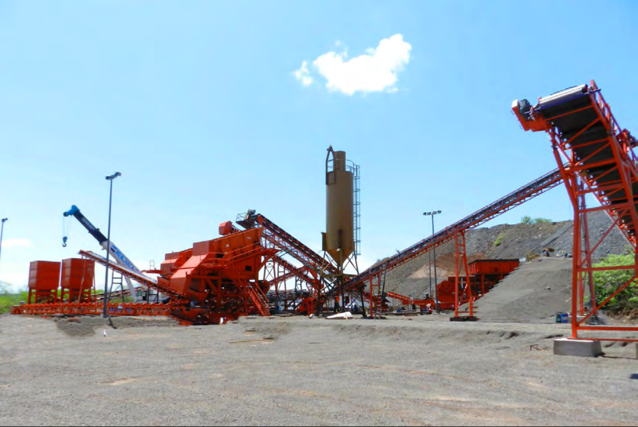
Final assembly of crushing plant nears completion.