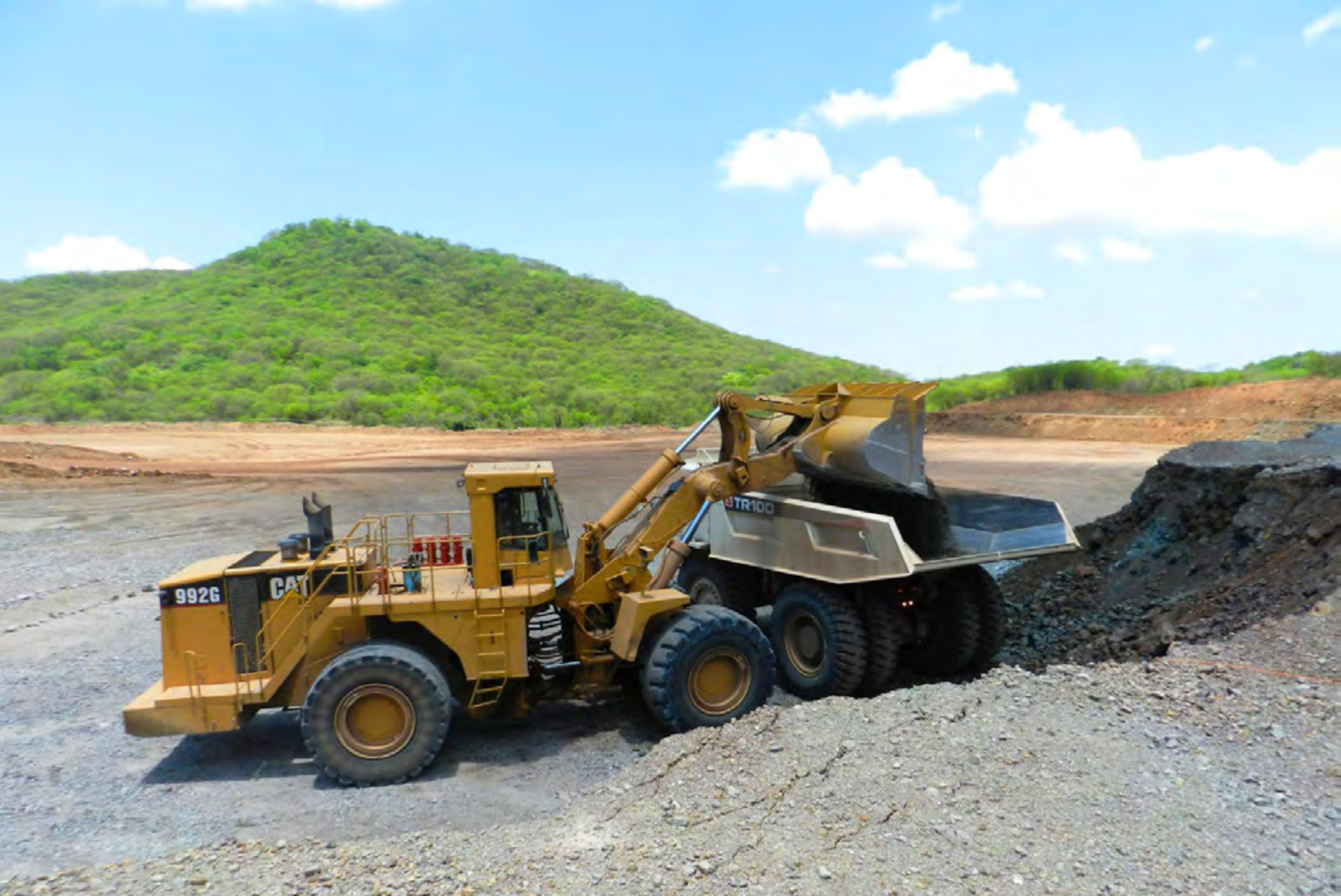
Pre-stripping at Samaniego open pit continues.