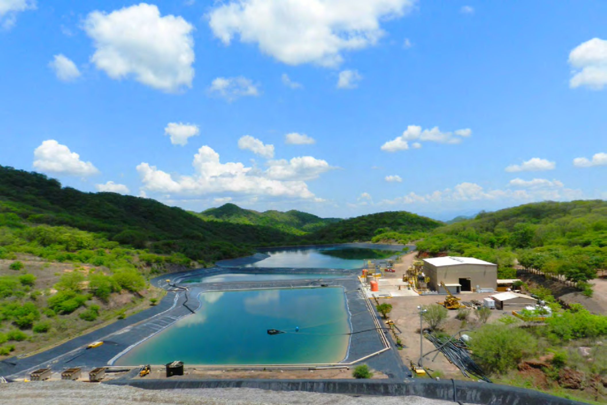
Overlooking the process plant and ponds.