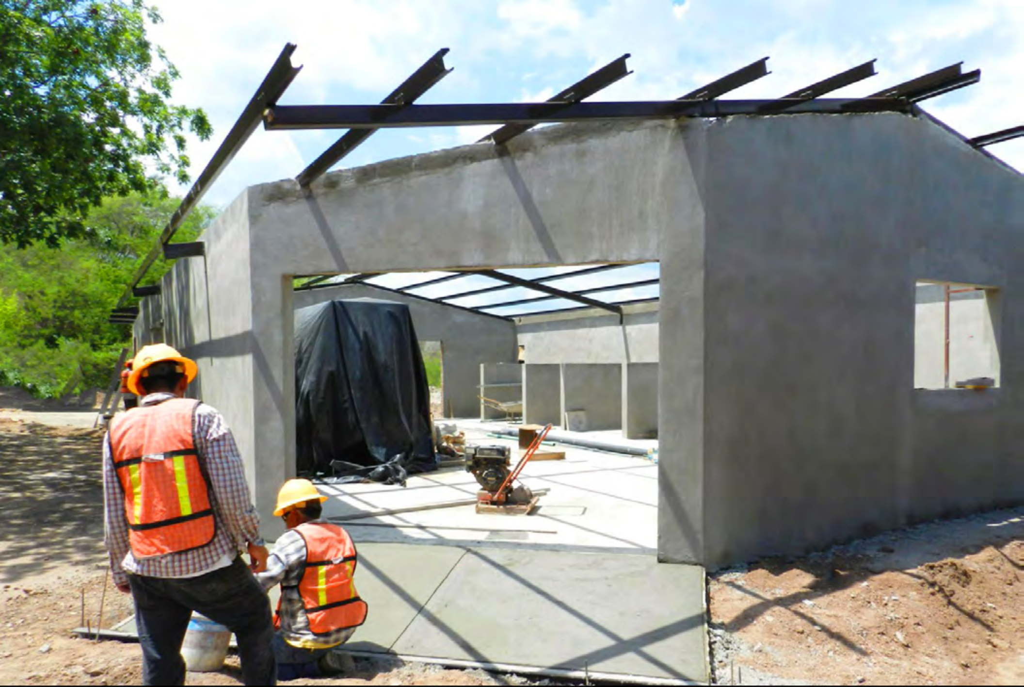
Assay lab expansion.