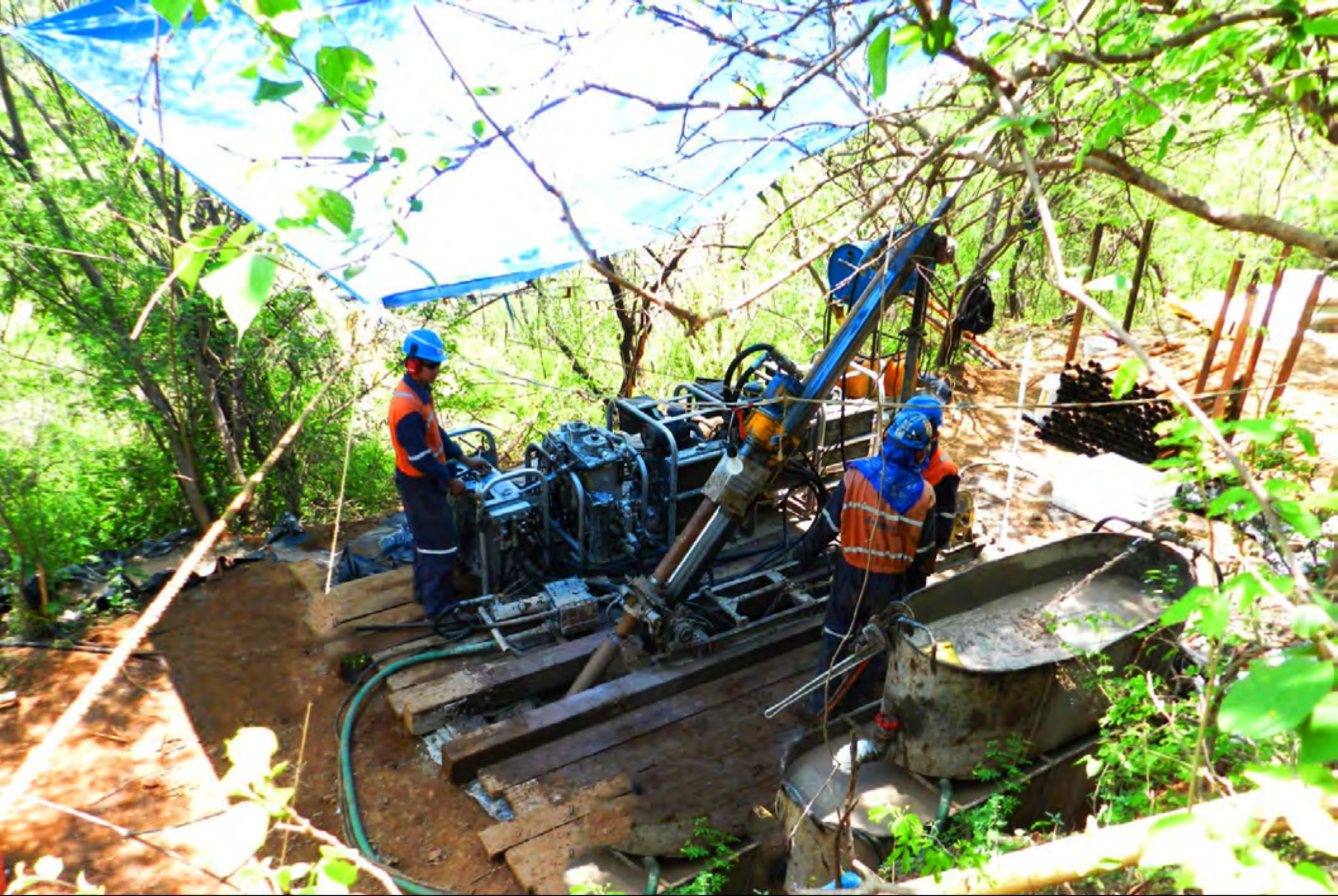
Exploration core drilling at the Phase 1 production area.