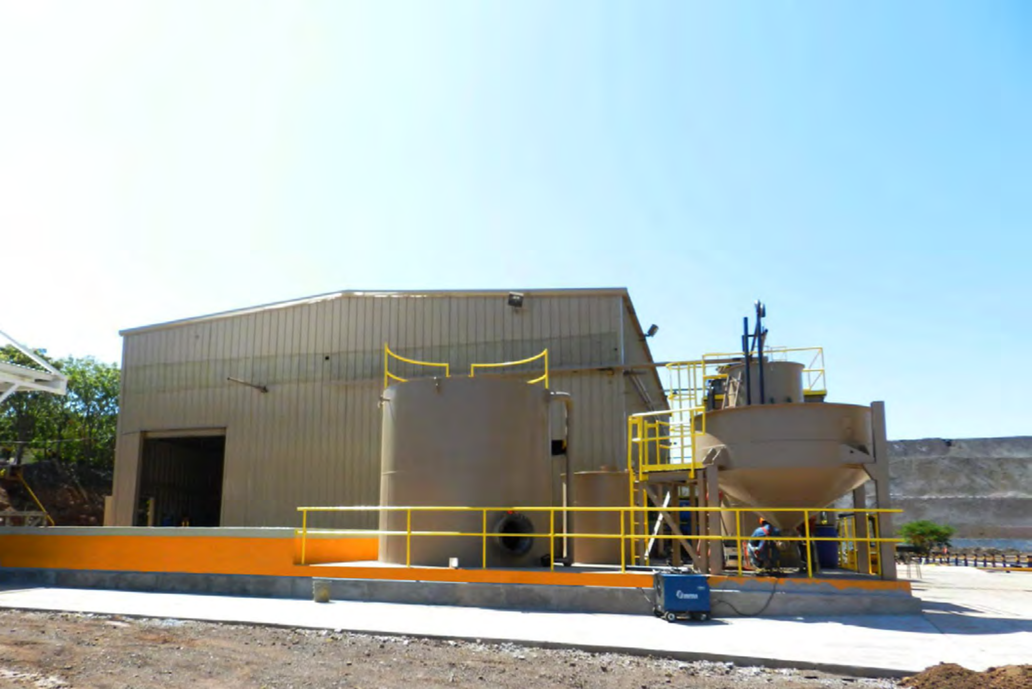
Finalizing ADR process plant.