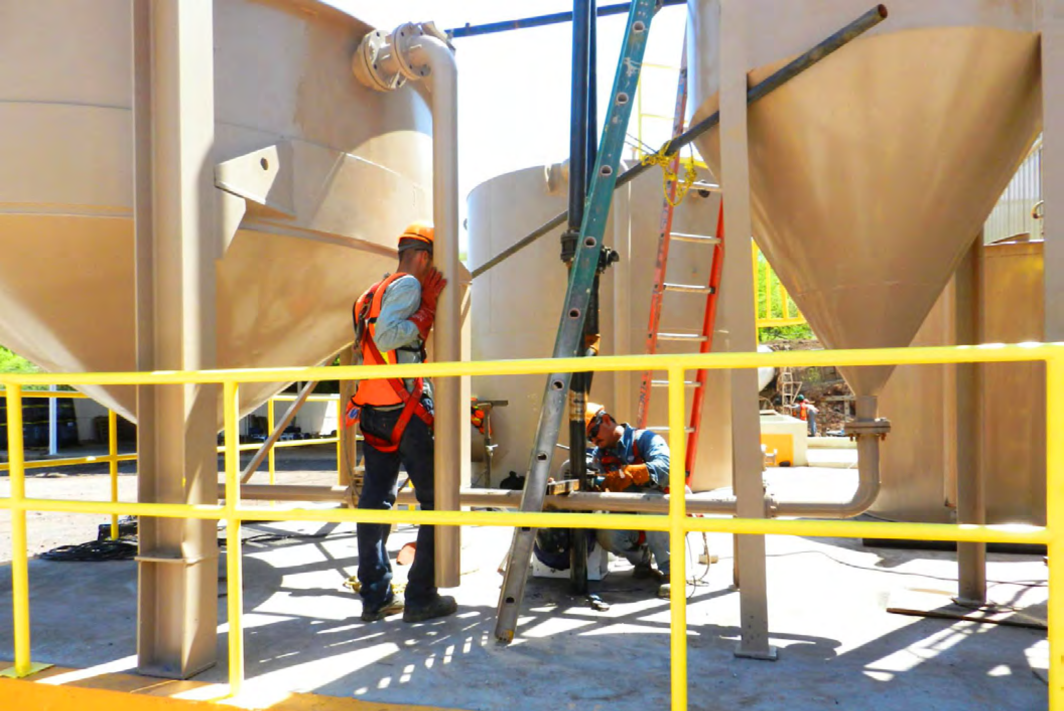
Finalizing ADR process plant.