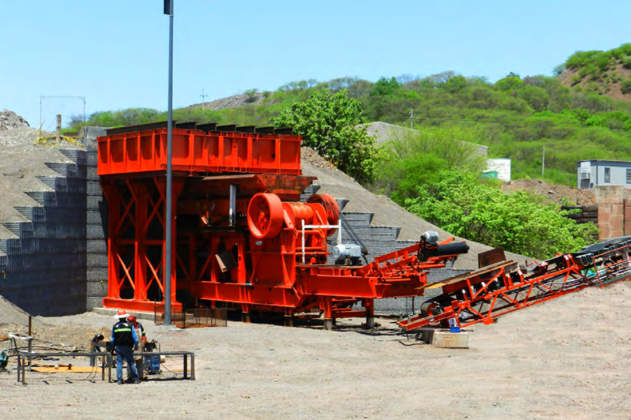
Final assembly of primary crusher.