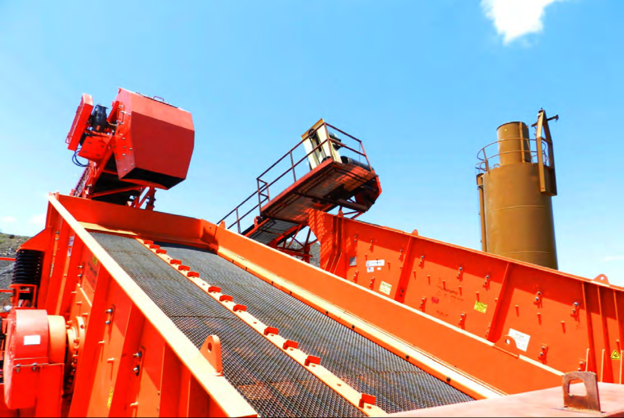
Installation of vibrating screens complete. Lime silo in background.