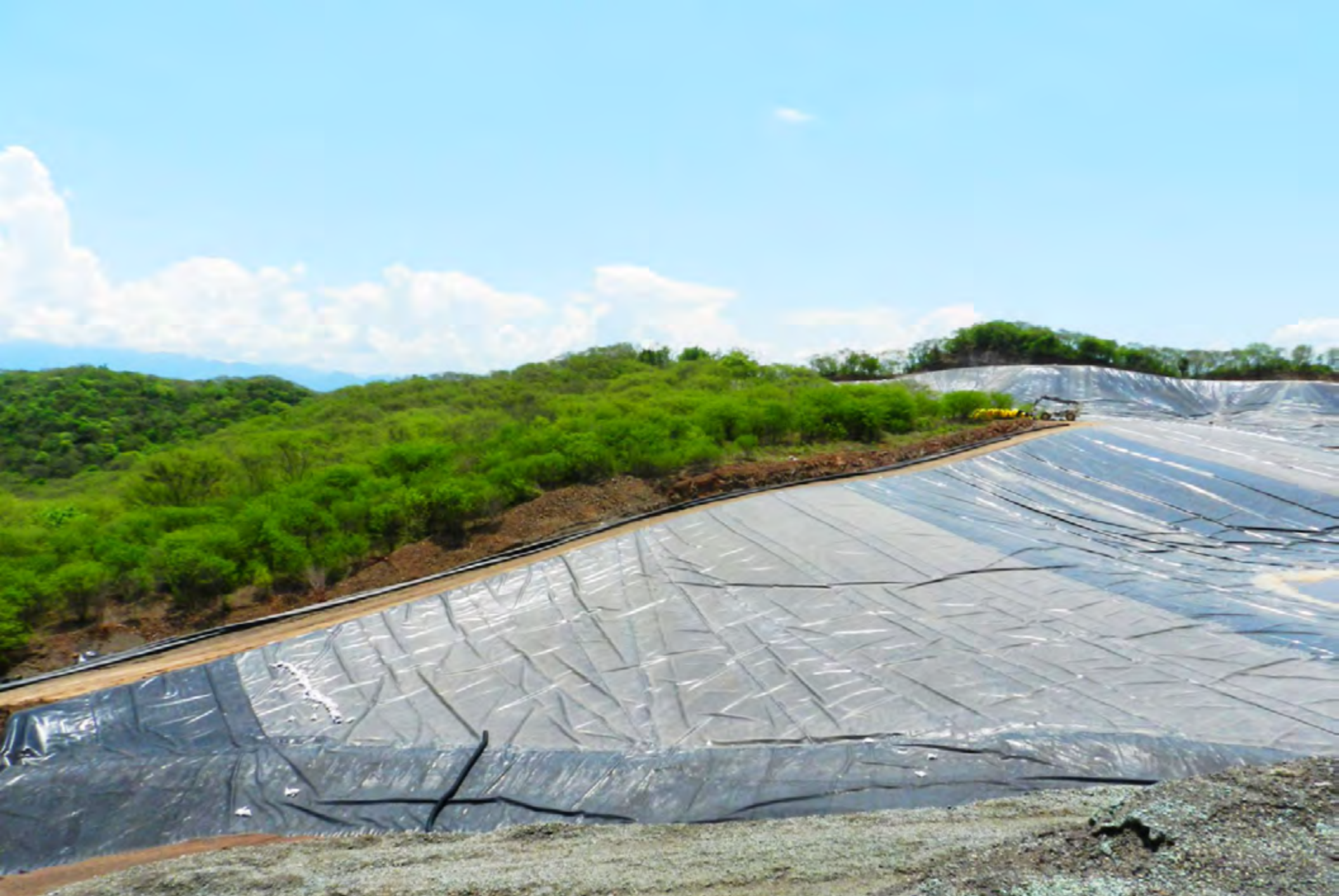
Heap leach pad expansion nears completion.