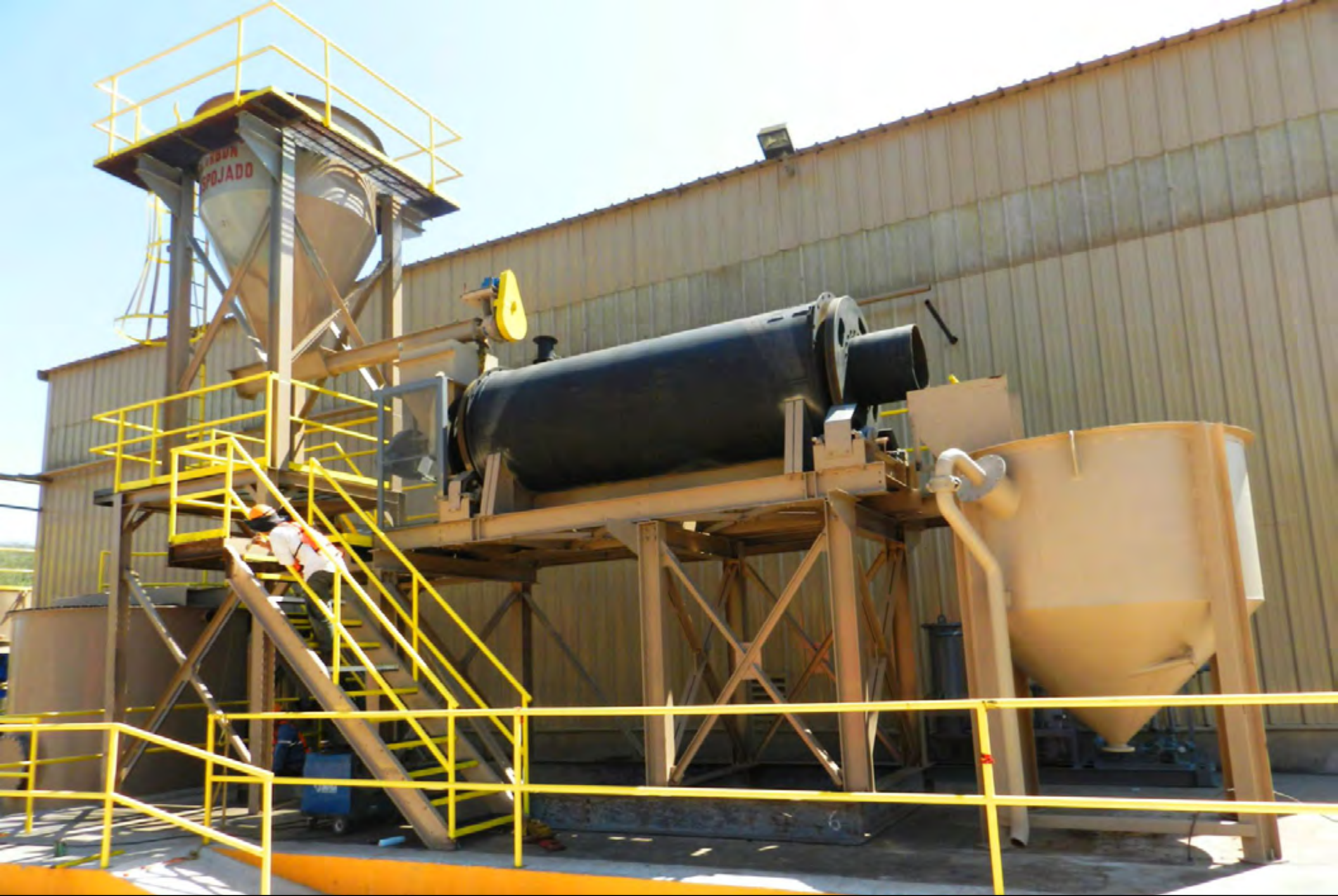
Finalizing ADR process plant.