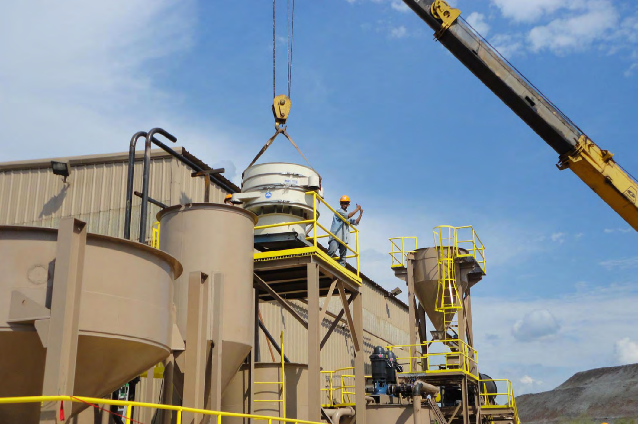
Final assembly of process plant.