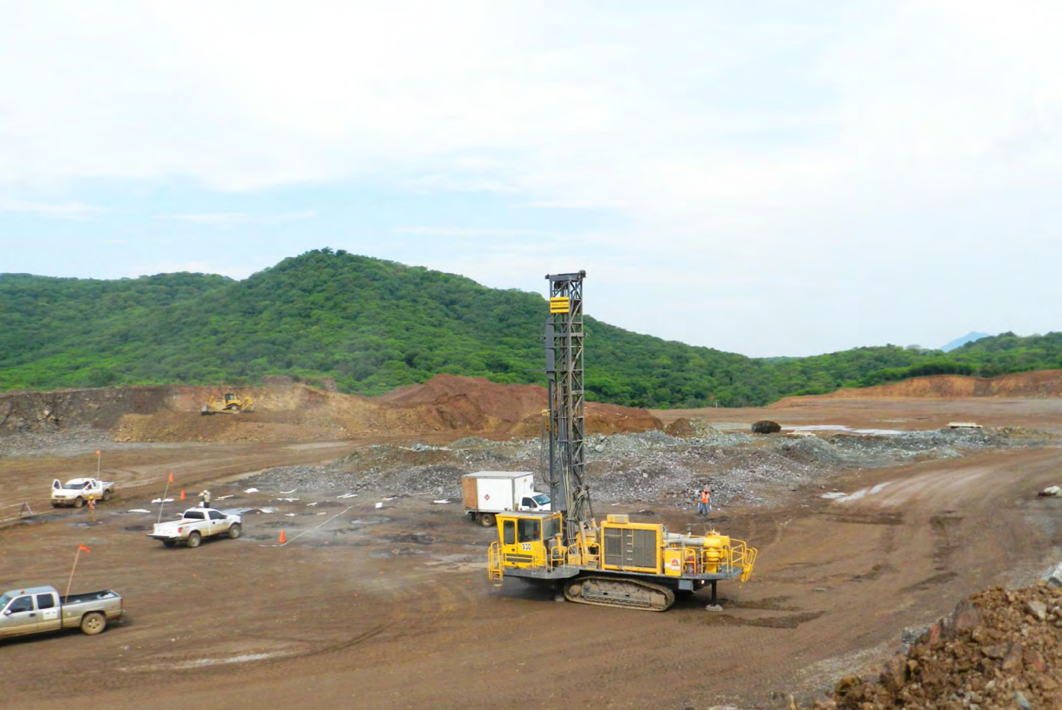
Blast hole drilling in the Samaniego open pit.