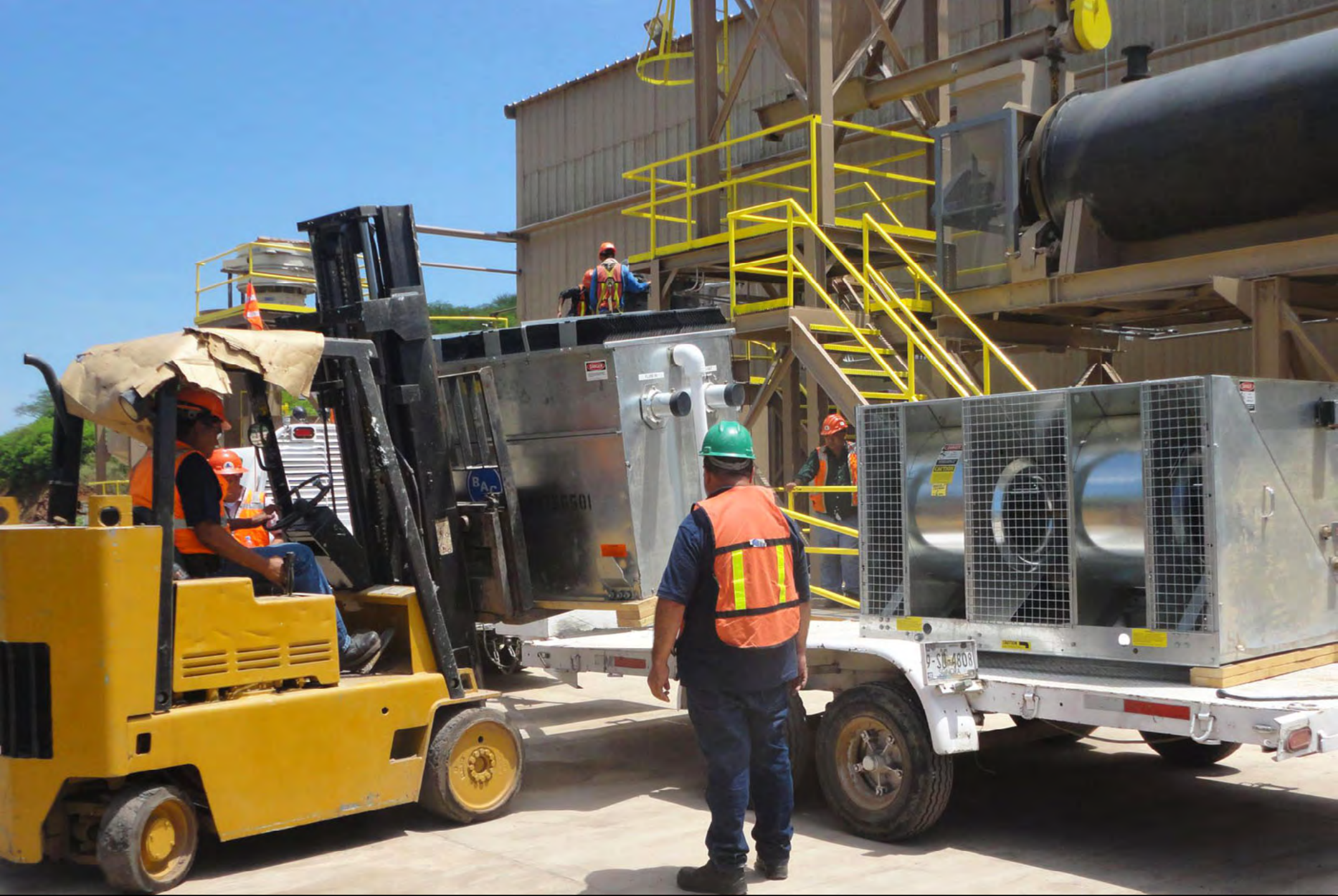
Final assembly of process plant.