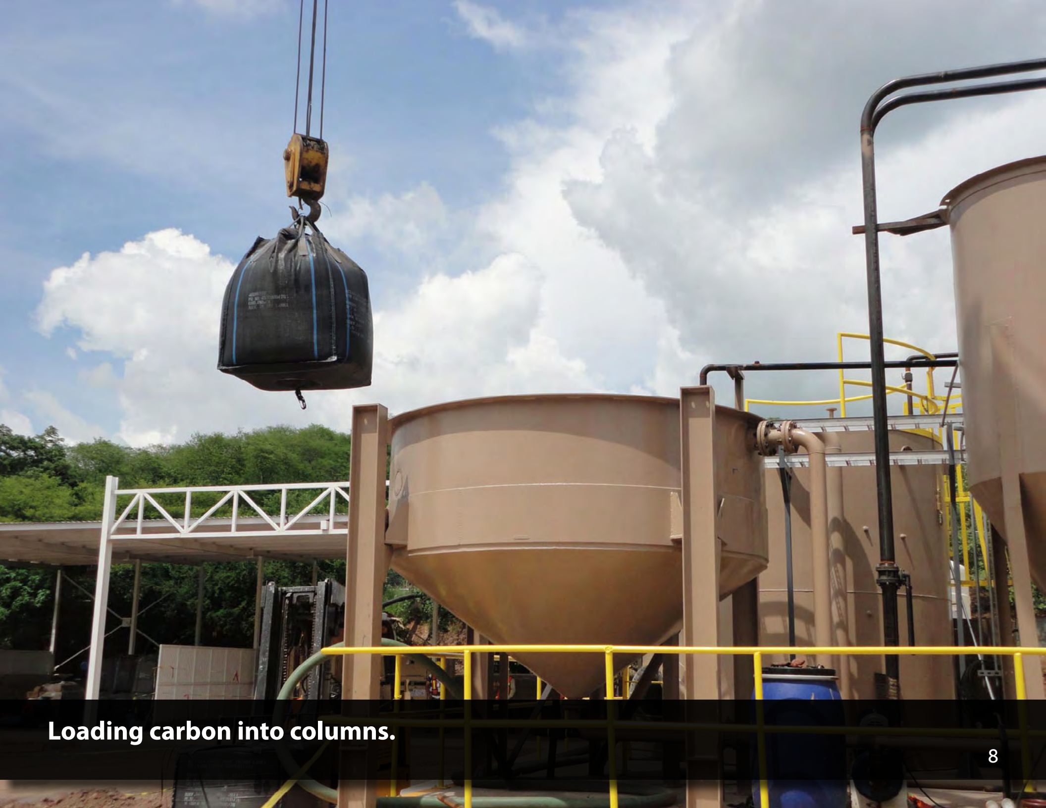
Loading carbon into columns.