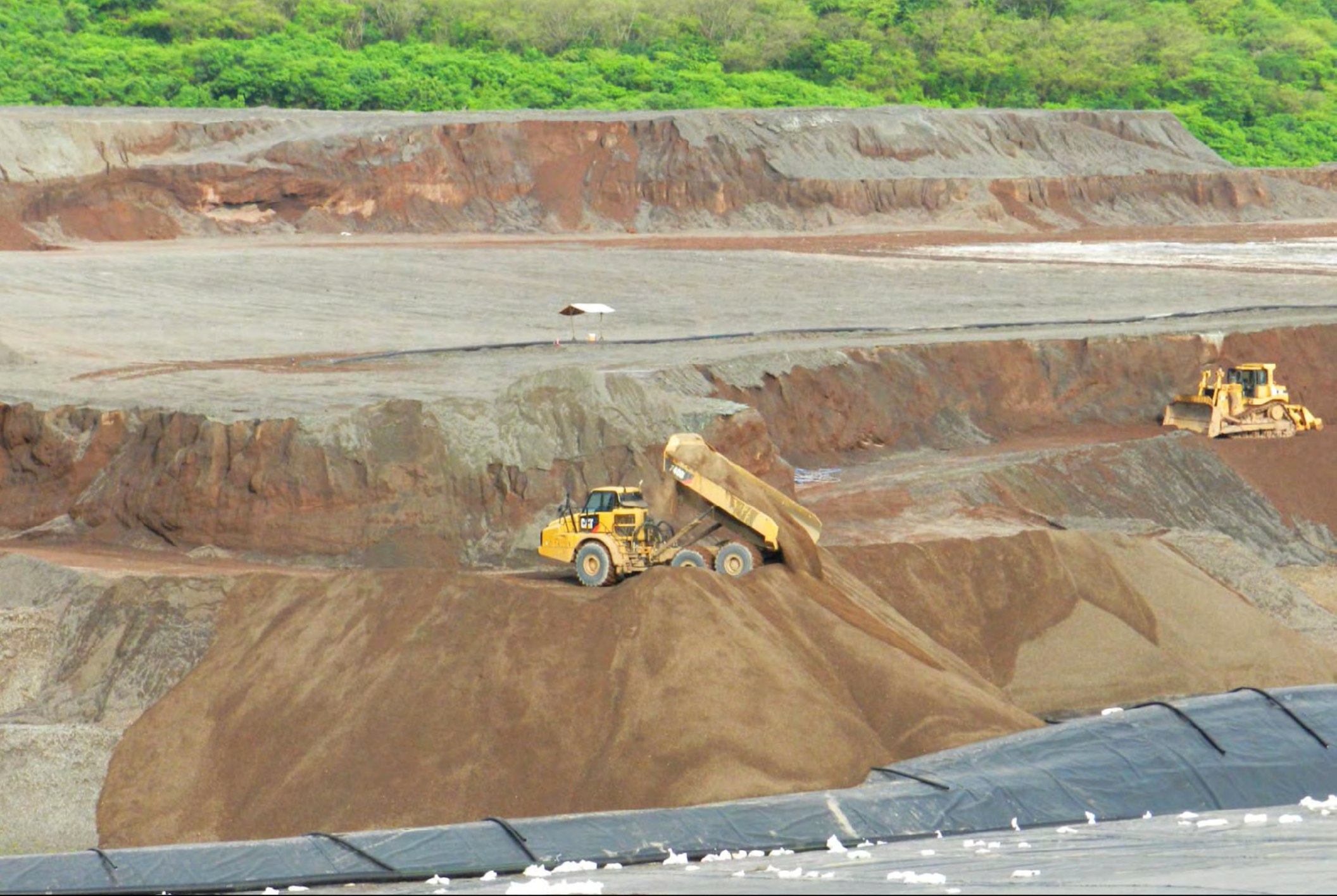
Placing gold mineralization onto the heap leach pad.