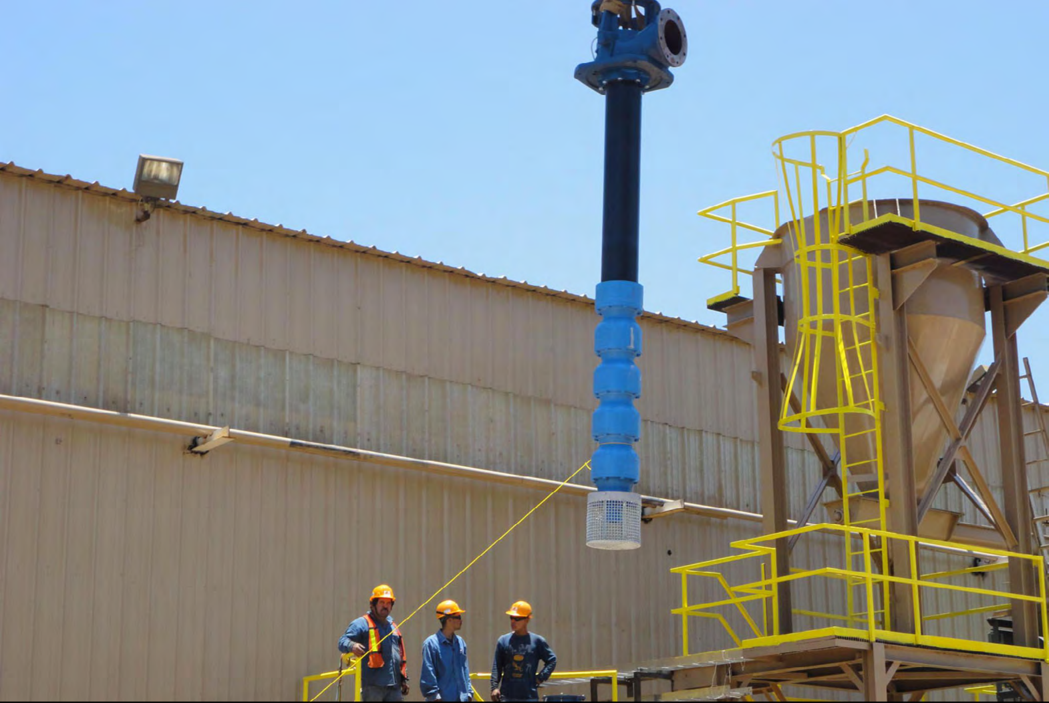
Final assembly of process plant.