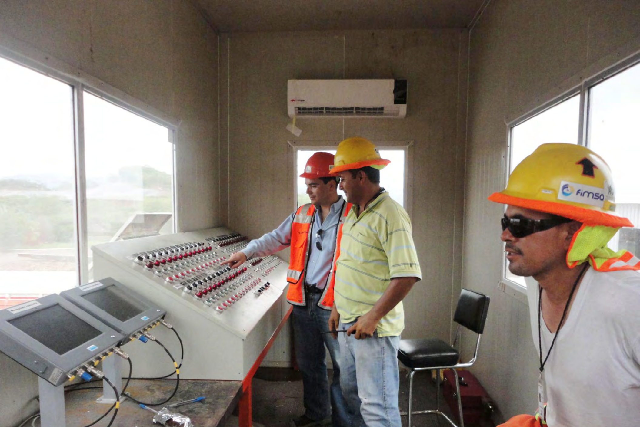
Control room for crushers.