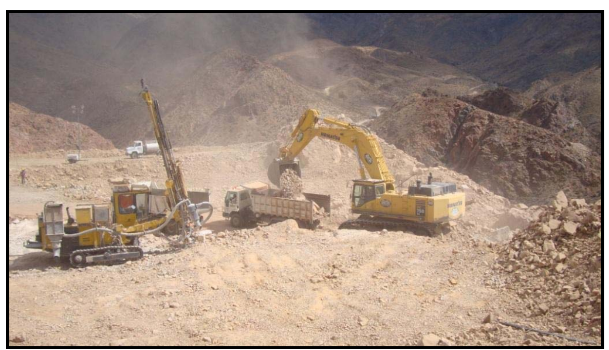
Kamila open cut pre-strip.