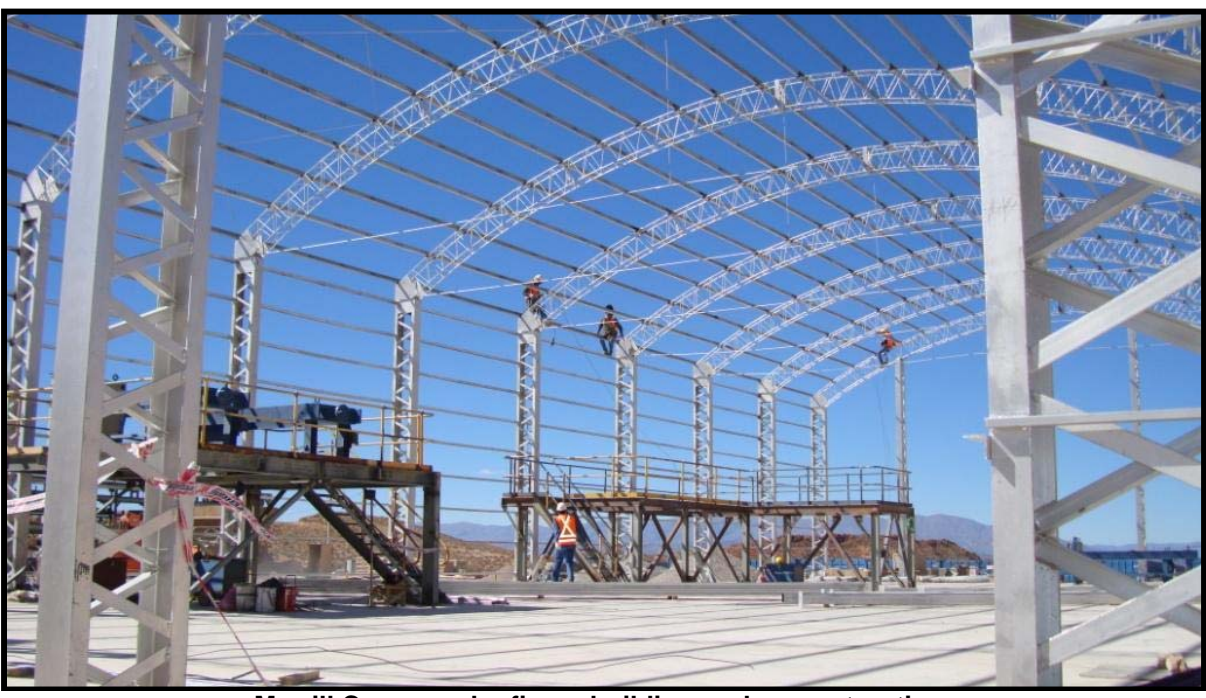
Merrill Crowe and refinery building under construction.