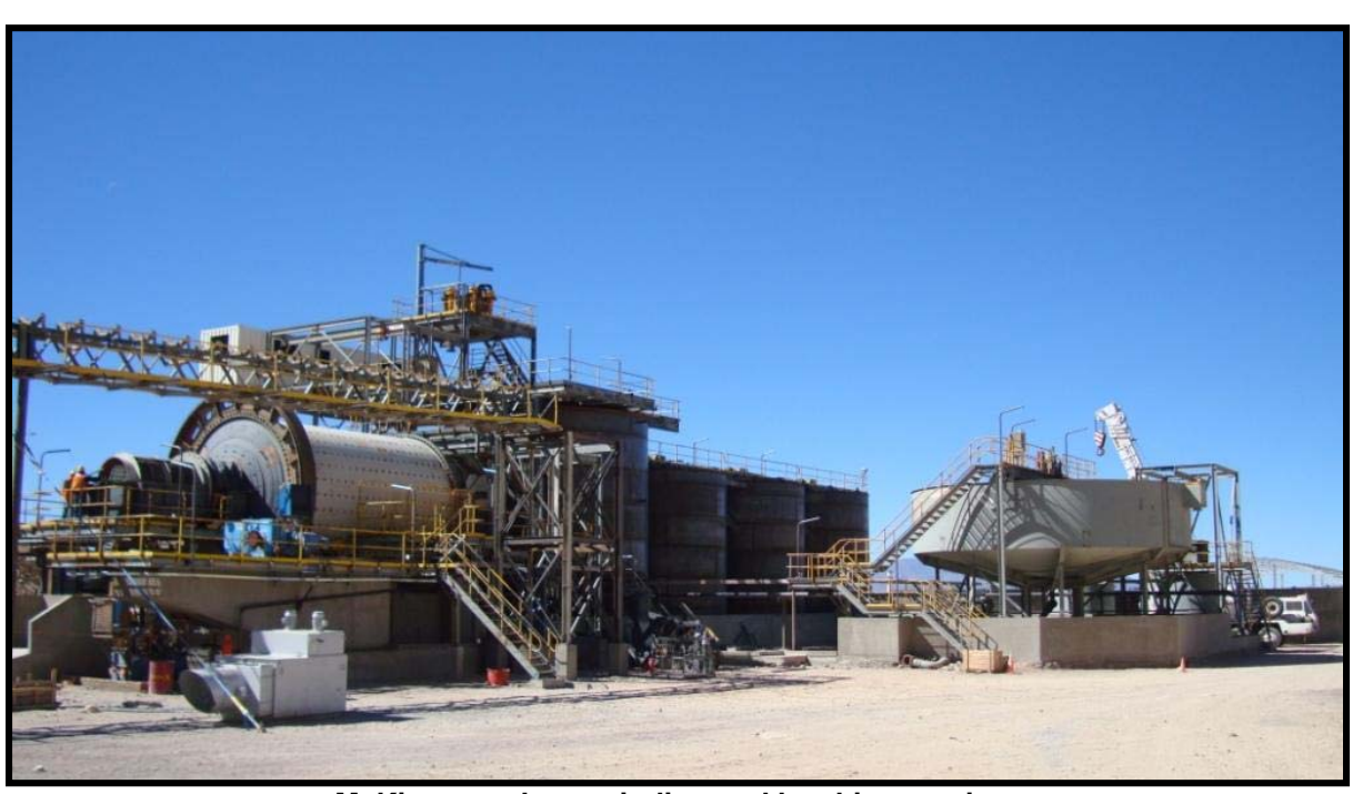
McKinnons plant, grinding and leaching section.