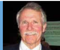
John Kitzhaber, current governor of Oregon-Key Note speaker Reno Conference spoke to attendees about health care reform. He is best known for his work on initiating the Oregon Health Plan.

During the 2009 conference held in Reno, Nevada, hundreds of attendees from many countries were brought together to hear about the latest advances in biomedical research. Attendees had the opportunity to hear about current research and interact with leading researchers, clinicians, and those suffering from these debilitating illnesses. A million dollar research fund for ME/CFS studies was created by the Board of Directors of IACFS/ME to be directed toward innovative small research projects.