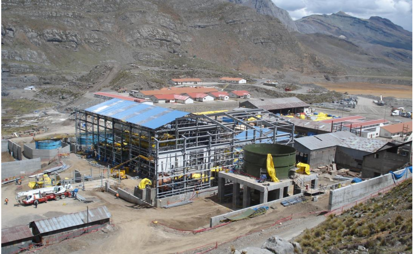
Figure 1: Construction of the Santander mill and concentrate production facilities