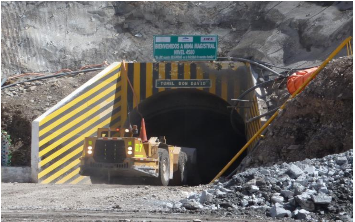
Figure 2: Newly constructed Portal at Magistral Central deposit, Santander Mine, Peru