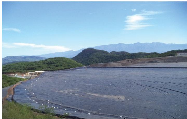
El Gallo 1 mine heap leach pad expansion completed.