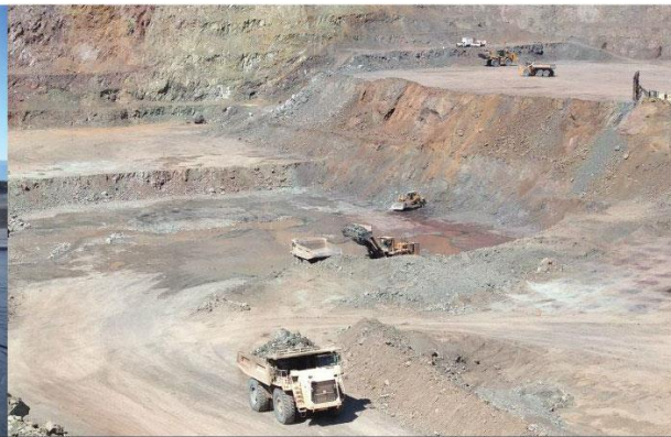
Pre-stripping ramping up to support higher throughput in 2014.