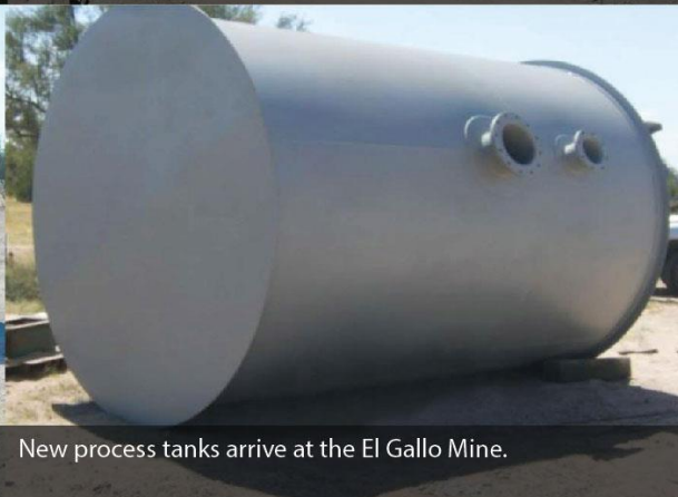
New process tanks arrive at the El Gallo Mine.