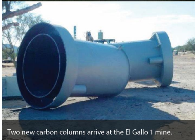
Two new carbon columns arrive at the El Gallo 1 mine.