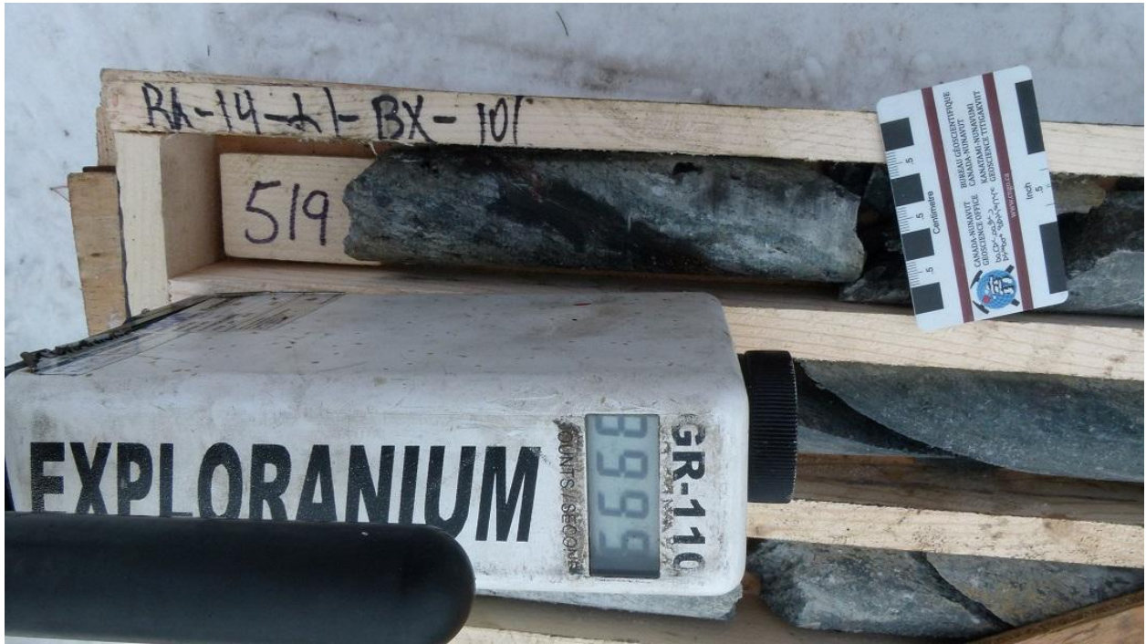
Fig 4 Arrow: Off-scale pitchblende mineralisation within chloritised shear in RK-14-21, 544 m downhole