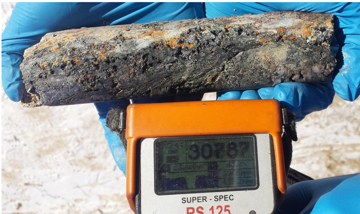
Fig 3 Arrow: detail of pitchblende vein, RK-14-27, 250m