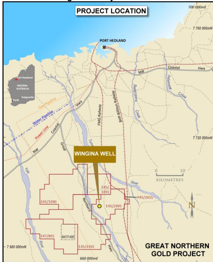
Figure 1: Project location