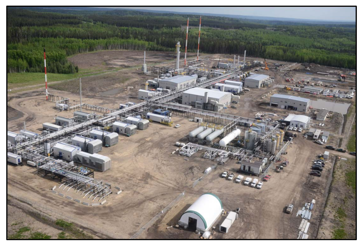
Paramount's 8-13 Musreau Complex: 45 MMcf/d Refrigeration Facility (foreground) & 200 MMcf/d Deep Cut Facility (background)