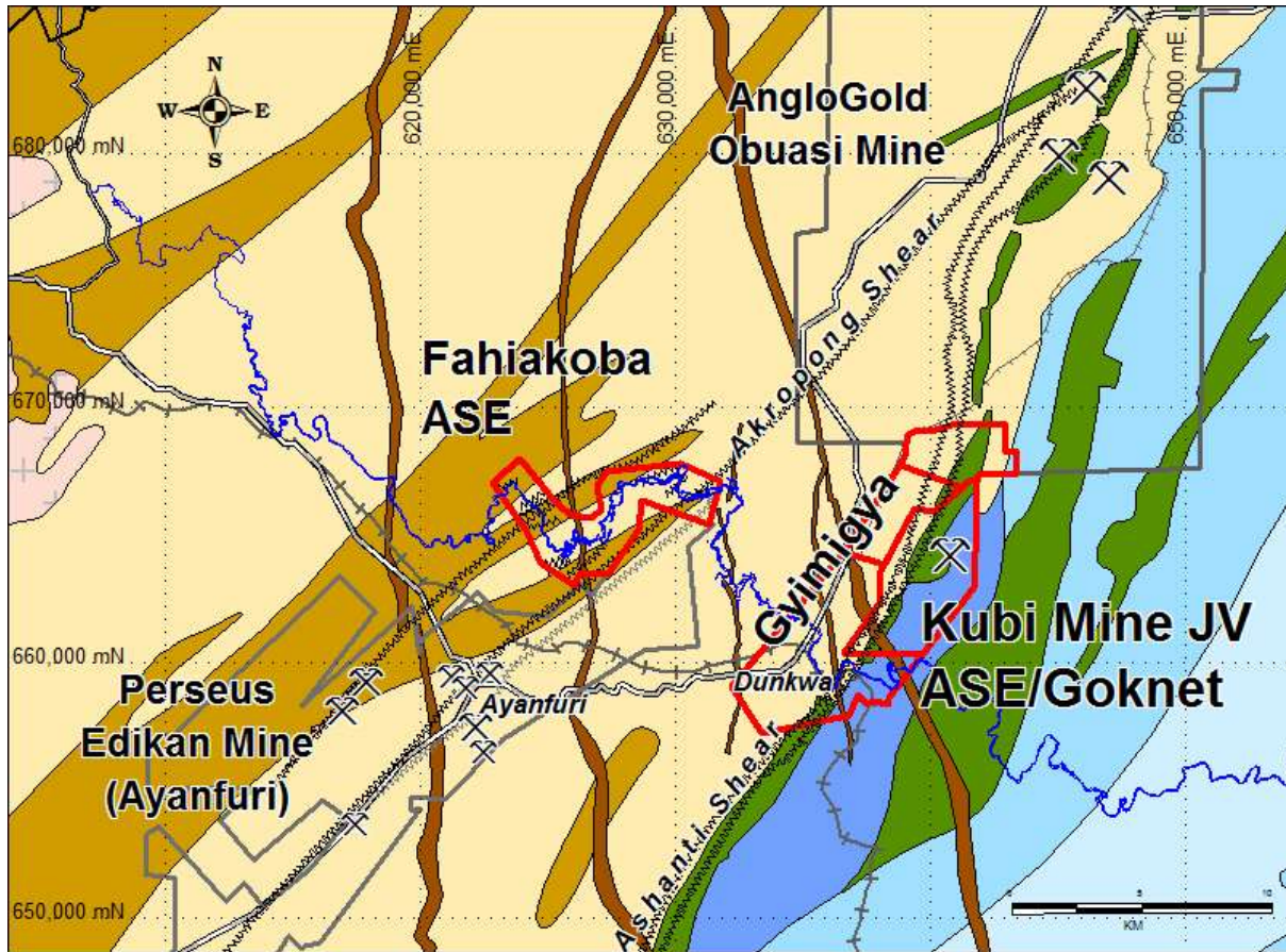
Location Map – Kubi Mine JV Gyimigya & Fahiakoba concessions on geology base (light brown Birimian meta sediments; dark green Birimian meta volcanics; blue Tarkwaian meta sediments)