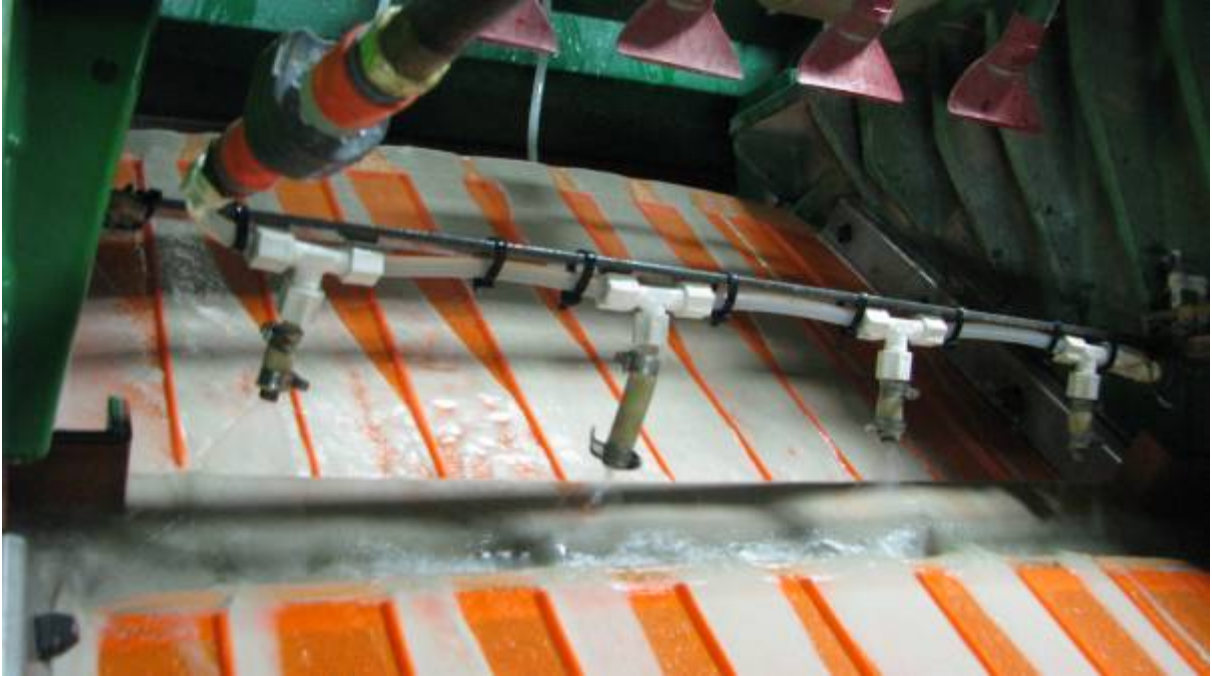
Figure 3 - Derrick Screen with mineralized material