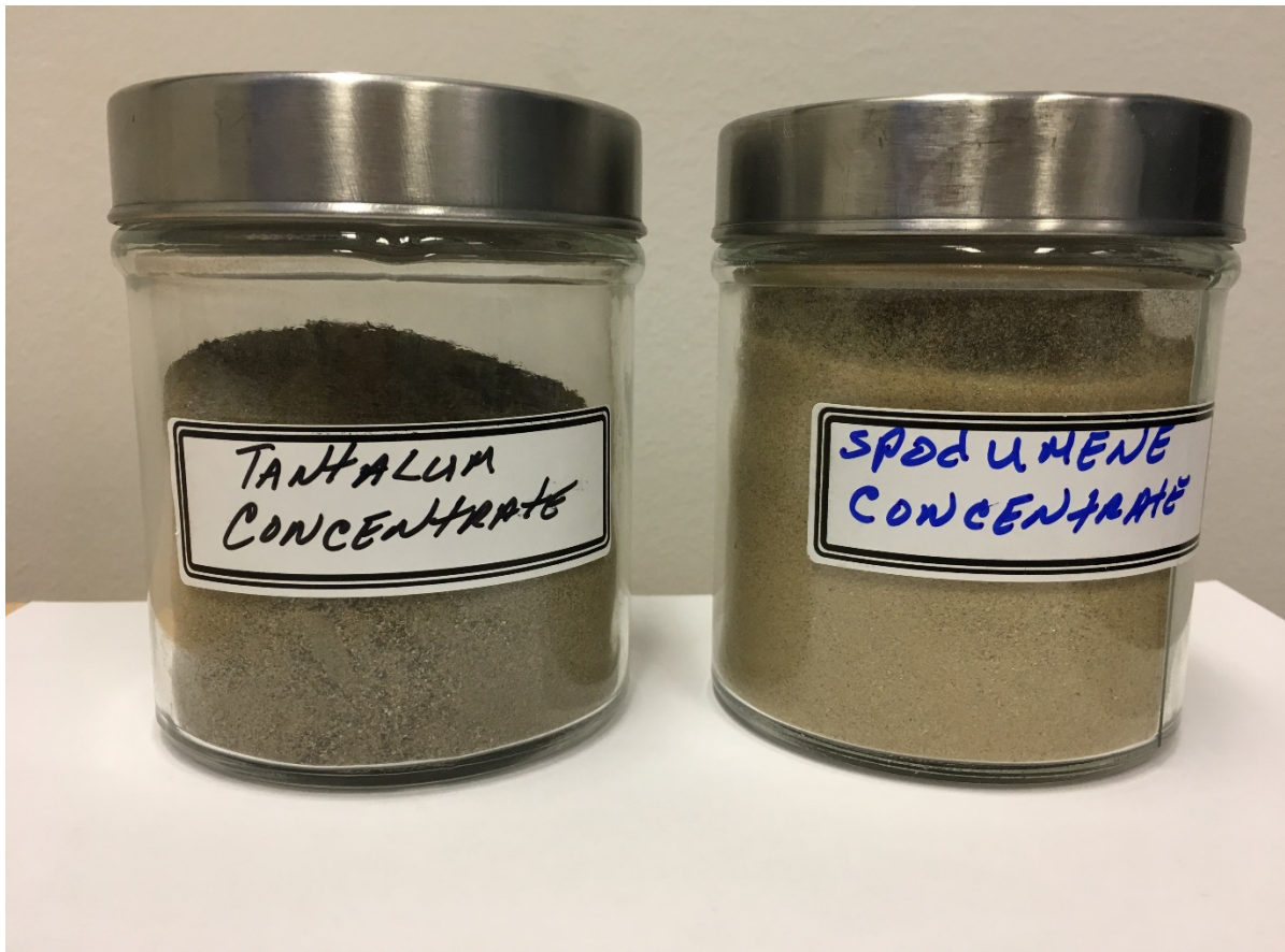
Figure 1 – Products from pilot