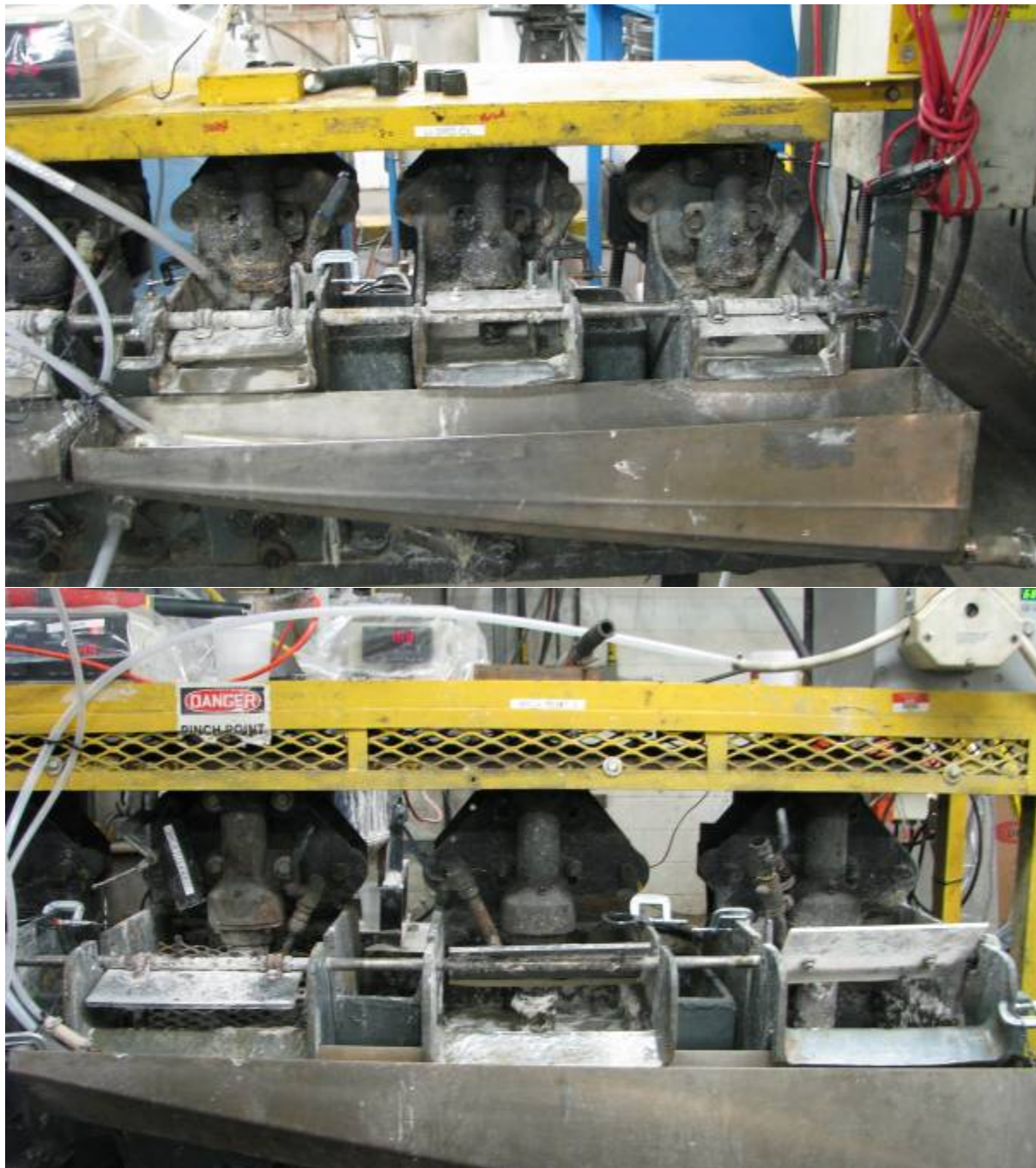
Figure 5 - Mica Flotation Cells