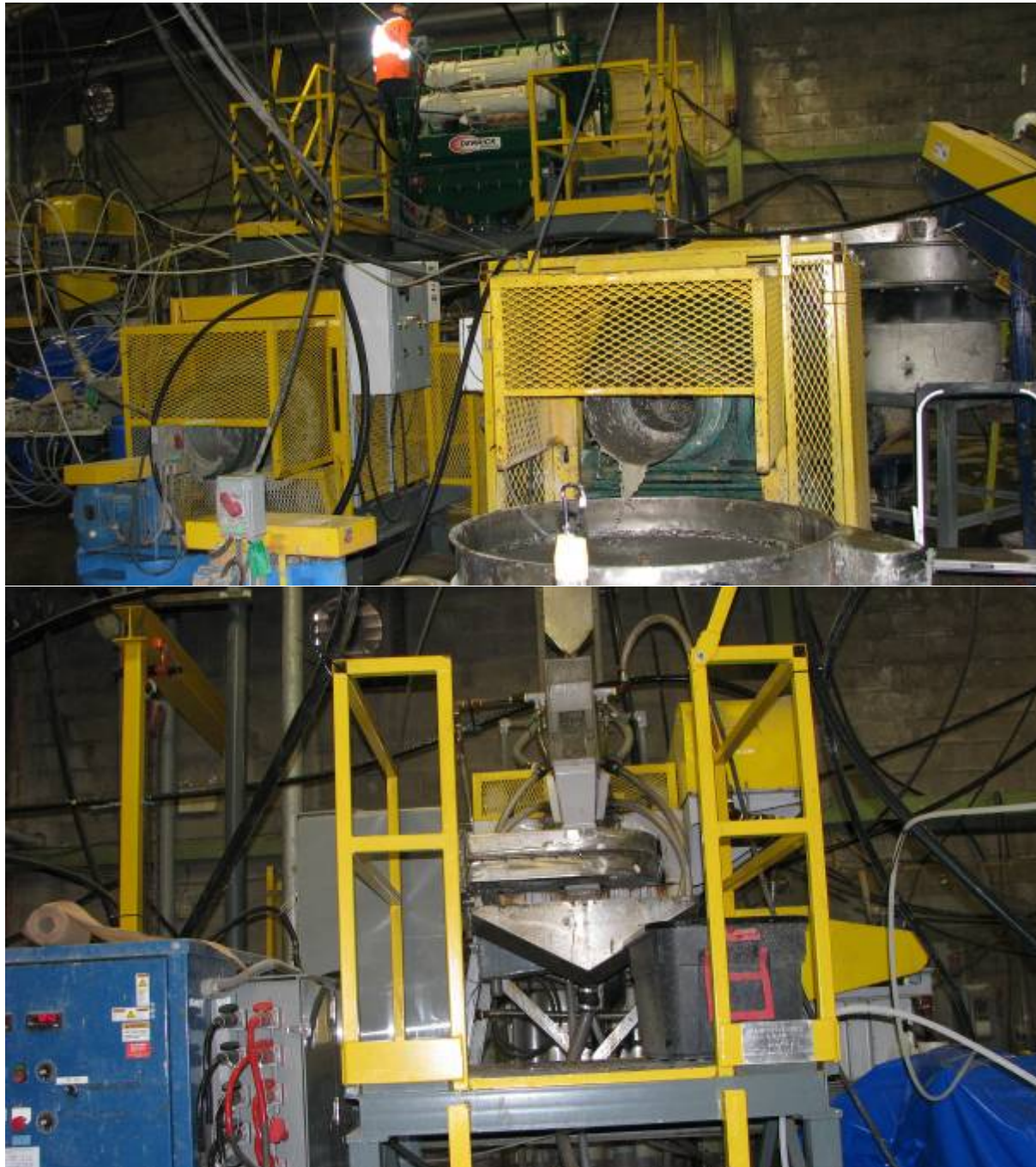
Figure 4 - Top L- R Ball Mill & Rod Mill, Bottom- Slon magnetic separator