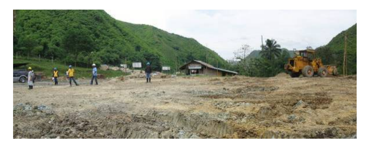
Above: the area outside the Mafoko Portal being prepared for a possible future plant.