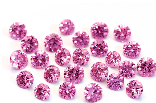
Figure 3 Rare pink Argyle diamonds