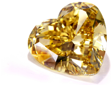
Figure 1 40-carat Heart of Gold diamond