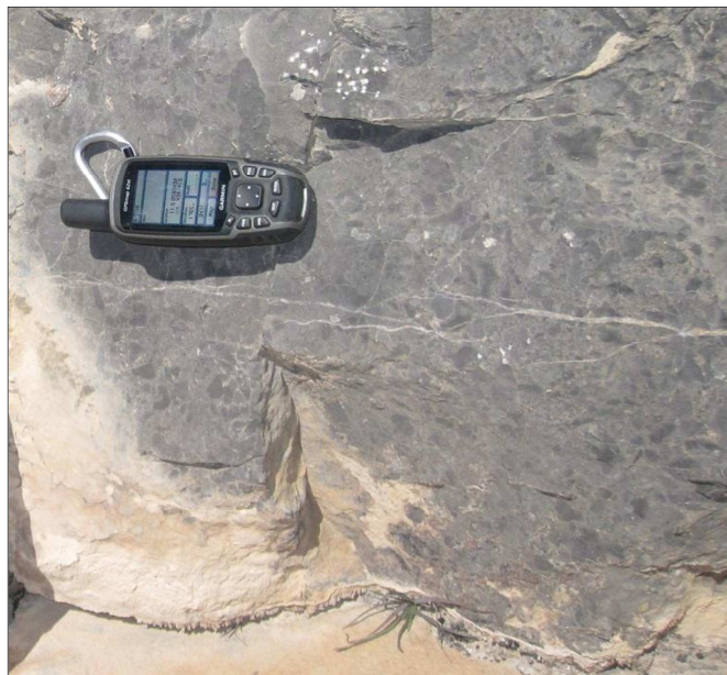
Figure 3. Carbonate debris flow sedimentary rocks of the Devils Gate Formation.