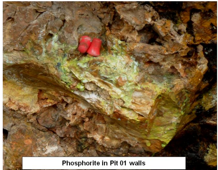
Phosphorite in Pit 01 walls