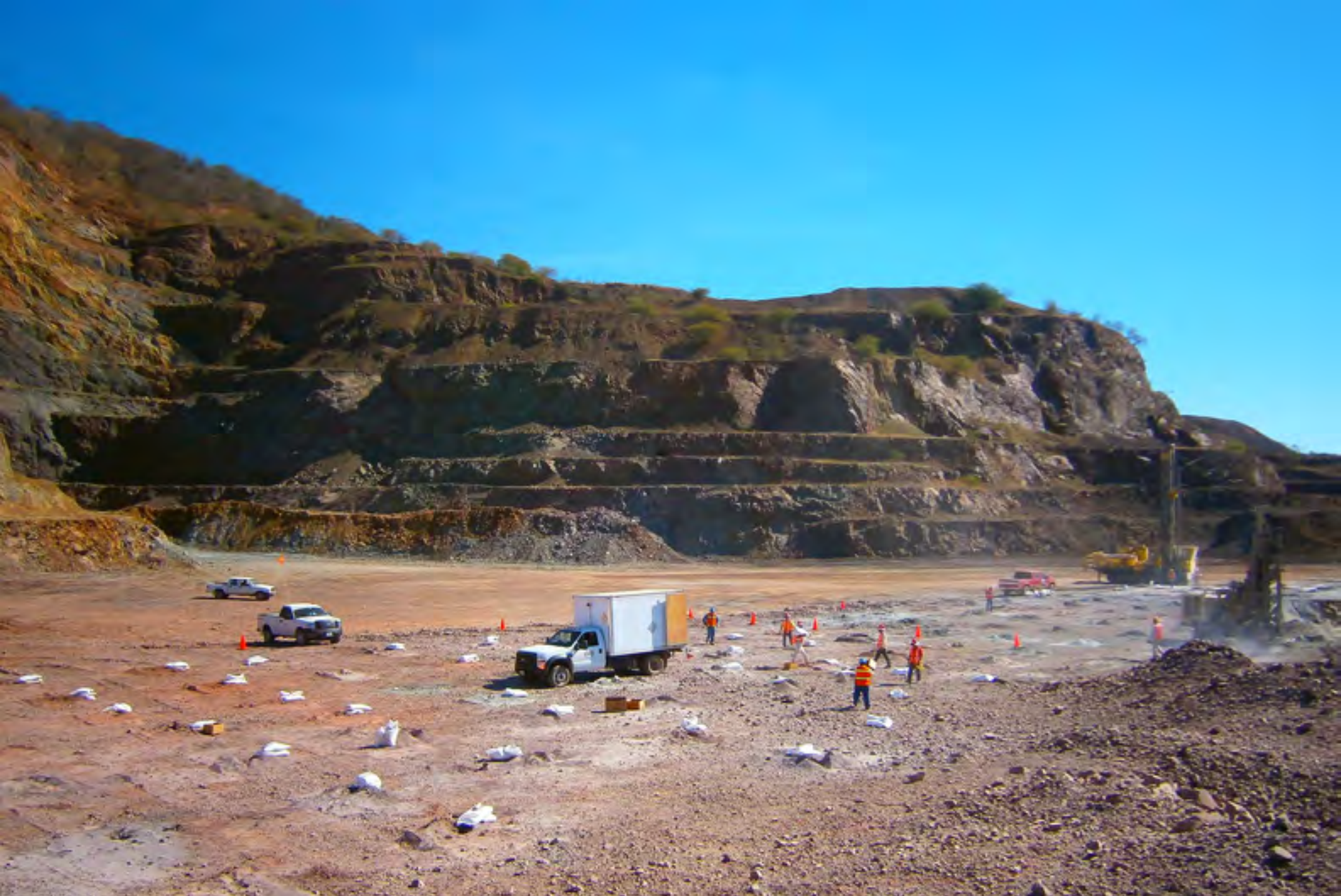
Samaniego open pit mine at full operating capacity.