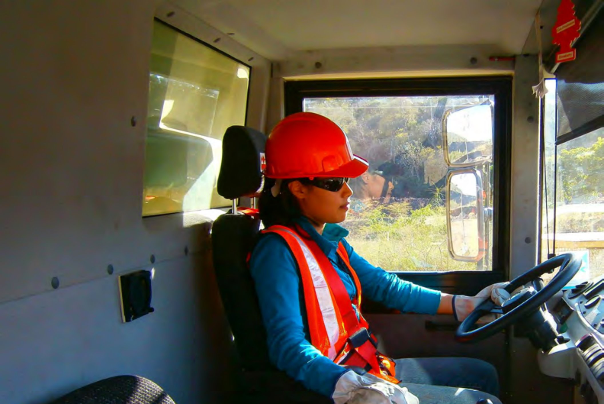
Member of our all-female 100 tonne haul truck operating team.