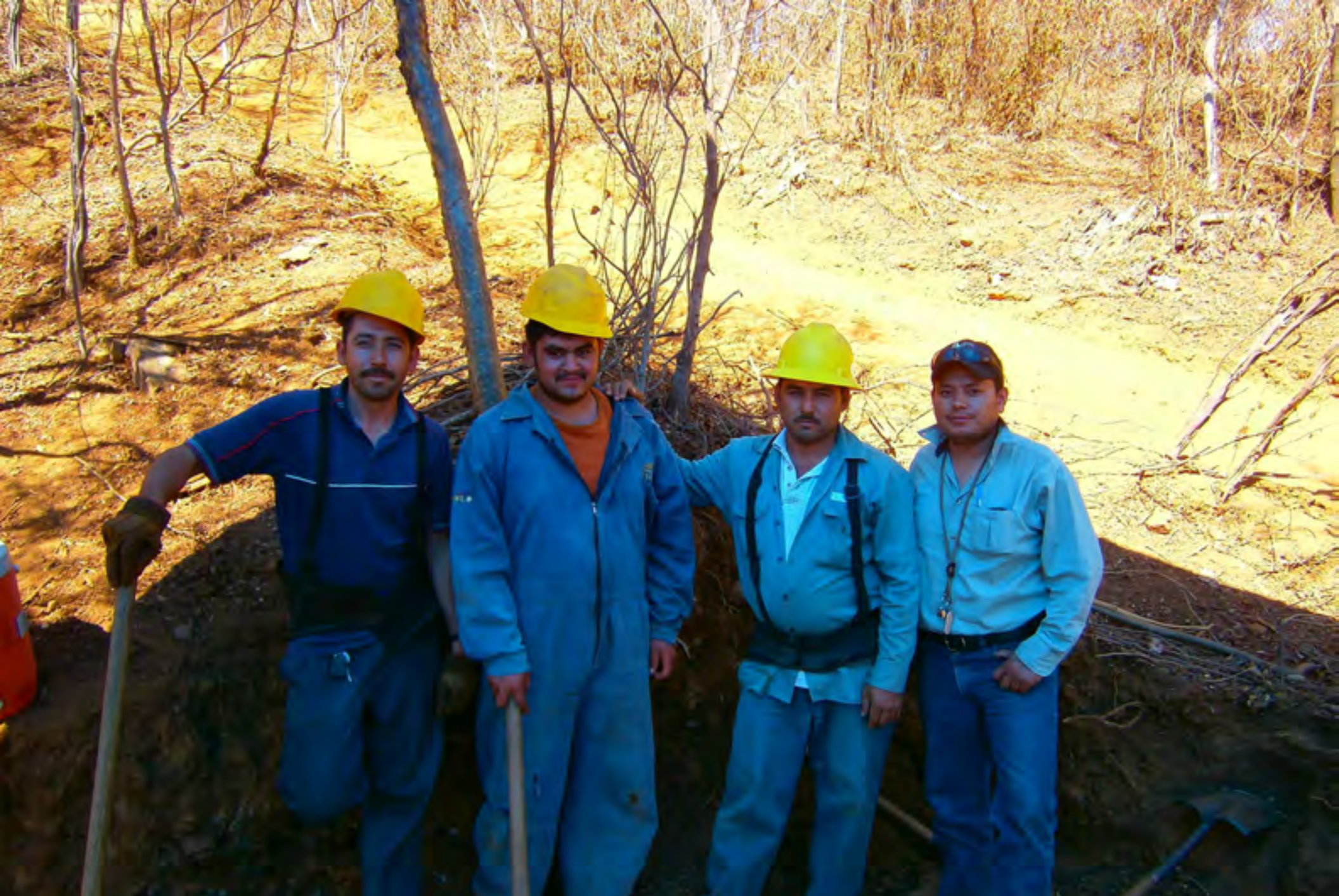
Employees building drill platforms at the new San Dimas discovery.