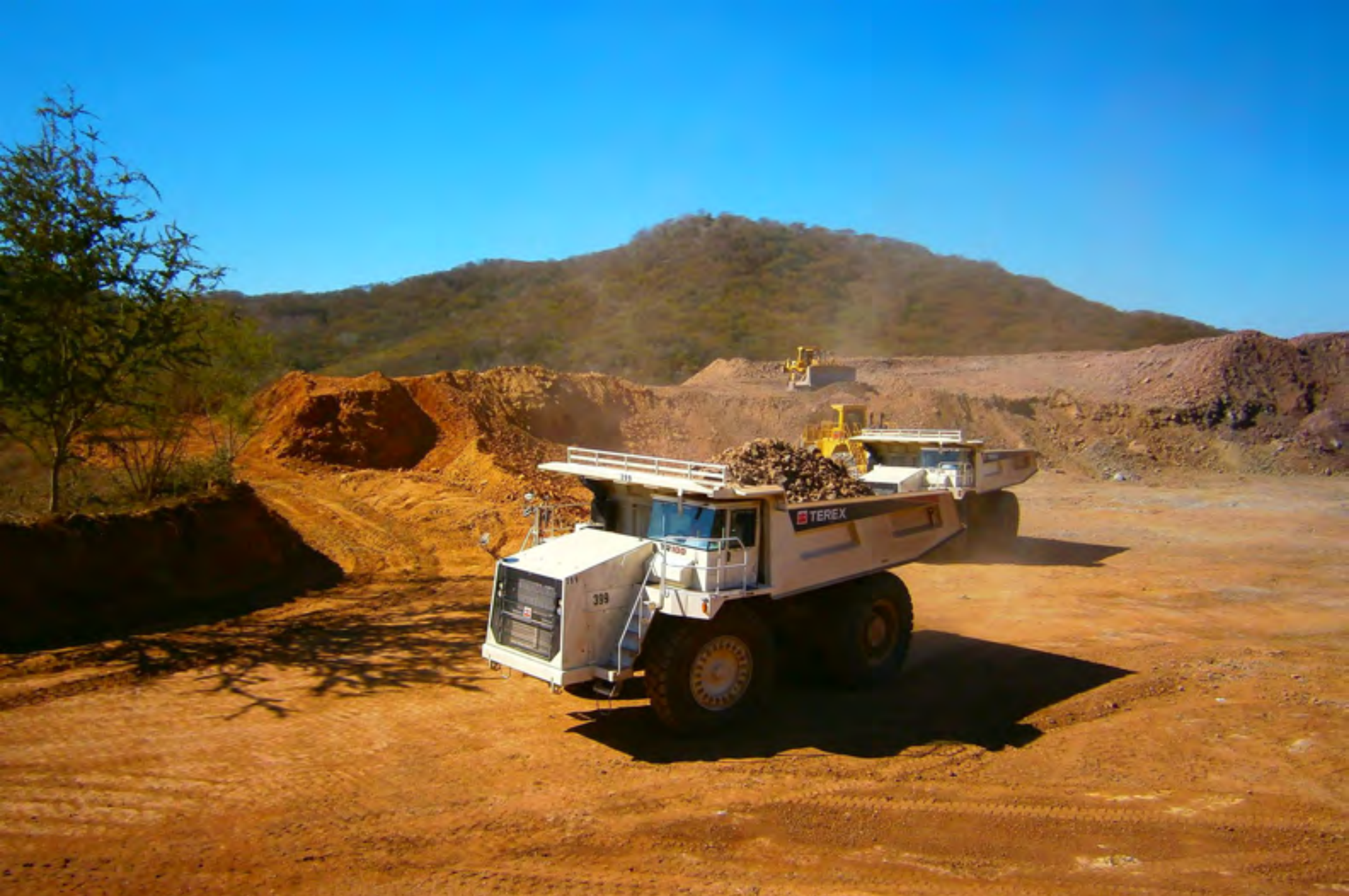
Samaniego open pit mine at full operating capacity.