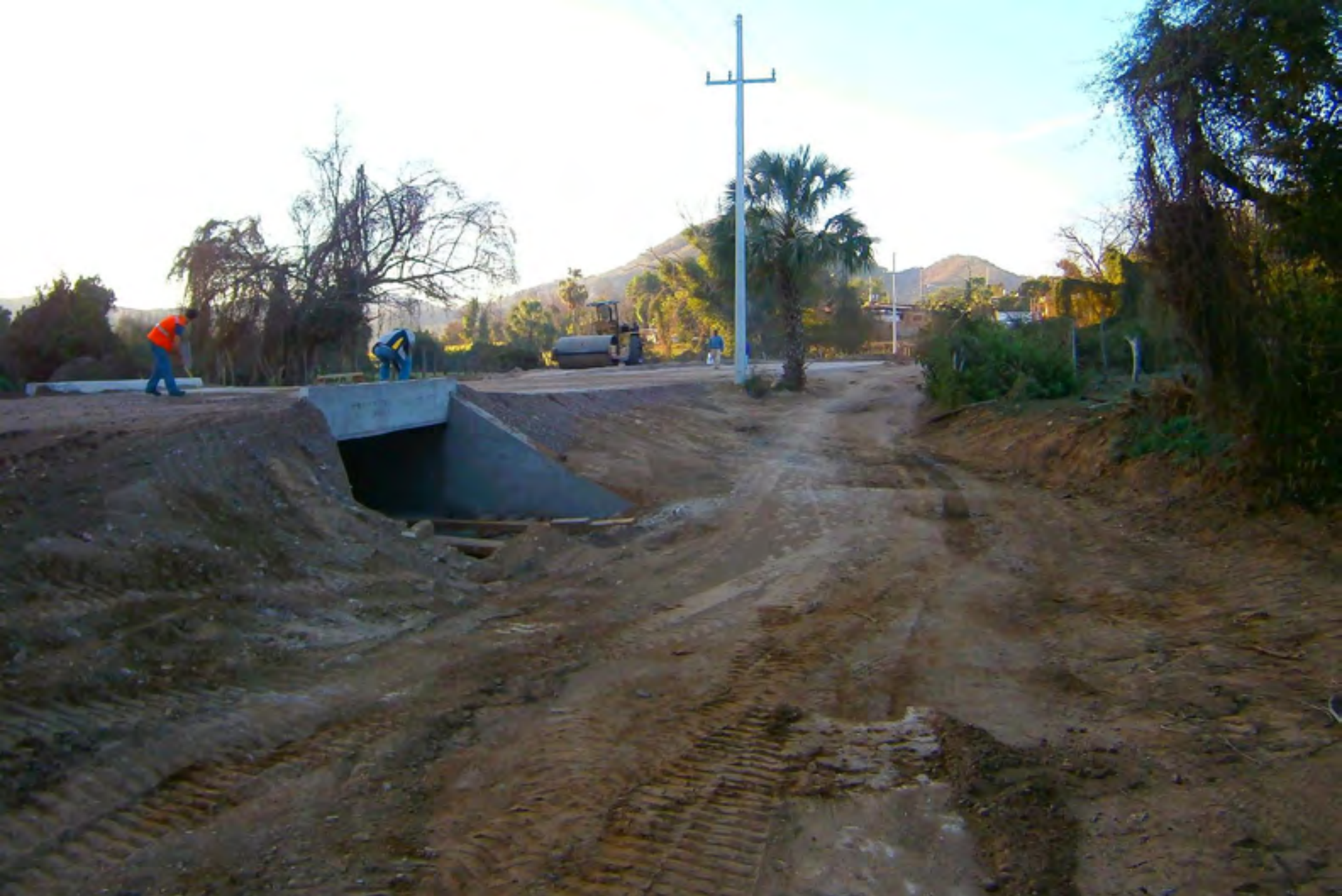
Haul road construction between the El Gallo and Palmarito deposits 50% complete.