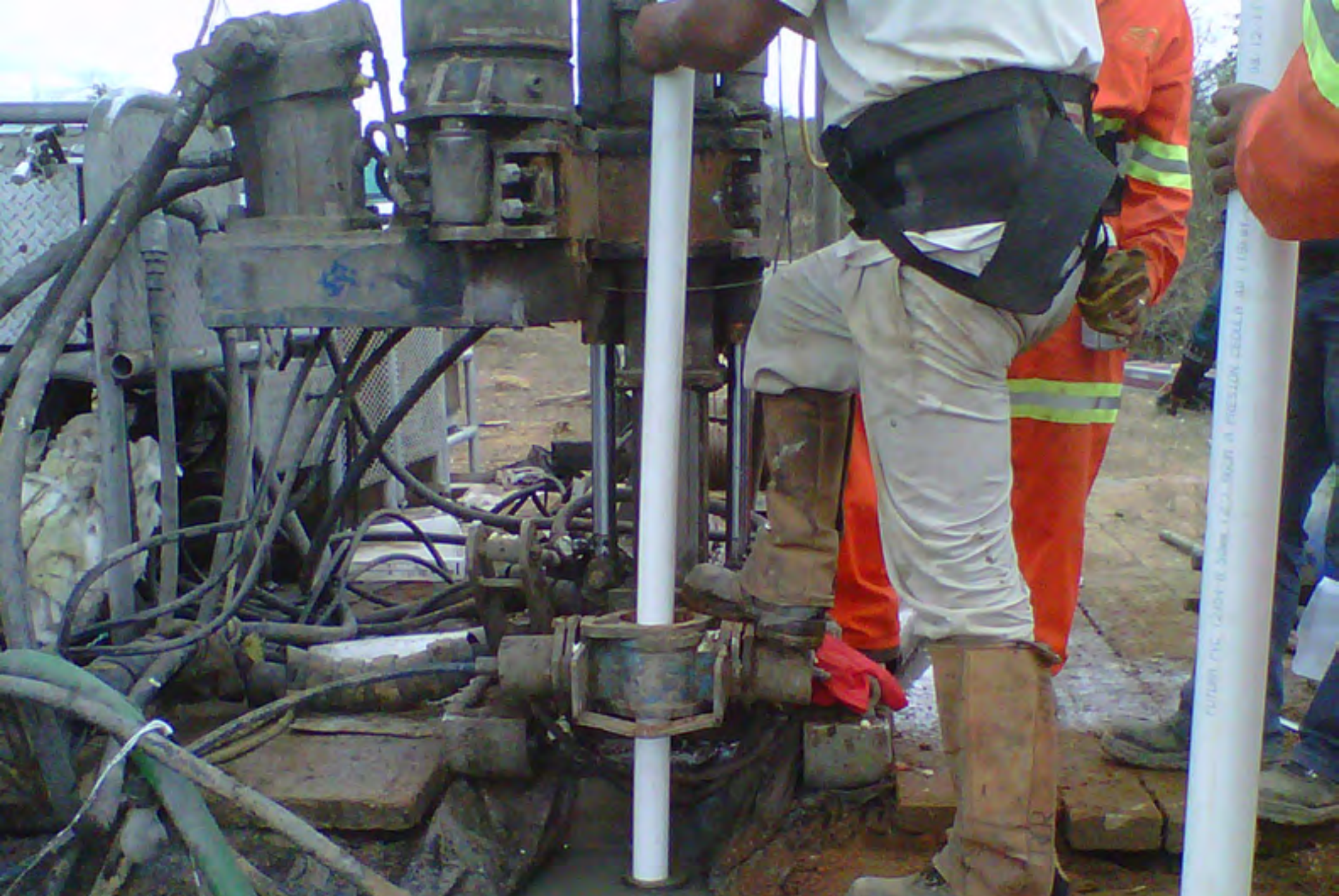
El Gallo: Process water flow-rate testing for mill facilities.