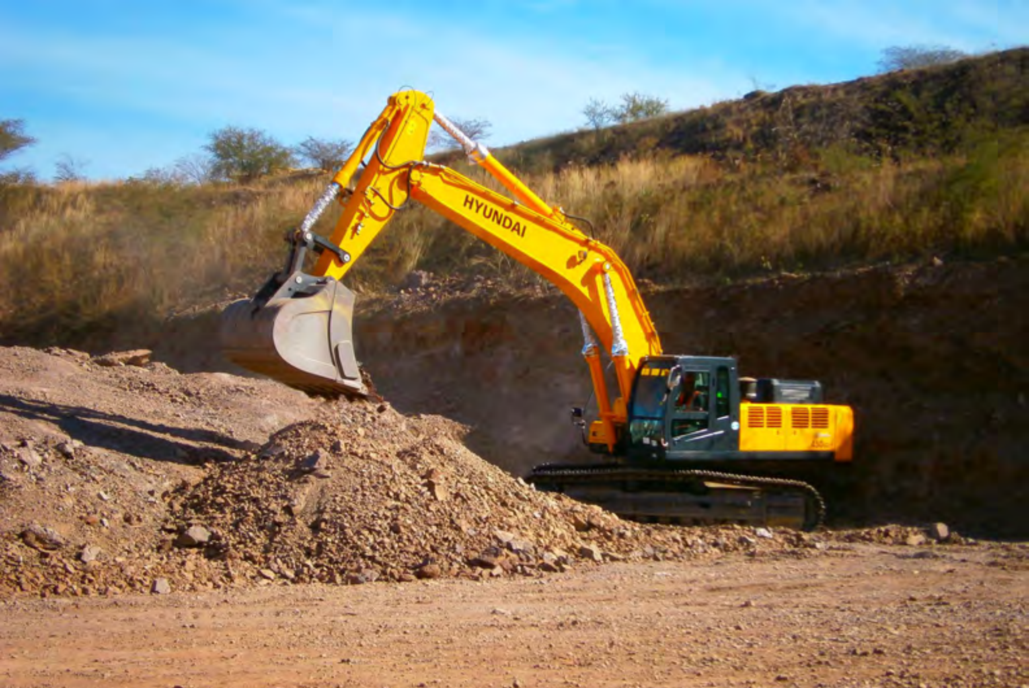
Preparing loading pocket for crushing plant.