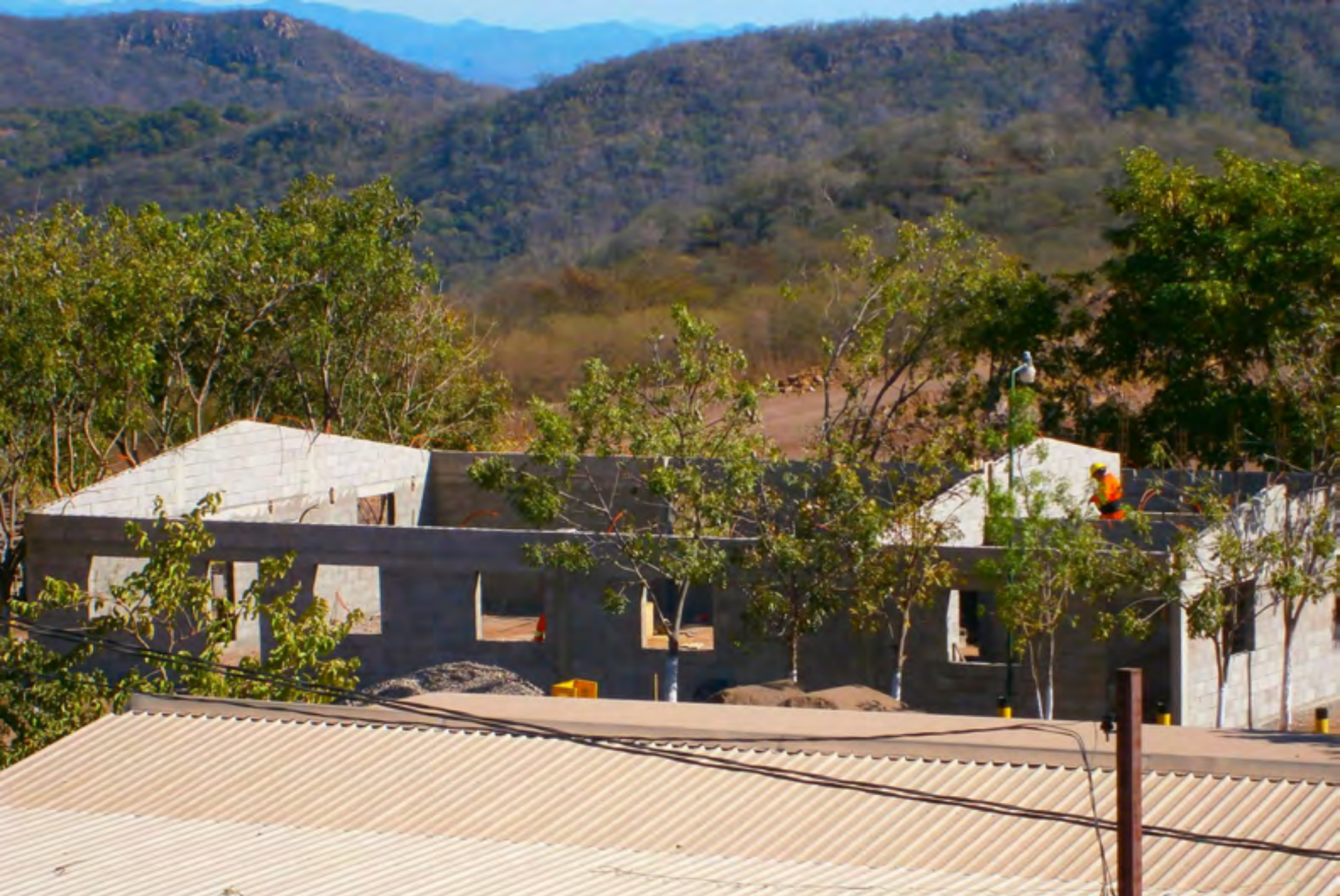
Preparing to raise the roof on the administration building.