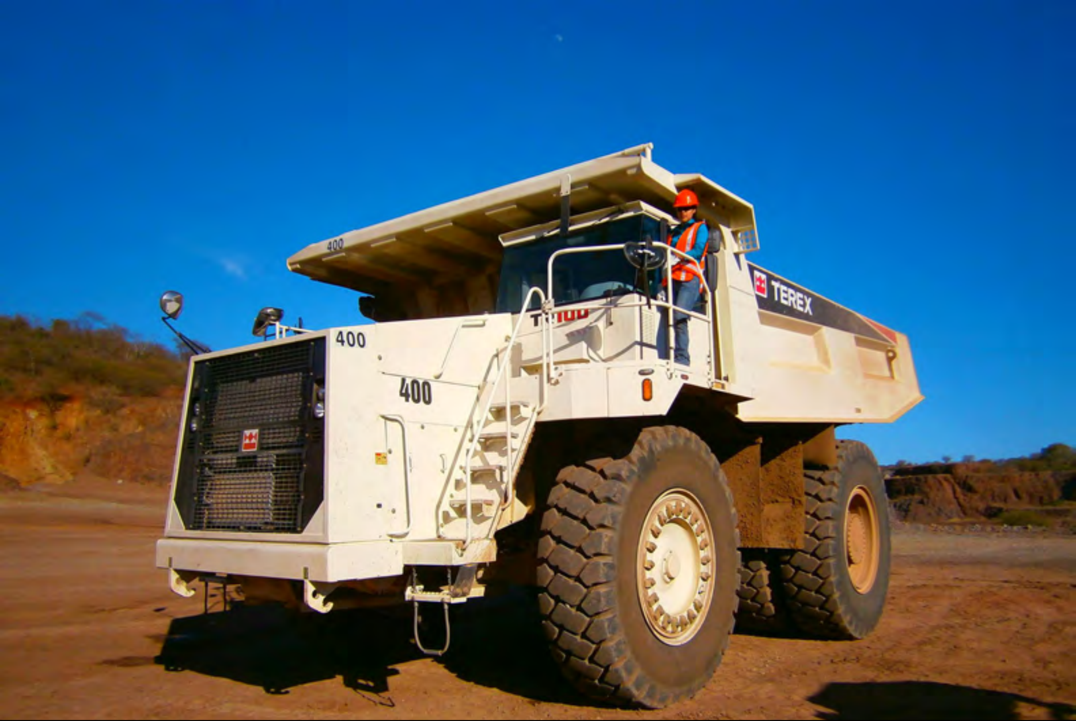
Member of our all-female 100 tonne haul truck operating team.