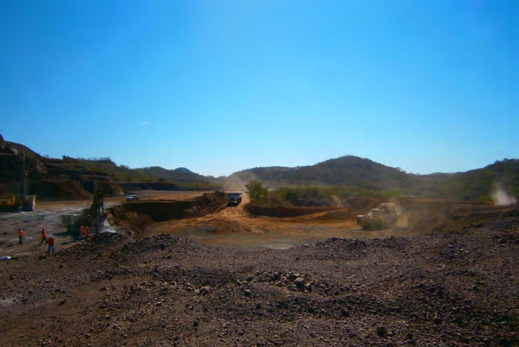
Samaniego open pit mine at full operating capacity.