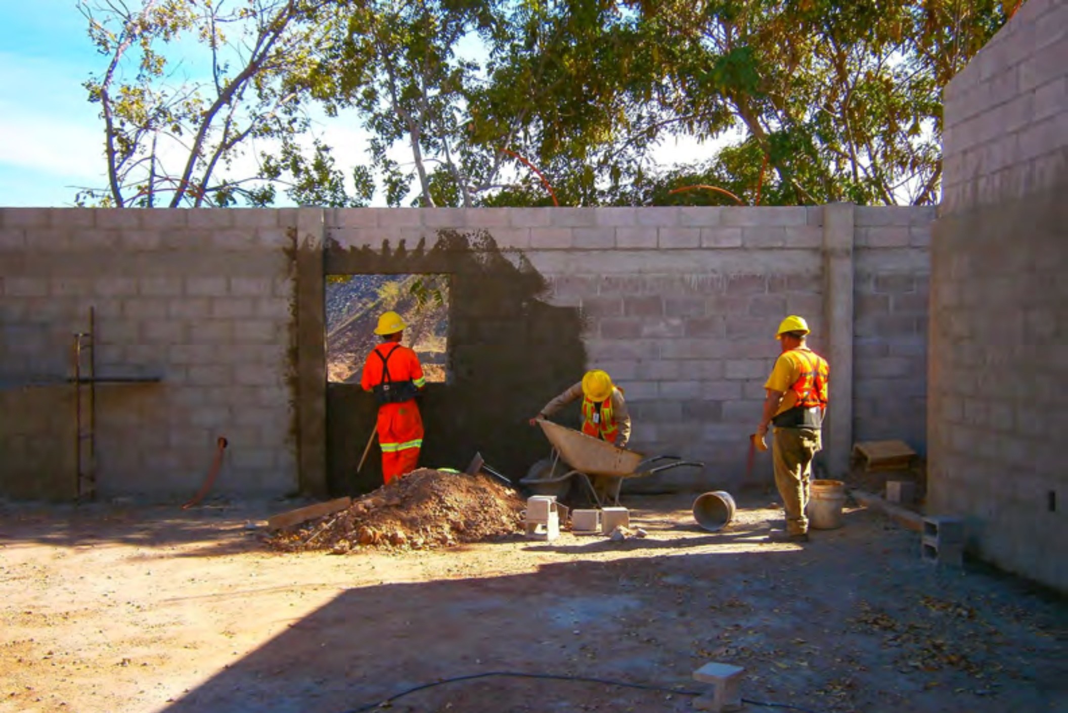
Inside the new administration building.