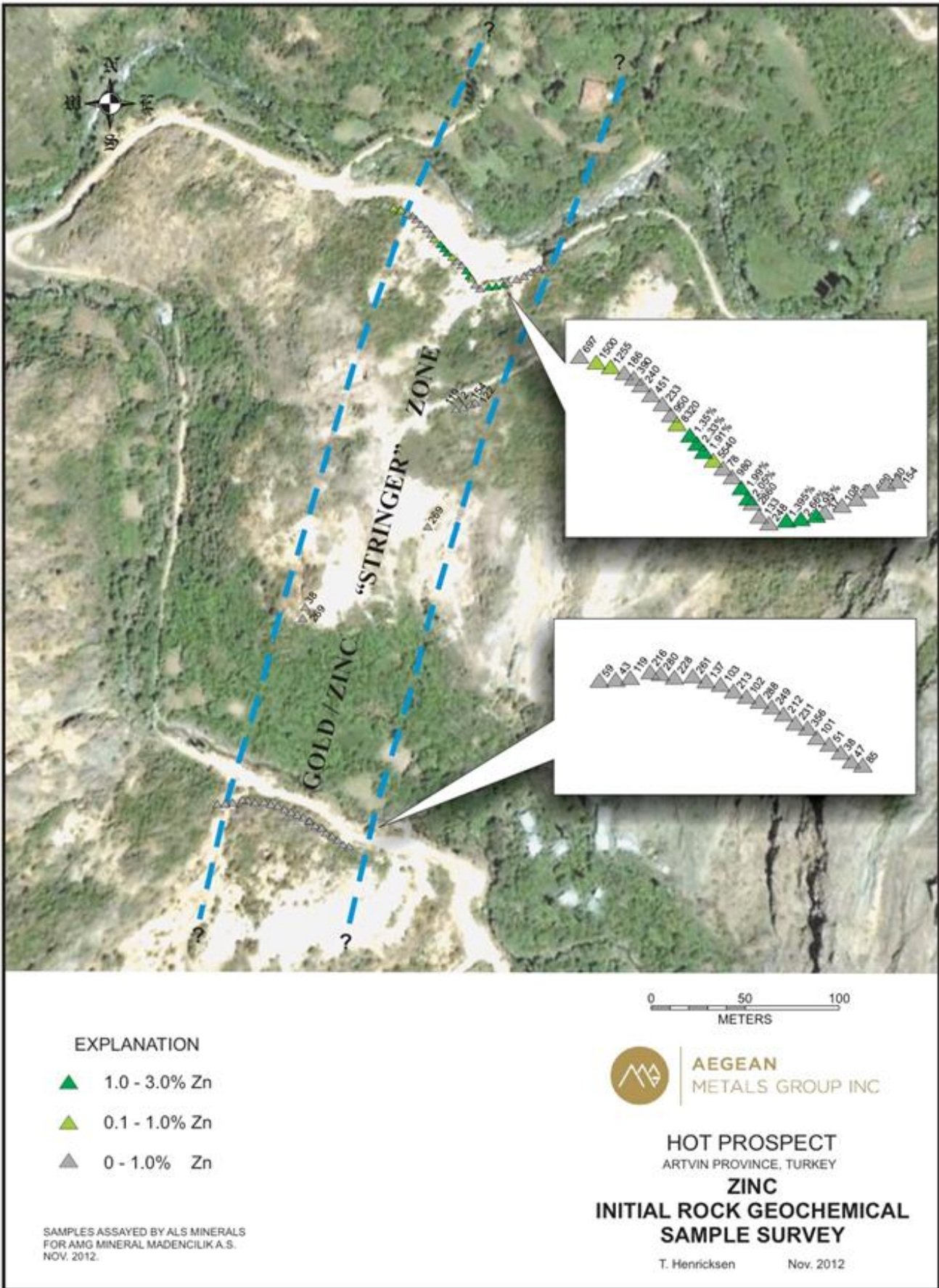
Figure 2 – Zinc Values in Rock Sampling Program