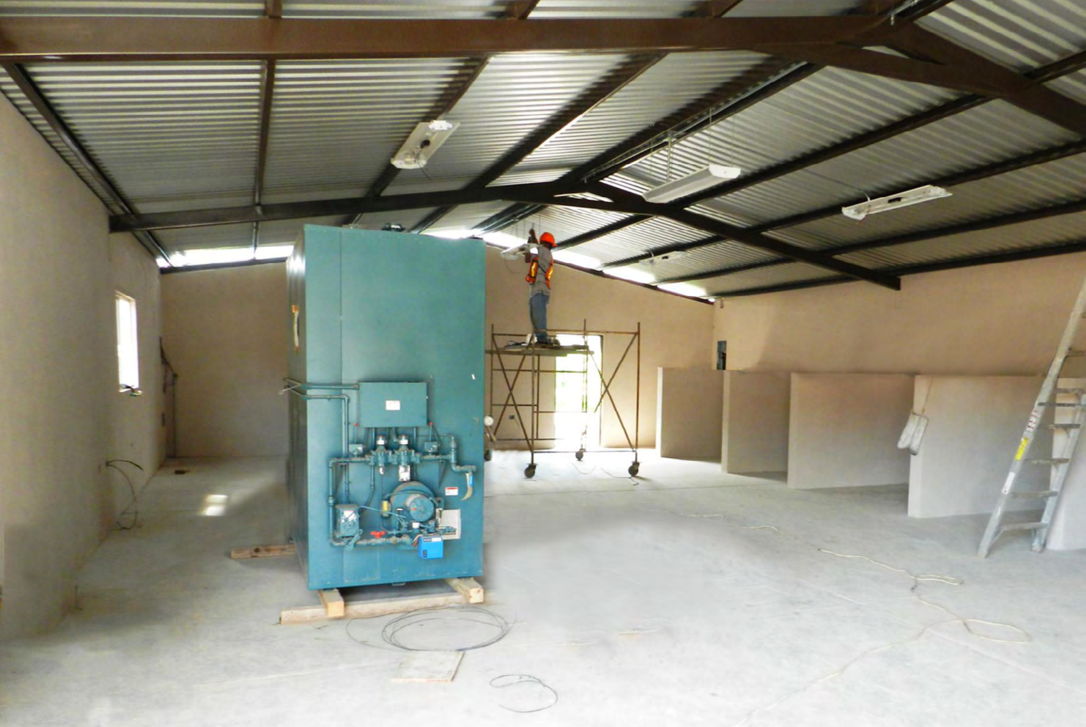
Assay lab expansion.