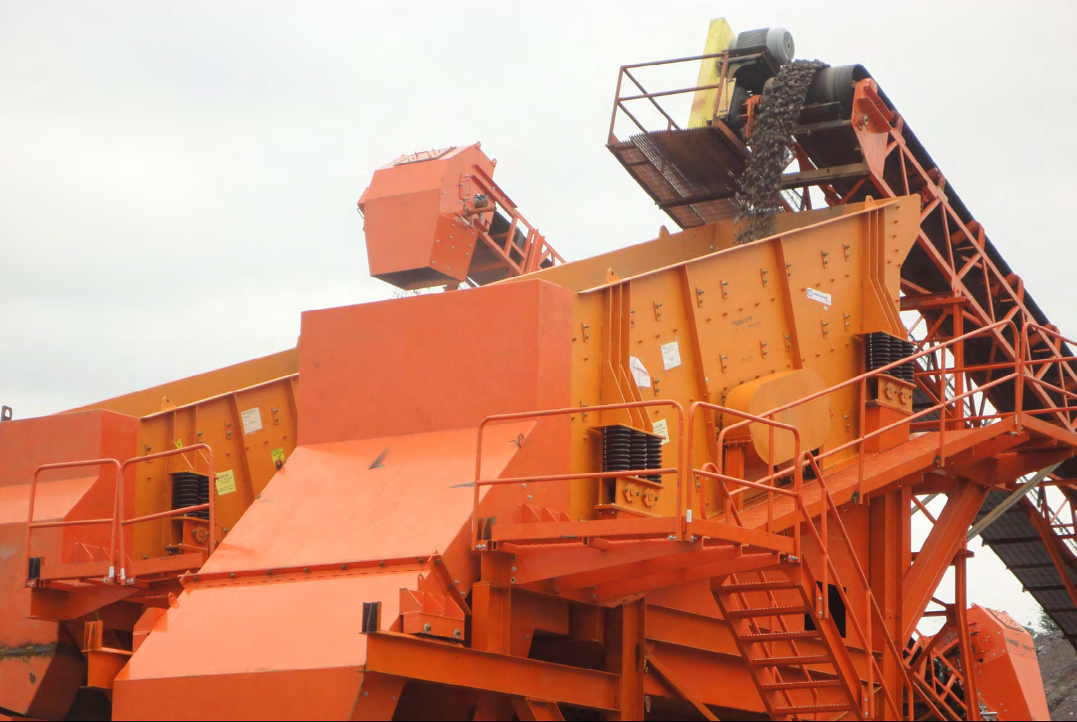
Commissioning the crushers.