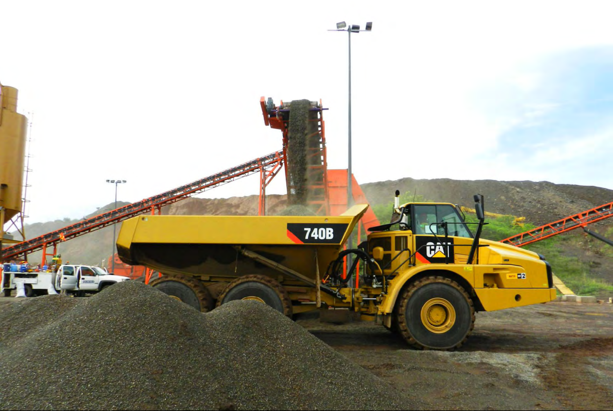
Loading material for heap leach pad.