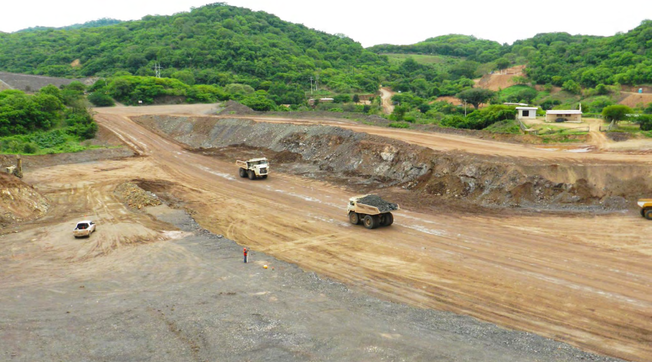
Mining at Samanegio open pit continues.