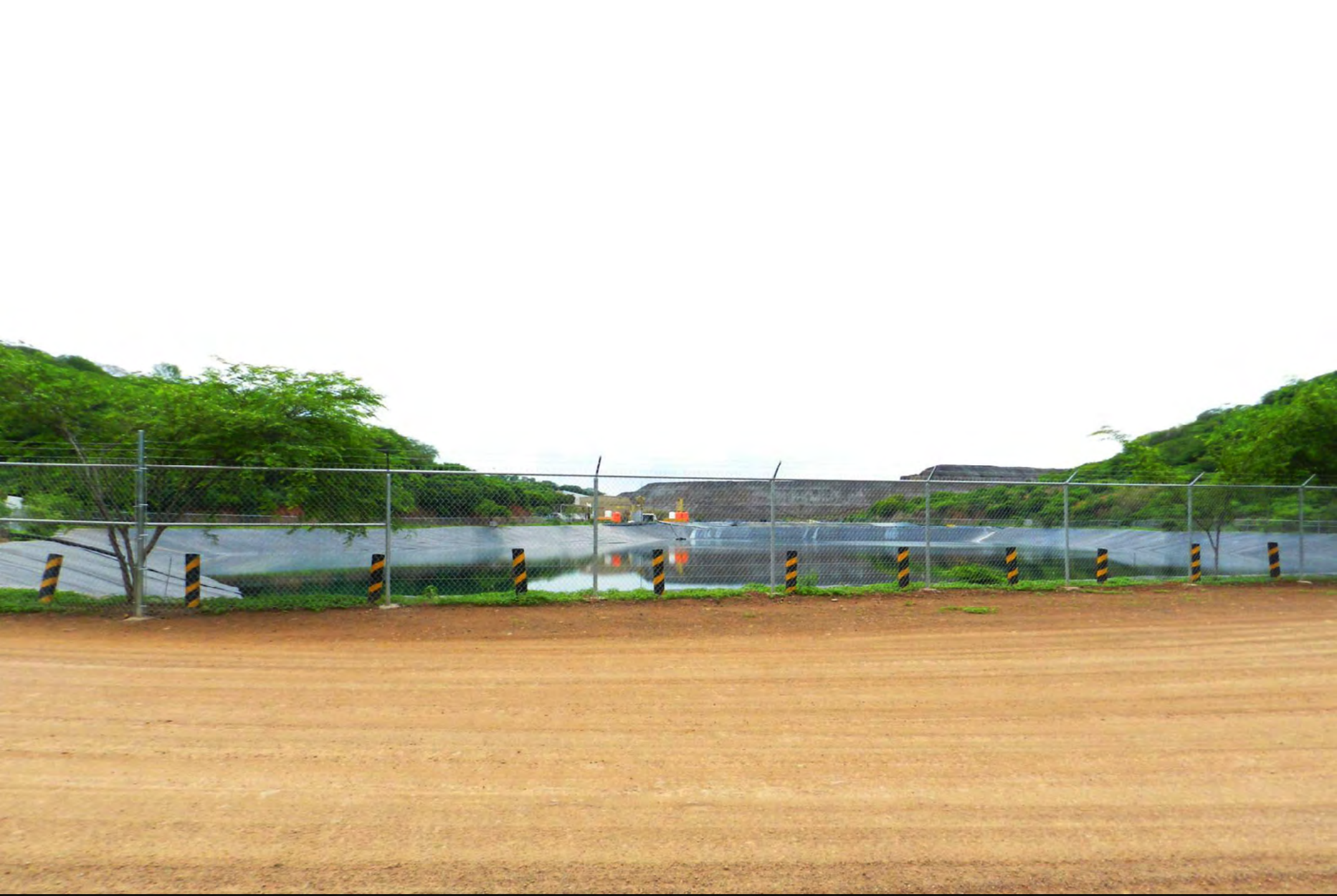
New fence around process ponds.