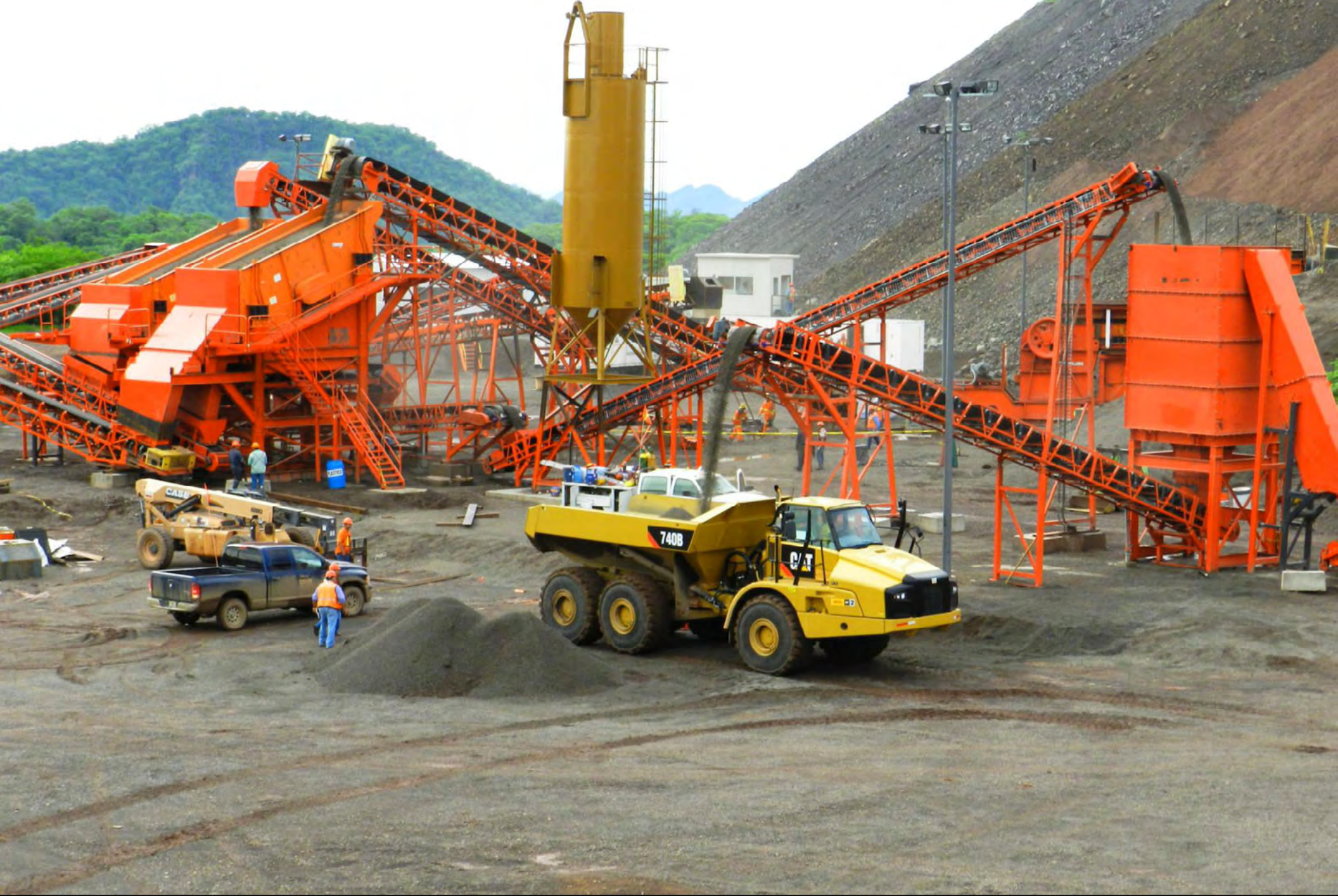
Loading material for heap leach pad.