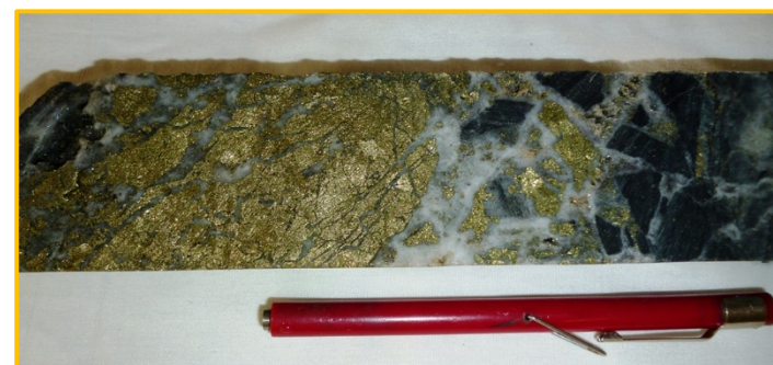
KMDD0009 157.15 – 157.30m