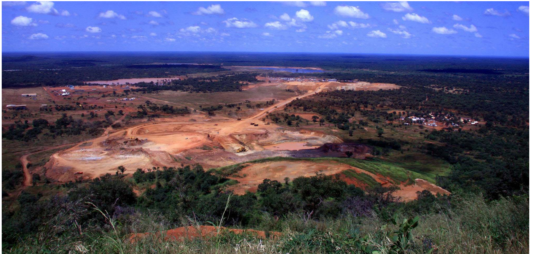
Overview of scope of mining operation from Sabodala pit in foreground, ROM pad, mill and water dams in background