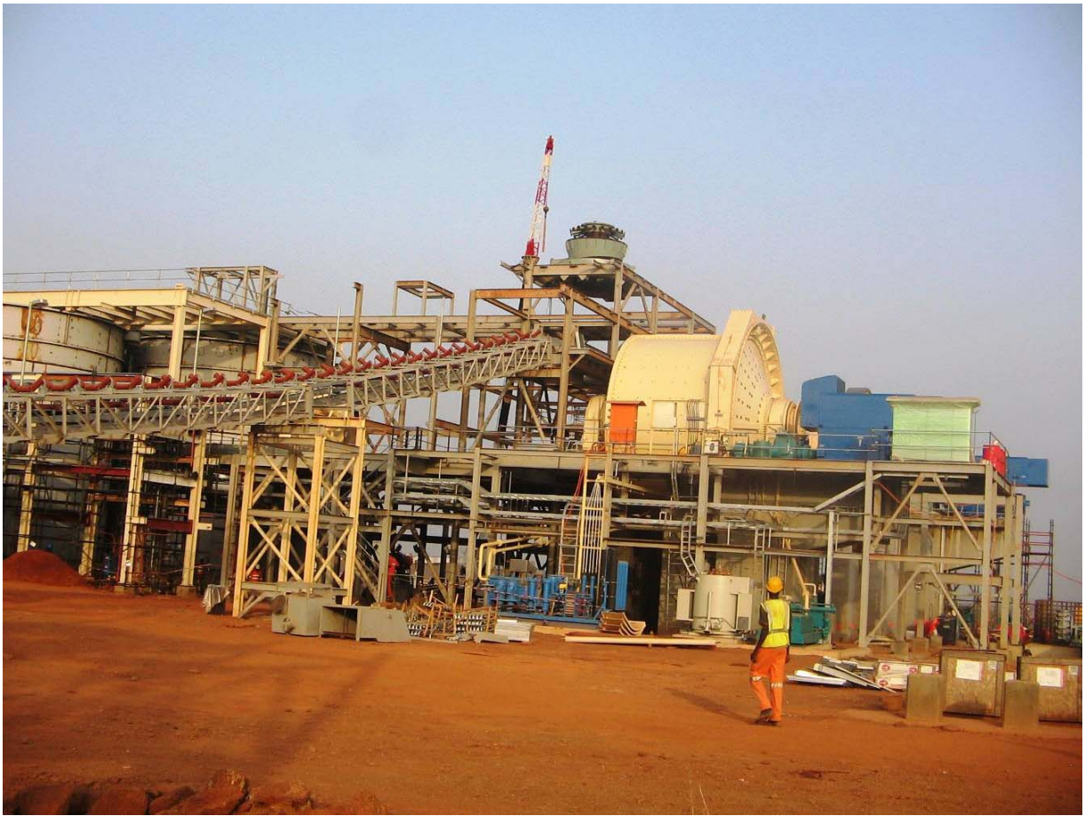
Close up of the main feed conveyor, CIL tanks and SAG and Ball mill