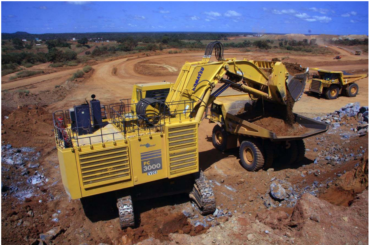
Mining fleet in operation at site