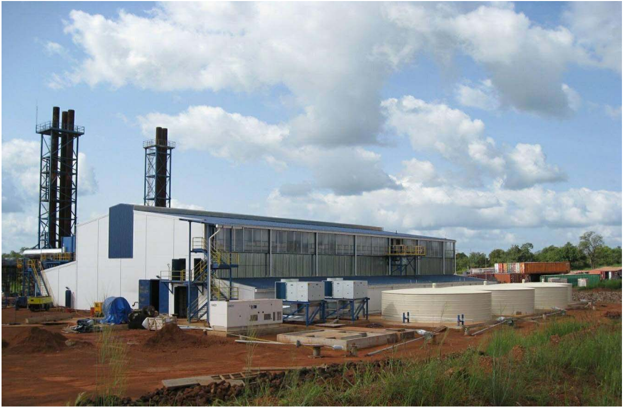
Power station construction completed