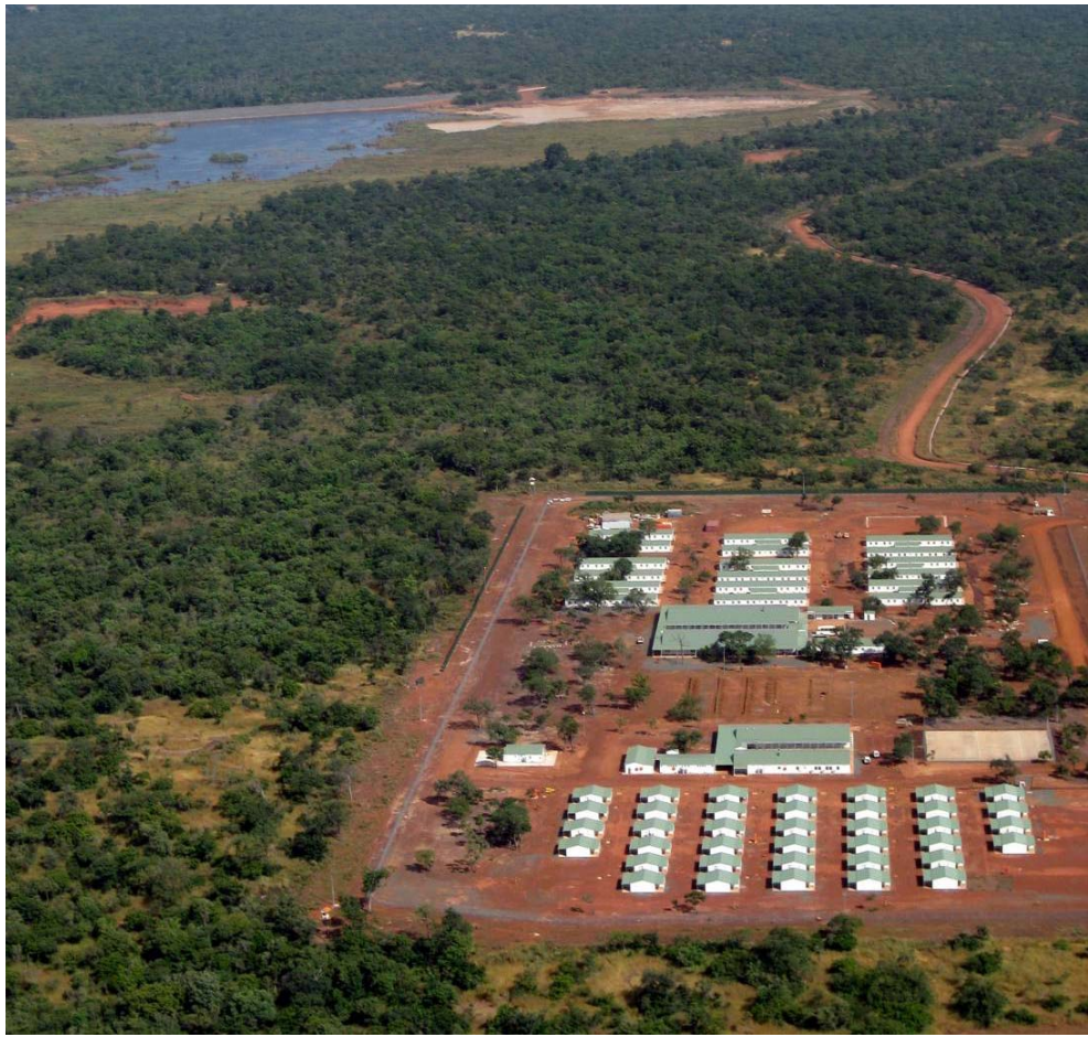
Sabodala accommodation village with main water storage dam in background