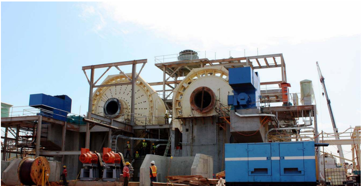
Grinding mills nearing completion