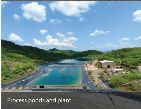
Process ponds and plant