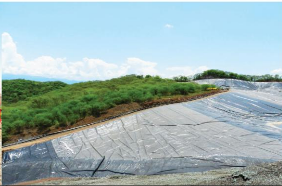
Heap leach pad expansion