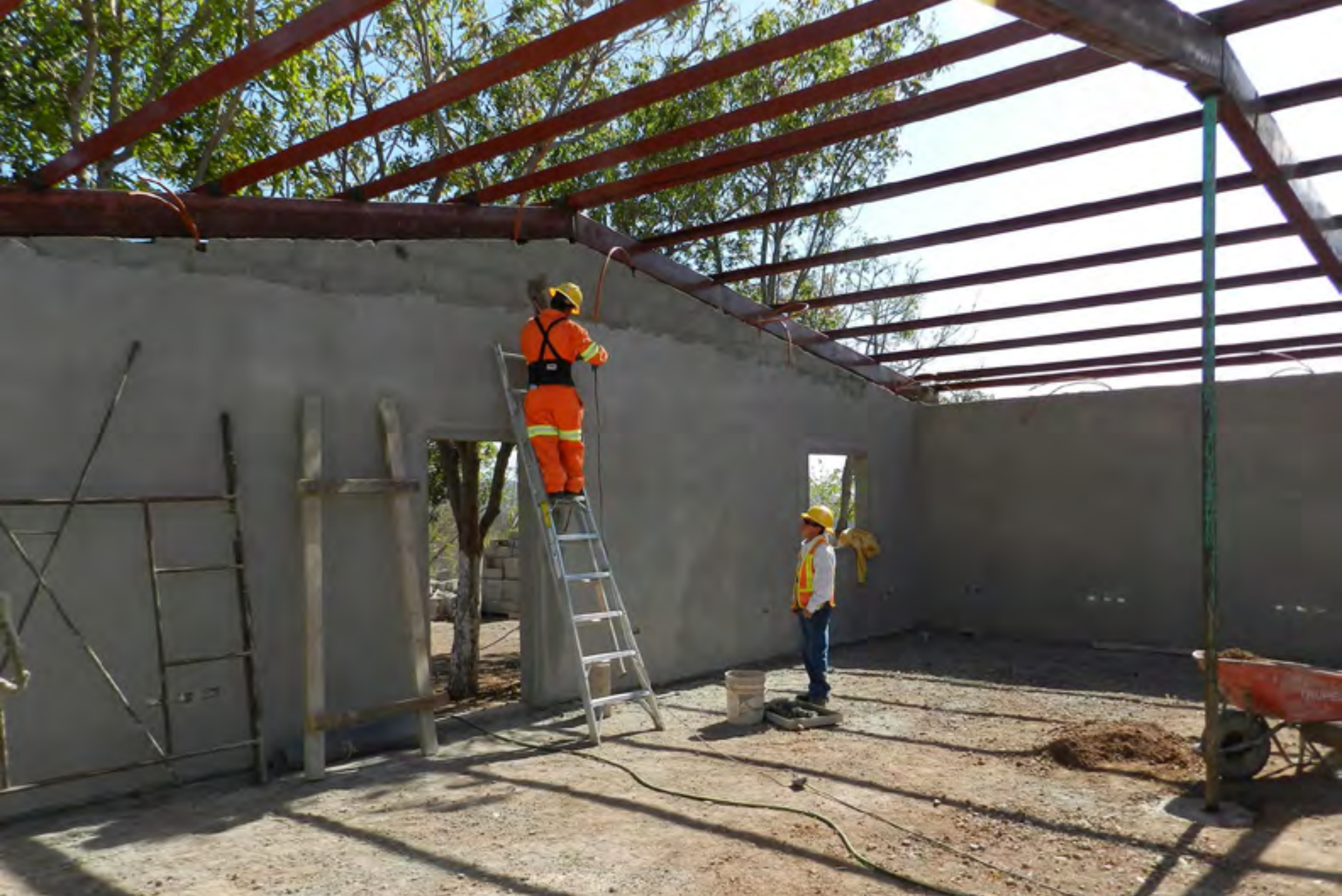
Inside the new administration building.