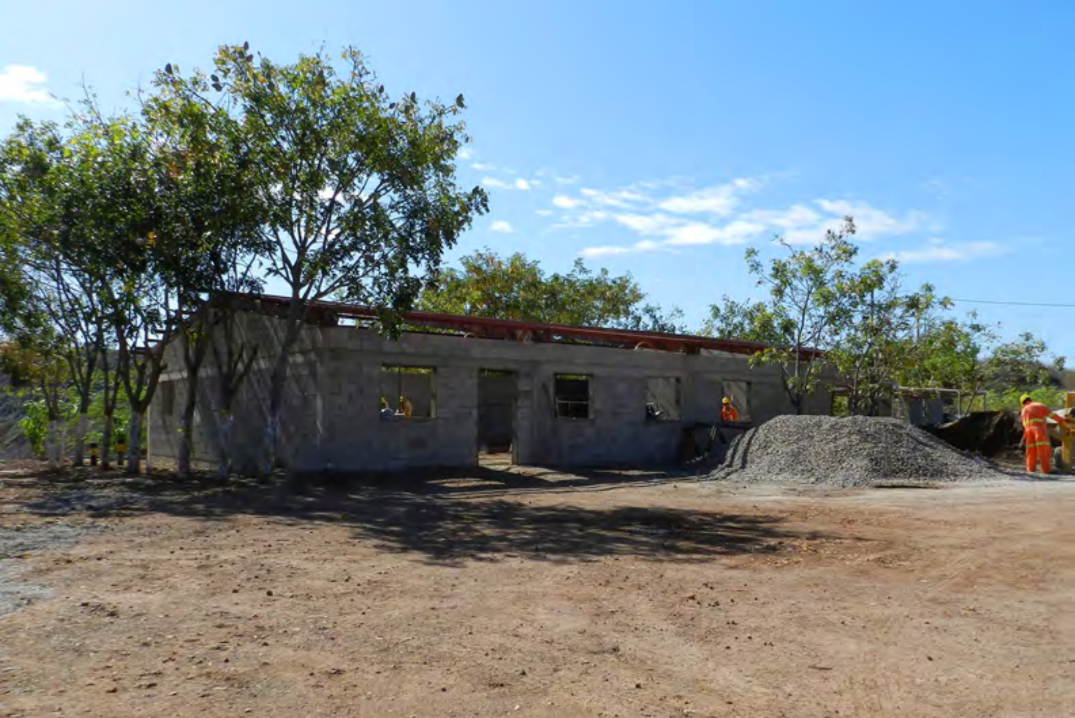
Raising the roof on the new administration building.