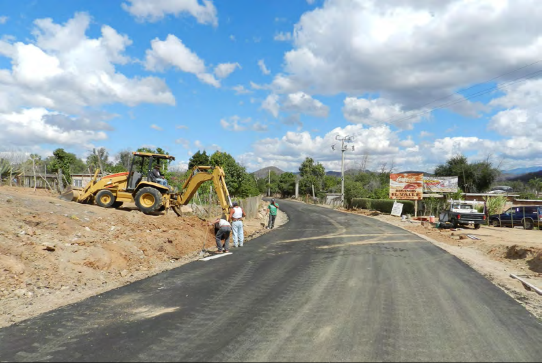
Haul road construction between the El Gallo and Palmarito deposits 80% complete.