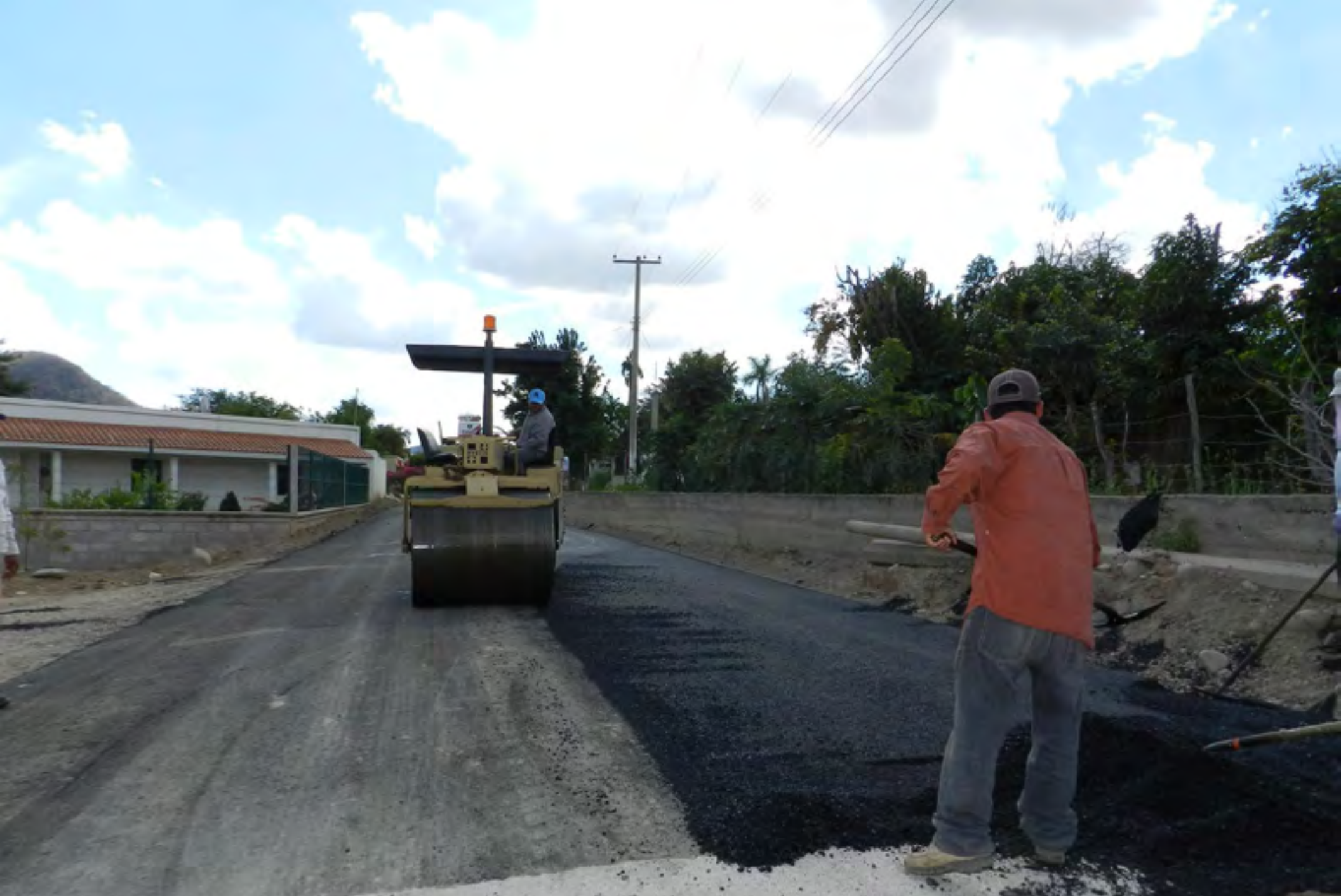
Application of final ash-fault layer.