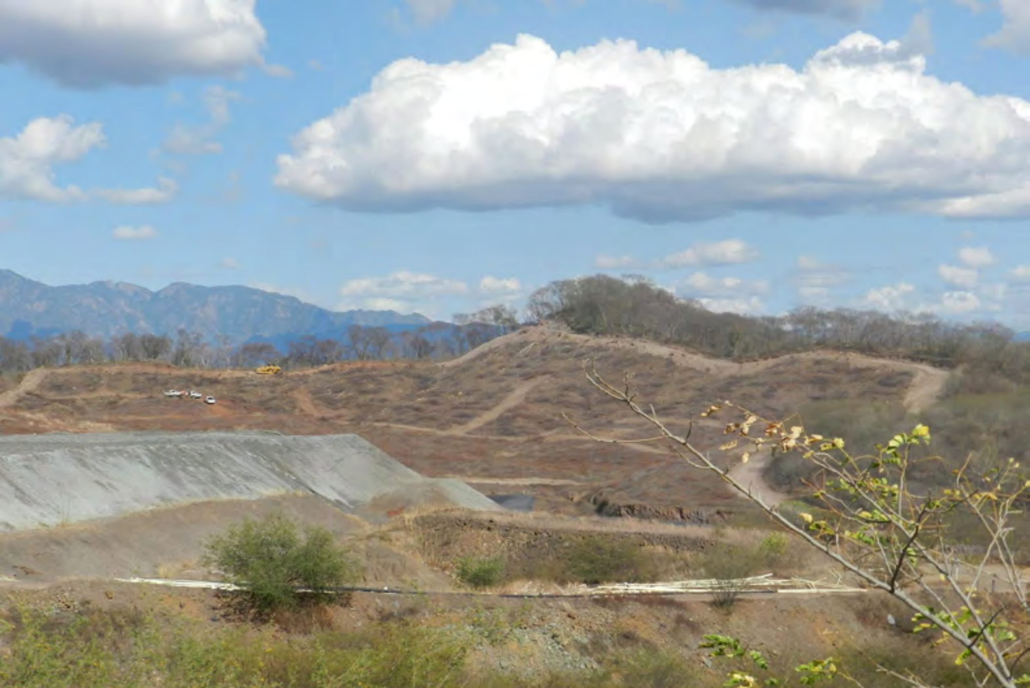
Heap leach pad expansion underway.