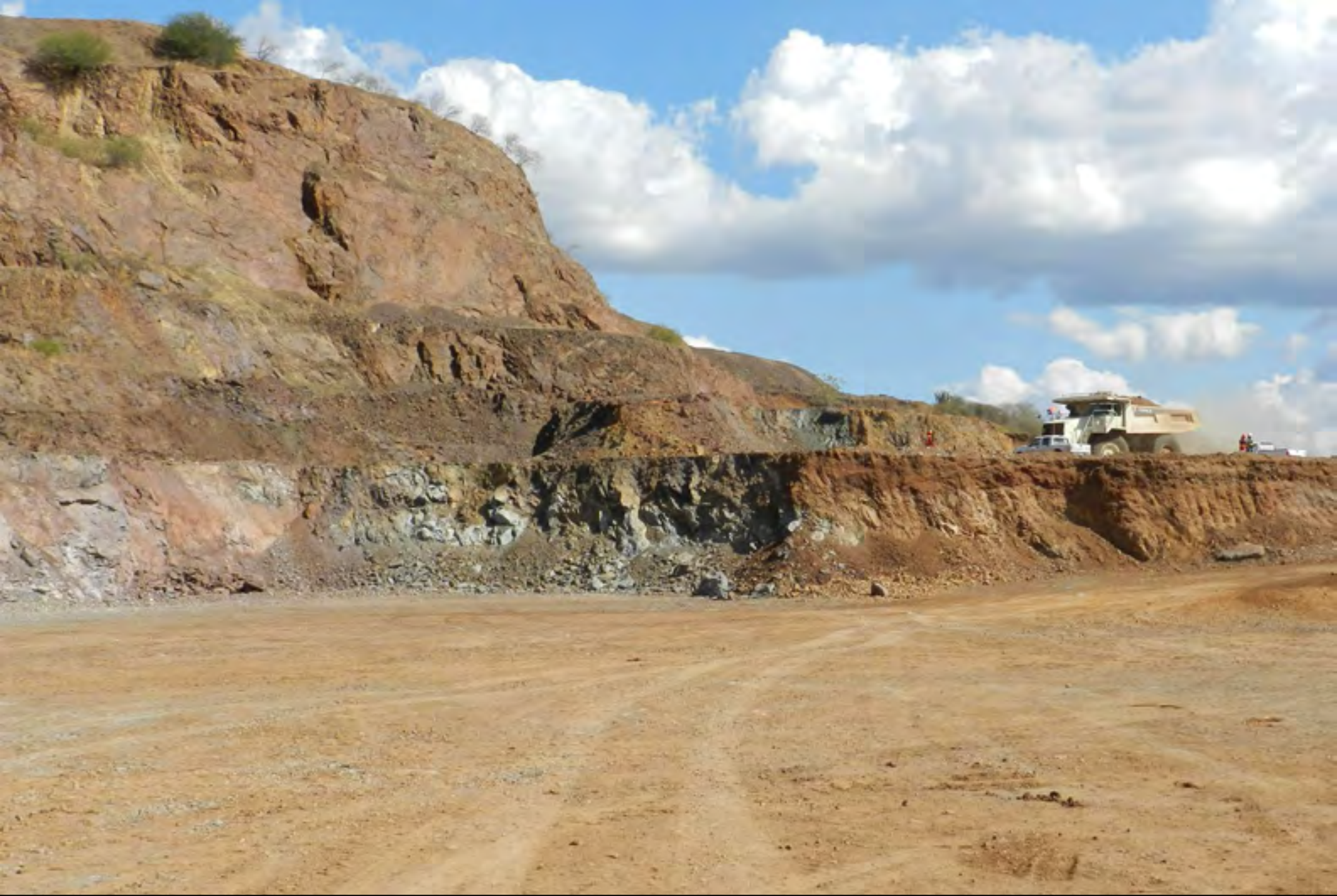
Pre-stripping at Samanegio open pit.