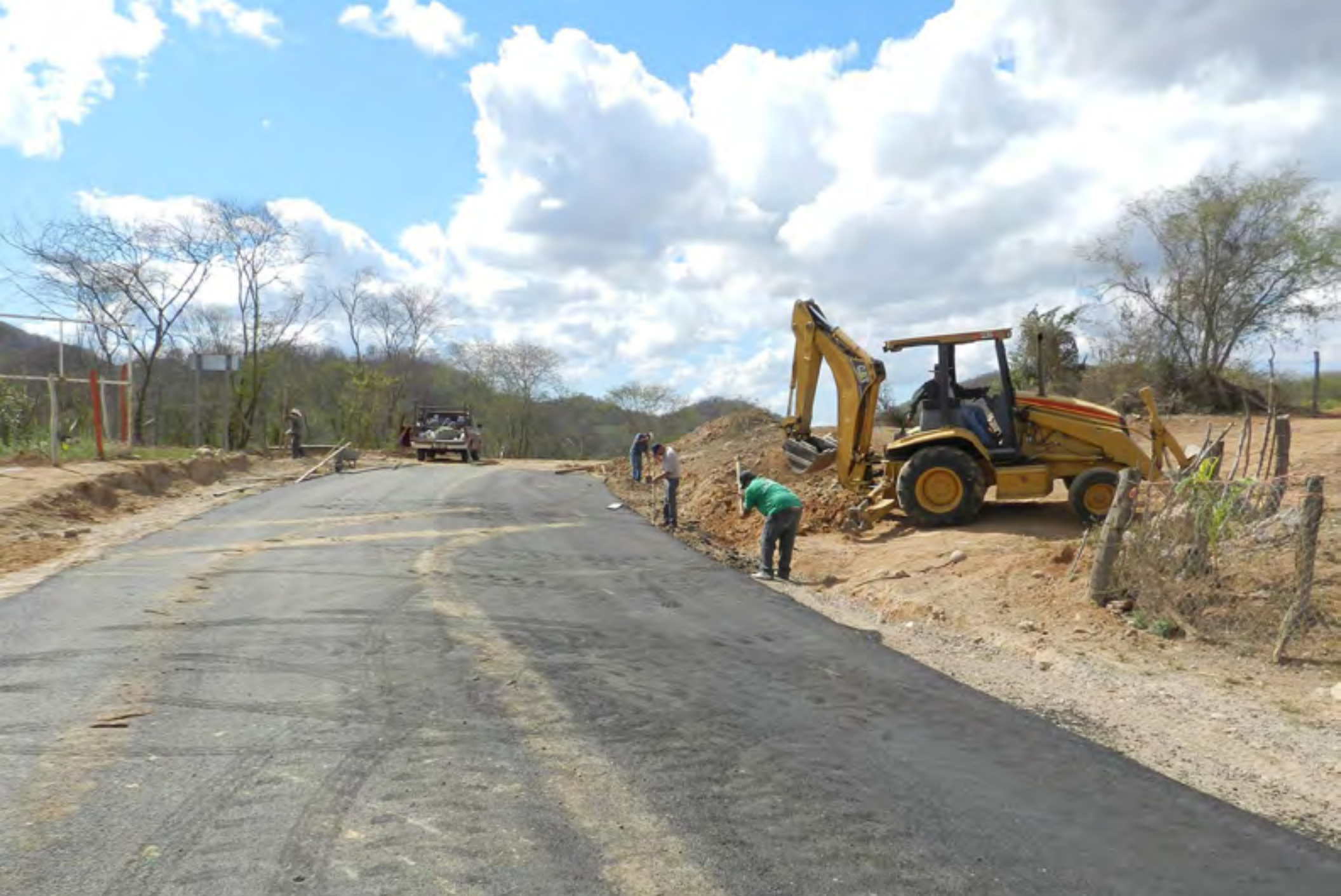
Haul road construction between the El Gallo and Palmarito deposits 80% complete.