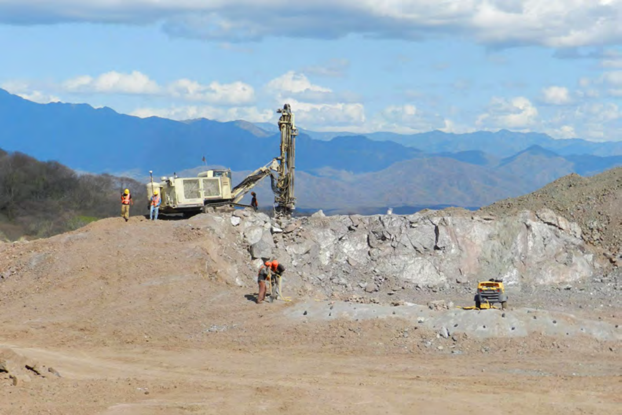
Preparing loading pocket for the crushing plant.