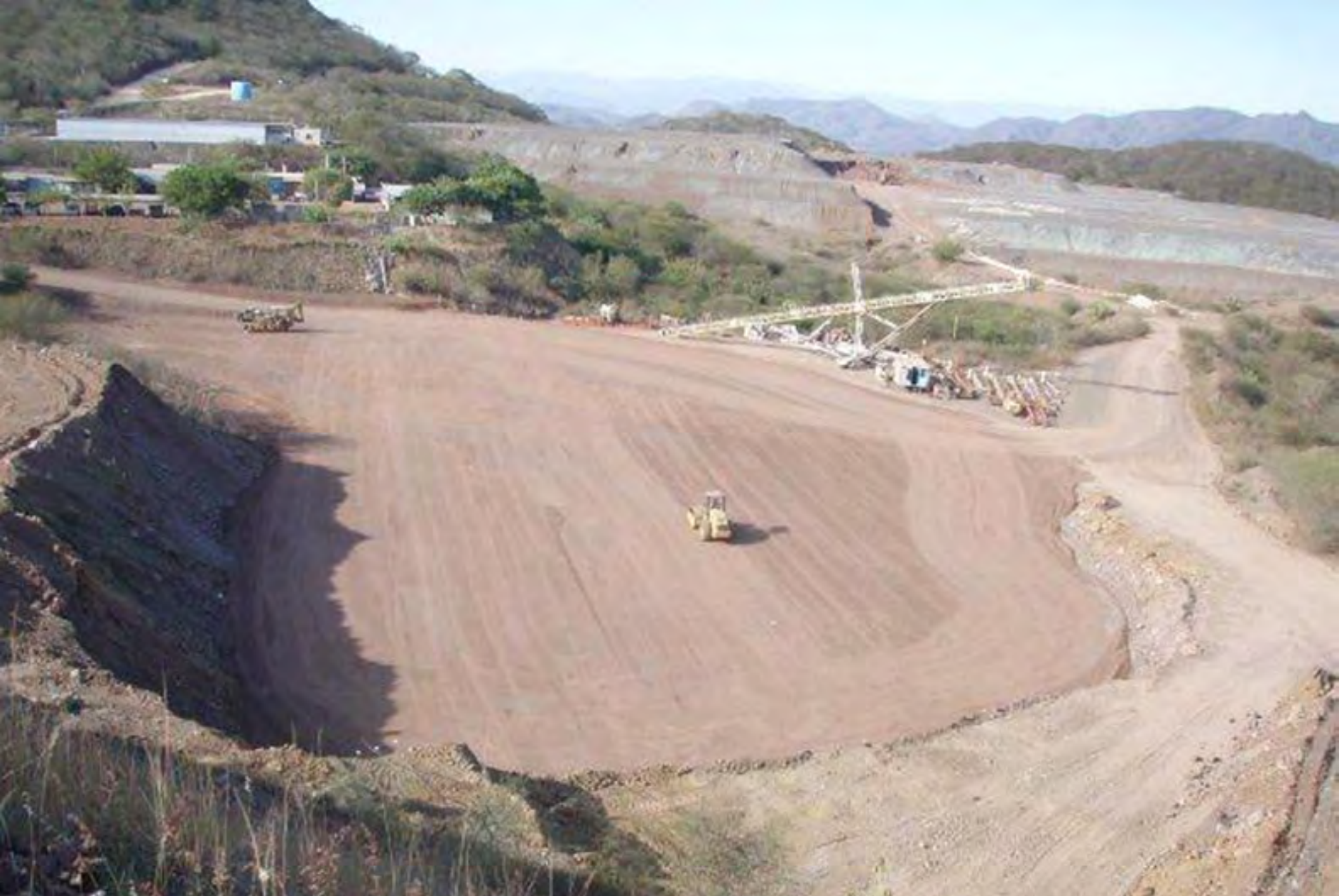
Preparing for the crushing plant installation.