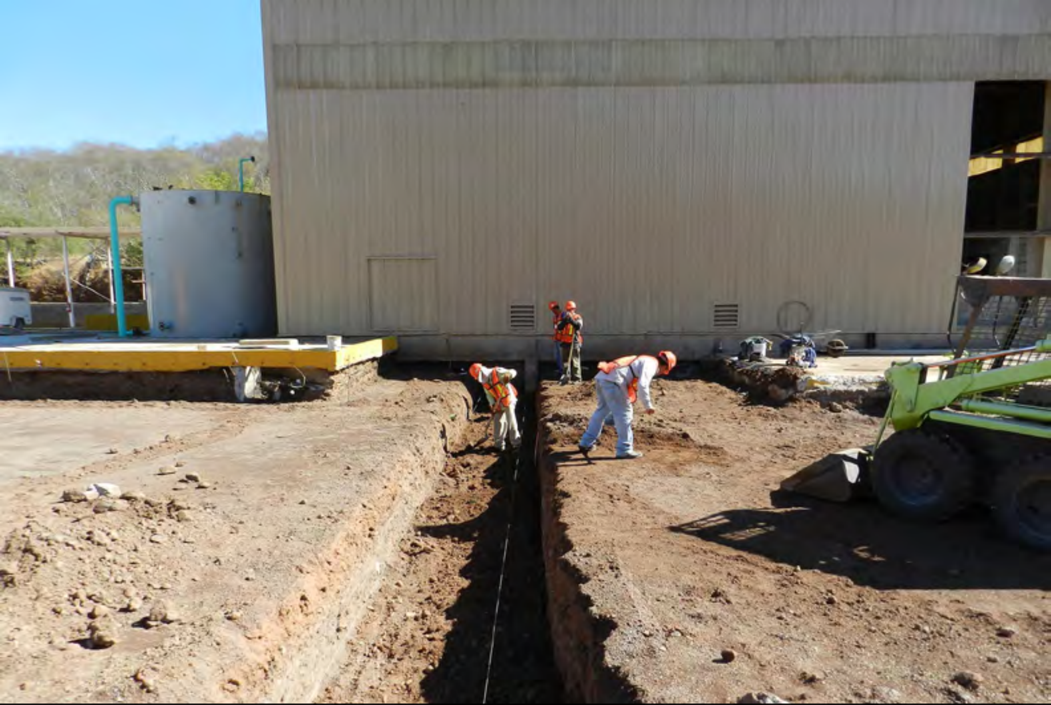
Phase 1 mining process plant upgrade.