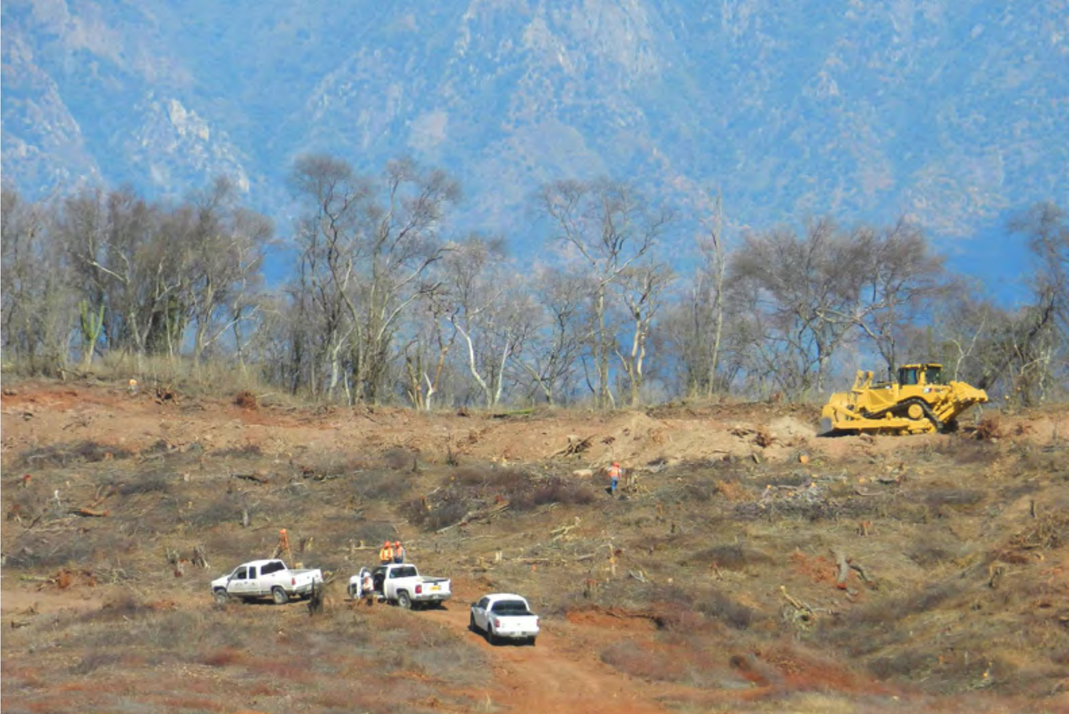
Heap leach pad expansion underway.