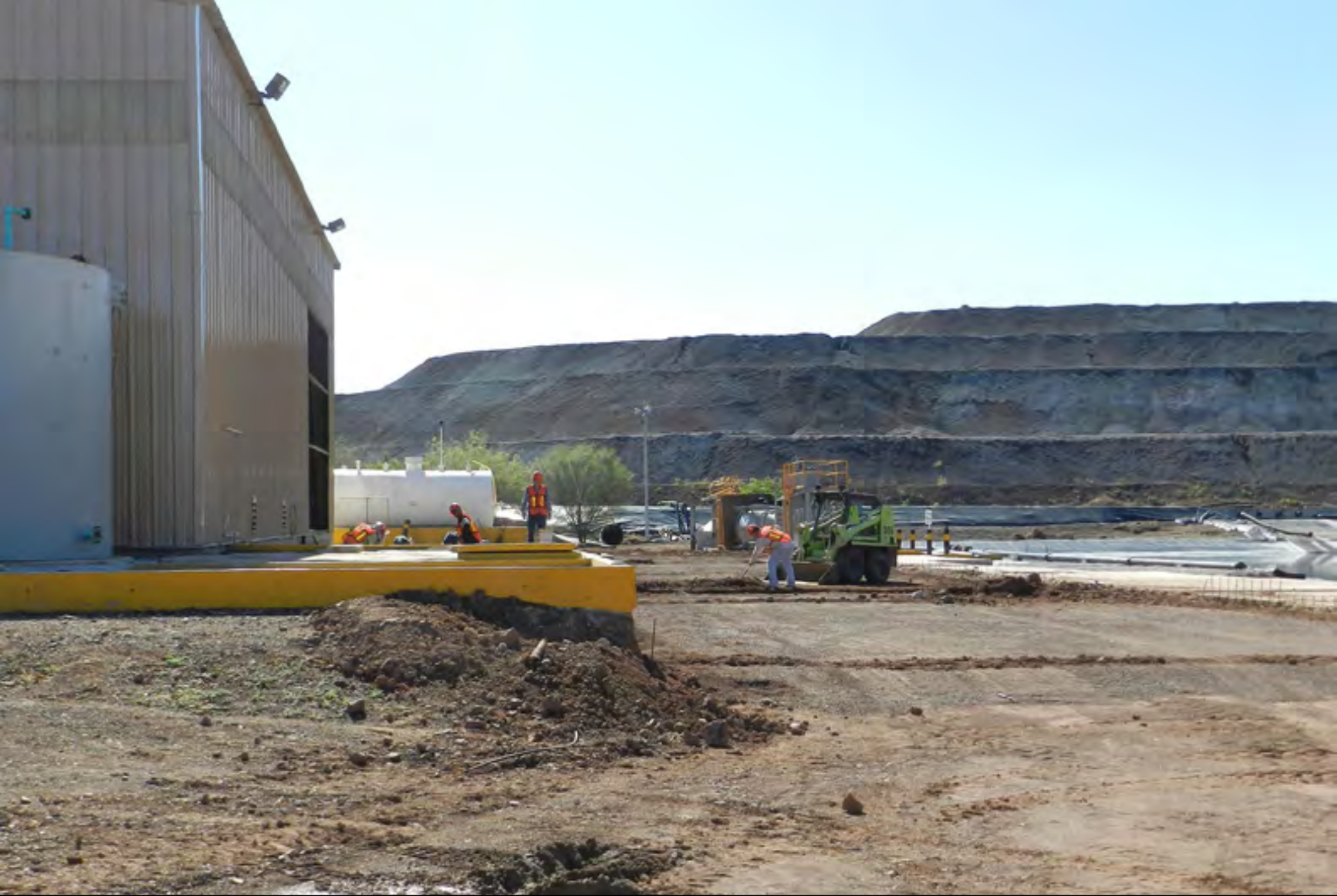
Phase 1 mining process plant upgrade.