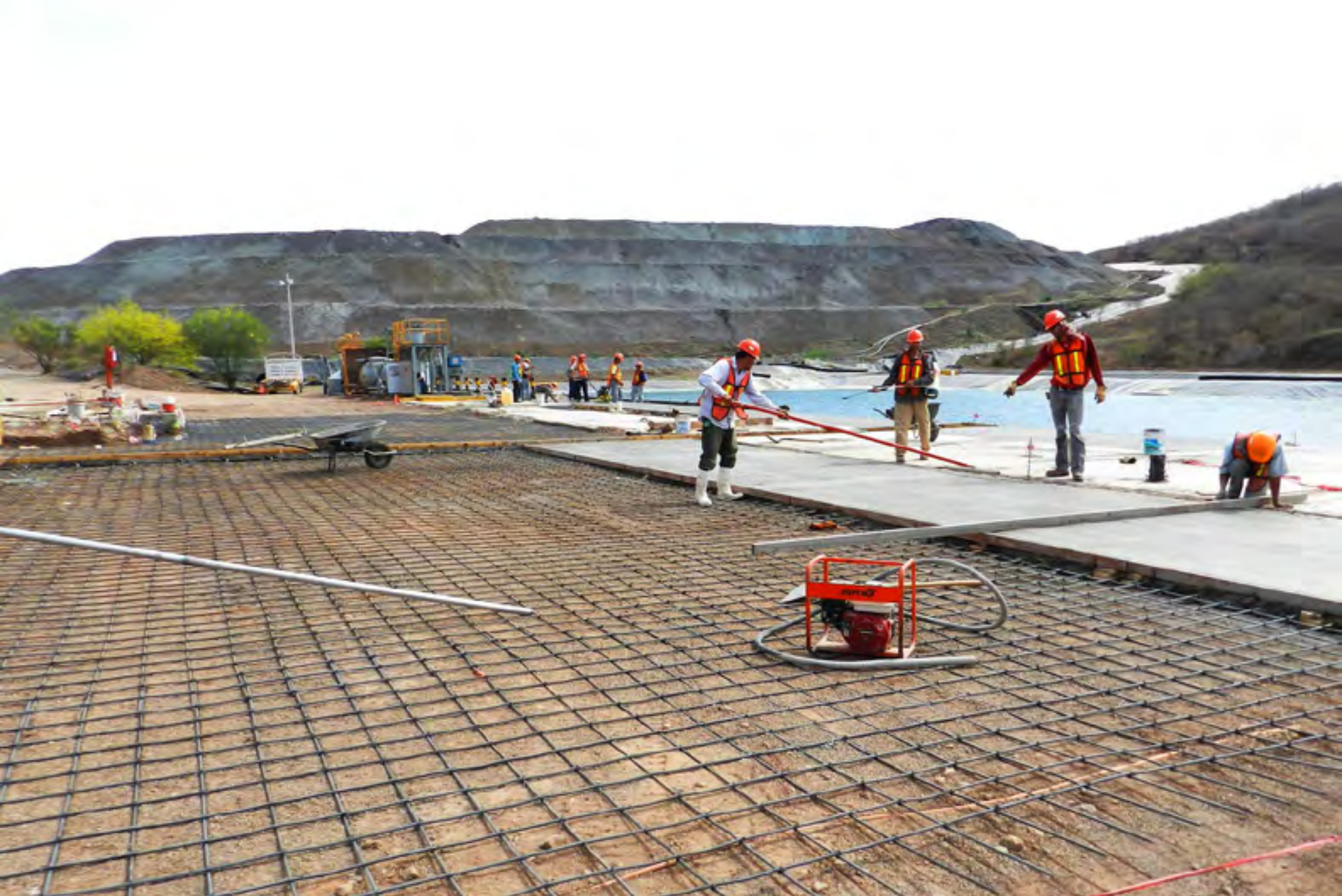
Foundation work at the process plant continues.