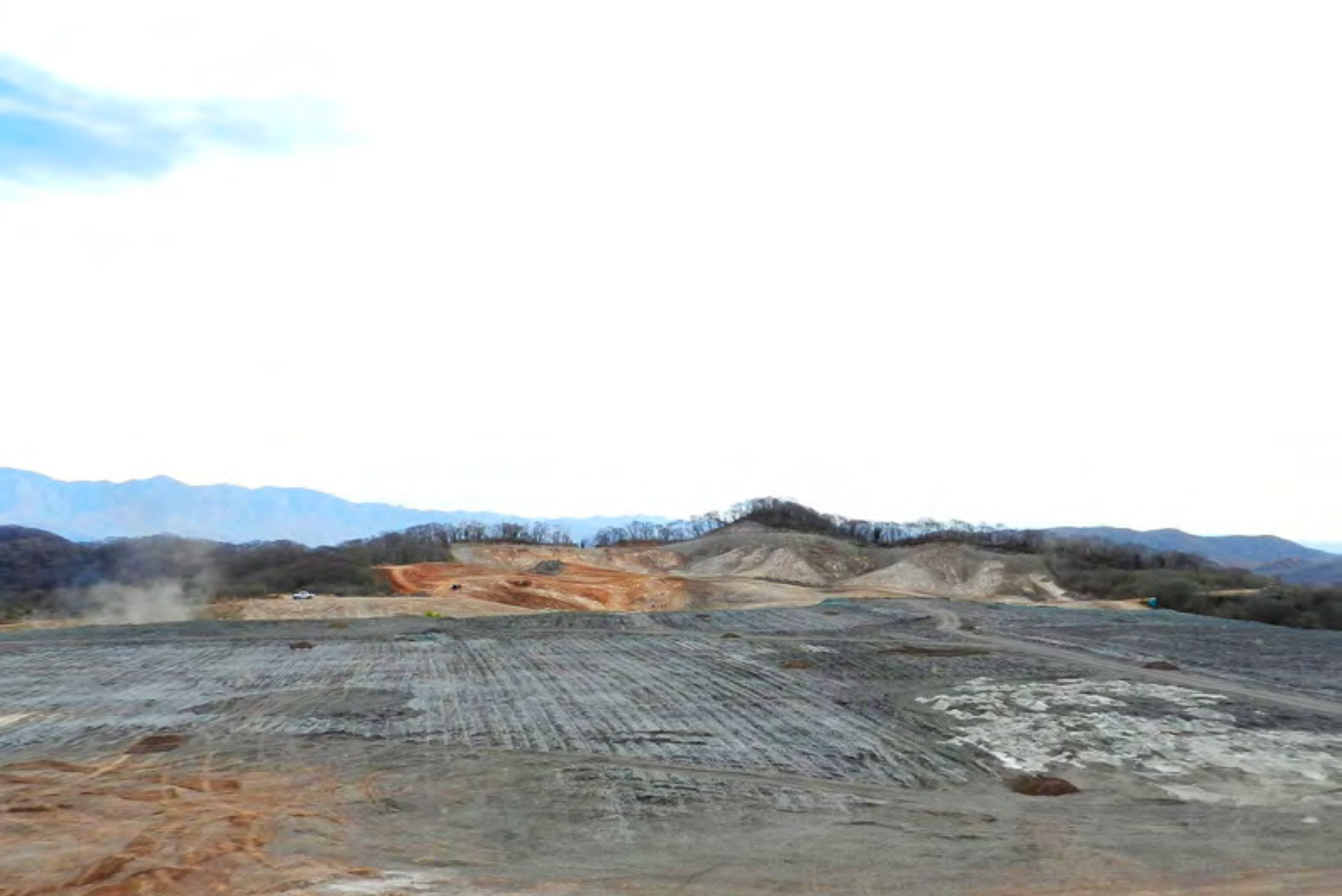
Heap leach pad expansion 35% complete.