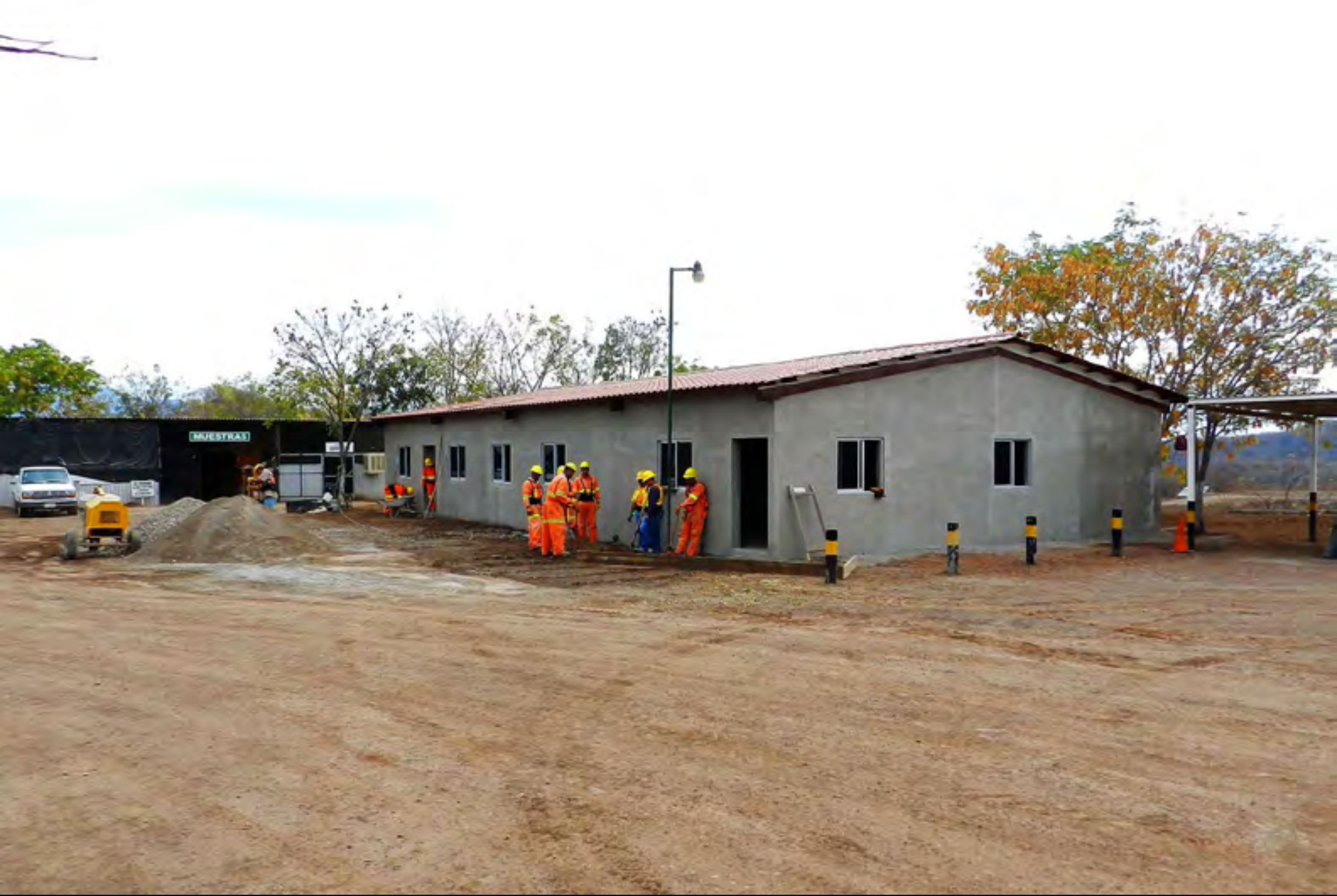
New administration building nears completion.