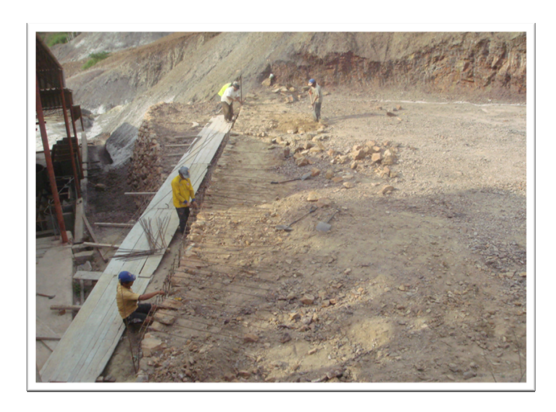
New fines sampling pad