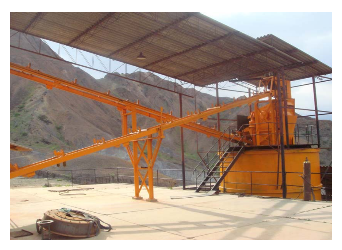
Crushing circuit with fines Bin after overhaul