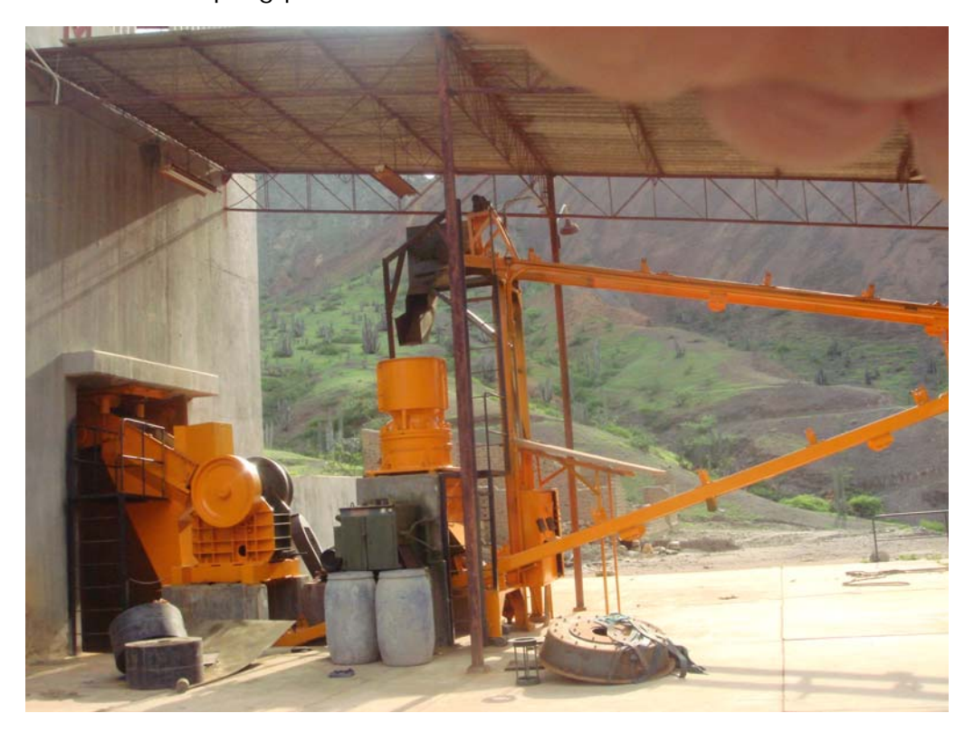
Crushing circuit with a 90% overhaul