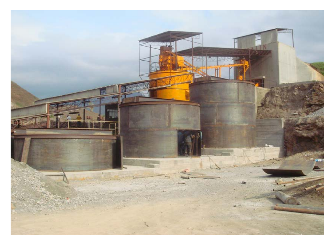
Lateral view of the new leaching tanks