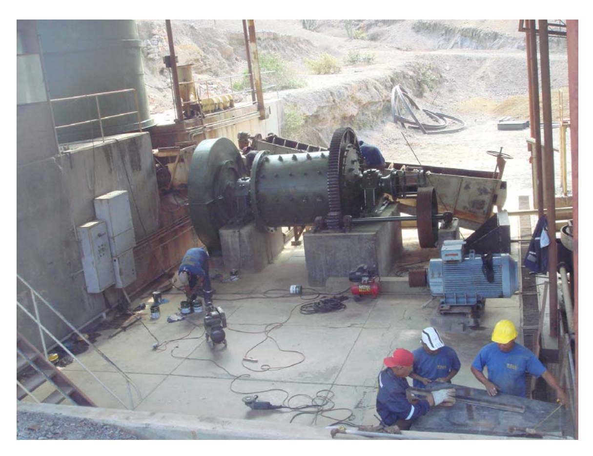
Mechanical work on the ball mill