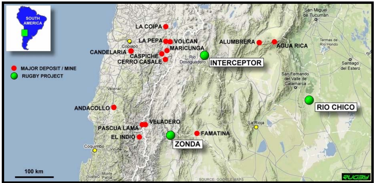
Figure 1 – Rio Chico & Zonda project location