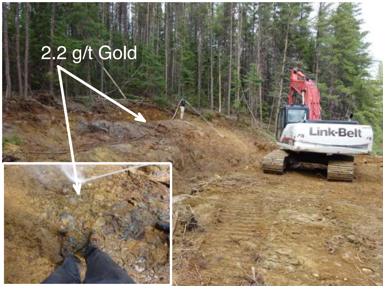
Figure 2. Stripping of a 1.2 metre thick conglomerate bed at the Cobble Zone with gold assays up to 2.2 g/t.