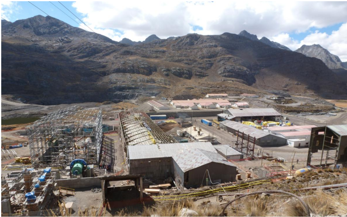
Figure 1: Construction of the Santander Mill and concentrate production facilities