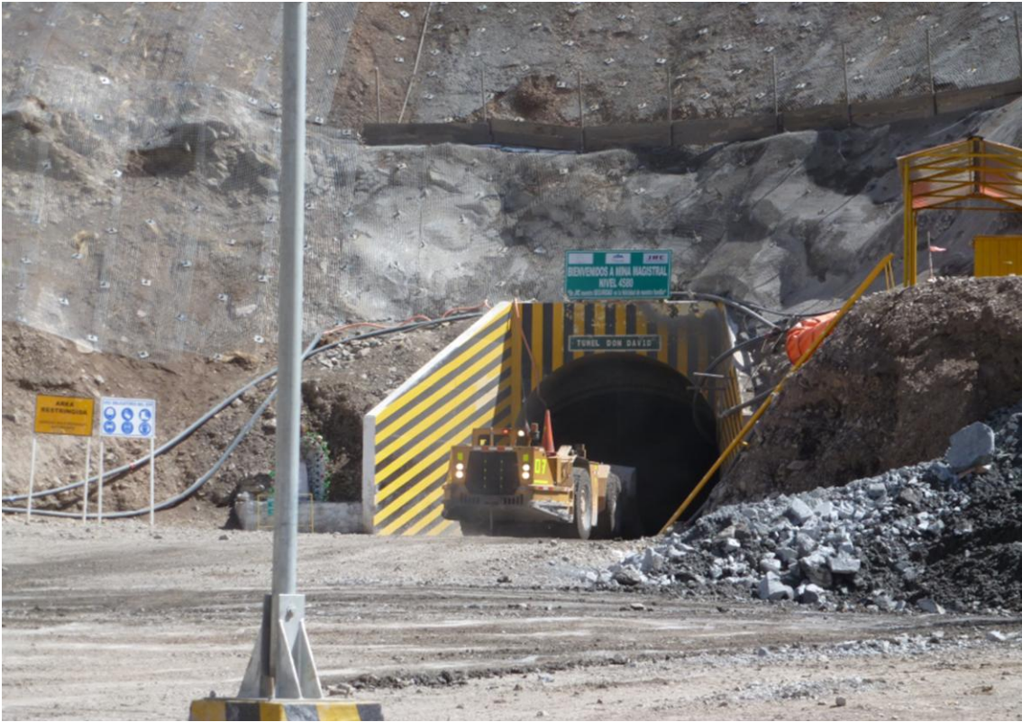
Figure 2: Active underground development at Santander Mine