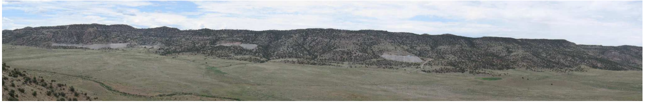
Figure 4.3. Panoramic view of the Gypsum Valley side of the SMC looking southwest from across the Gypsum Valley. Mine dumps from left to right are the Sunday/Carnation, St. Jude and West Sunday. The Topaz mine is out of sight on the far right, tucked into a drainage ditch.