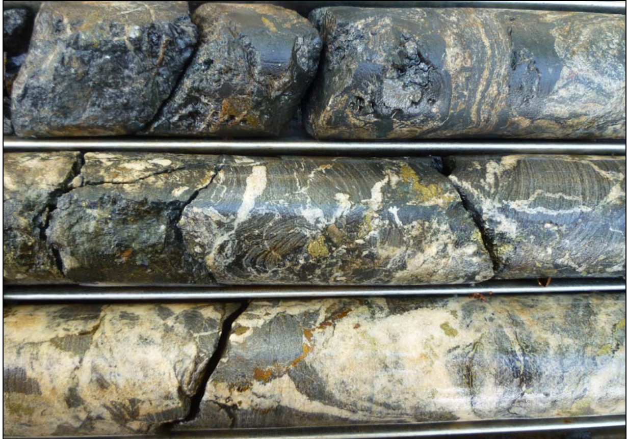
Plate 1: Luisha South Project – Diamond Drill core from LUDH025 (35.85m) Stromatolitic and dolomitic shales and siltstones of the Mines Series, quartz veined and fractured, with carrolite, chalcopyrite, minor chalcocite and bornite mineralization.