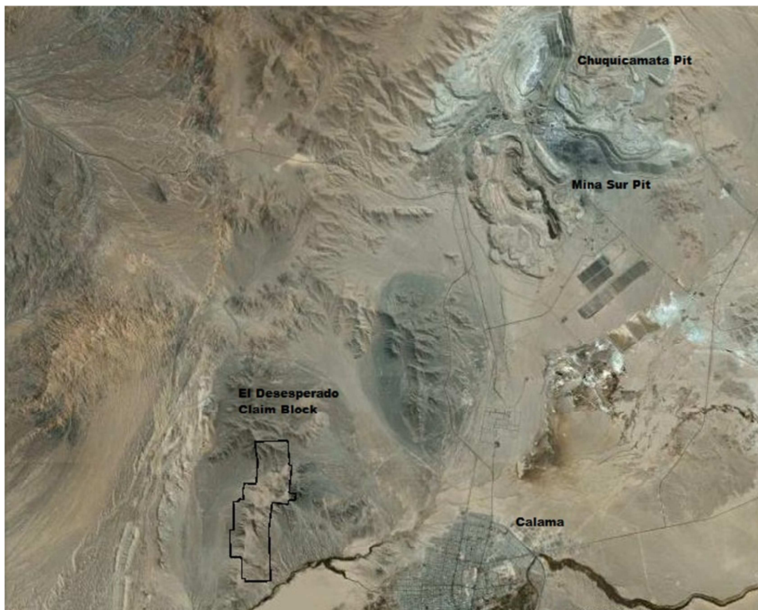
Figure 1: Location of El Desesperado Property