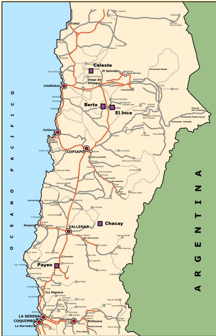
Figure 1: Location of Payen and other Coro Properties