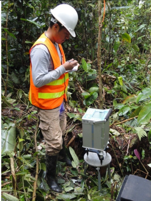
Operator and Scintrex CG-5 gravimeter