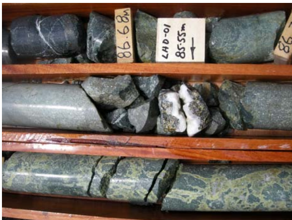
Photo 2 LHD-01 (85.55m) Quartz-base metal vein (quartz-pyrite-sphalerite-galena-chalcopyrite), approximately 4 cm wide, in a weakly altered andesitic sequence. The adjoining run (approximately 84.50m) shows pseudo-breccia textures in a propylitically-altered andesitic sequence.