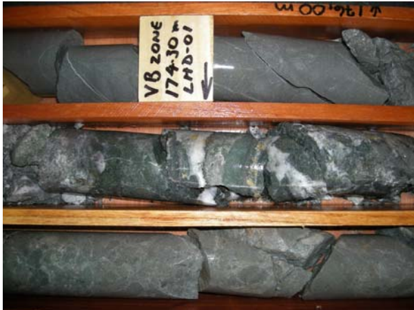
Photo 7 LHD-01 (174.30m)

Veta Blanca Shear Zone – typical shear related brecciation and quartz-base metal veining. Mineralisation includes pyrite-sphalerite-galena-chalcopyrite. The large honey-coloured crystals are low-Fe sphalerite. These veins represent the target ore zones, as mined in the historical workings (see Section 918100N).