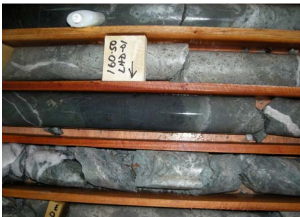
Photo 6 LHD-01 (160.50m)

Breccia zone within a sheared and strongly sericite-pyrite altered andesitic sequences. Breccia fragments are commonly matrix supported, as in this case.