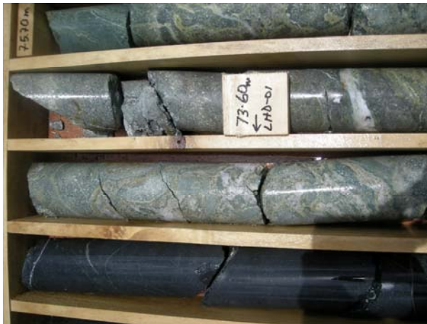
Photo 1 LHD-01 (73.60m) Pseudo-breccia zones in intensely sheared andesitic sequences. Advancing alteration fronts (intense quartz-carbonate-chlorite-pyrite) produces pseudo-breccia textures.