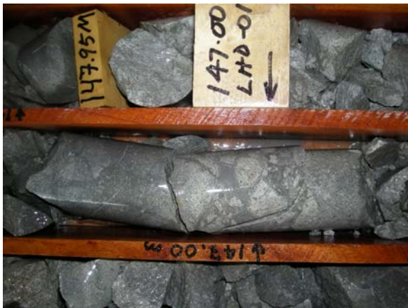
Photo 5 LHD-01 (147.00m)

Typical narrow quartz-carbonate-pyrite vein and associated alteration aureole in the brecciated sericite-pyrite altered andesitic sequence. The vein occurs as cavity infill, with crystalline quartz (dogstooth crystal growth), and minor brecciation of the wall rock within the vein. Typically, there will be a sulphide halo bordering the vein.