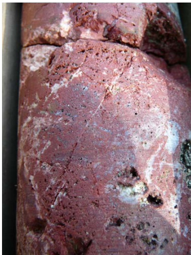
Photo 8 LHD-02 (68.10m) Quartz-hematite veining within altered andesitic sequences.

Veta Blanca Shear Zone – typical shear related brecciation and quartz-base metal veining. Mineralisation includes pyrite-sphalerite-galena-chalcopyrite. The large honey-coloured crystals are low-Fe sphalerite. These veins represent the target ore zones, as mined in the historical workings (see Section 918100N).