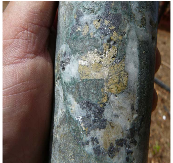
Photo 9 LHD-02 (97.50m) Close-up photo of quartz-base metal veining. The mineralisation seen here is principally sphalerite, with galena and trace chalcopyrite. Wall rock alteration is quartz-sericite pyrite, and the units are andesitic.