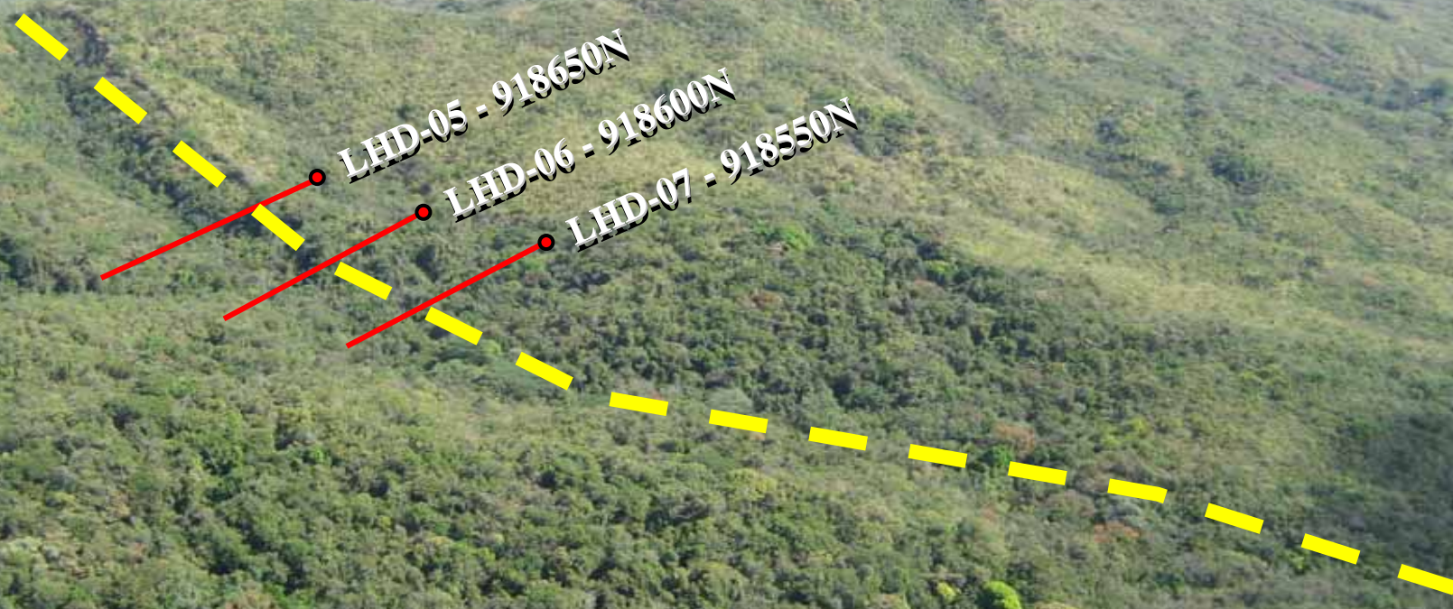
El Tiro Prospect, looking northeast