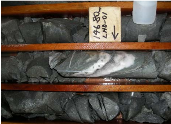
Photo 4 LHD-01 (146.80m)

Typical narrow quartz-carbonate-pyrite vein and associated alteration aureole in the brecciated sericite-pyrite altered andesitic sequence. The vein occurs as cavity infill, with crystalline quartz (dogstooth crystal growth), and minor brecciation of the wall rock within the vein. Typically, there will be a sulphide halo bordering the vein.