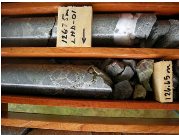
Photo 3 LHD-01 (126.75m) Breccia zone within a sheared and strongly sericite-pyrite altered andesitic sequence.