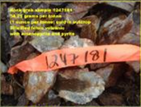
Goldstack sample 1247181 34.25 grams per tonne (1 ounce per tonne) gold to surface Silicified felsic volcanic with arsenopyrite and pyrite