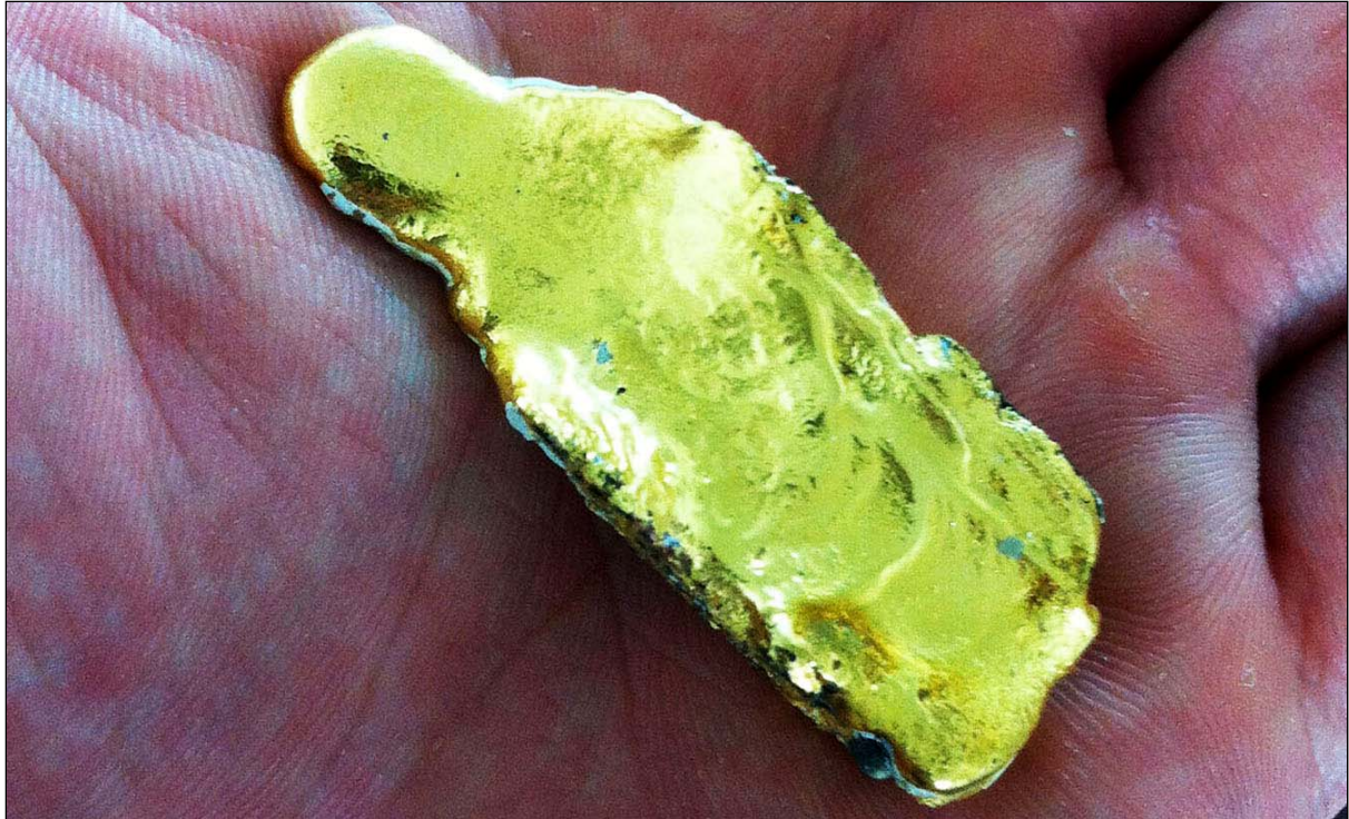
Figure 1: Gold produced from Hunter Bays alluvial tailings operations.