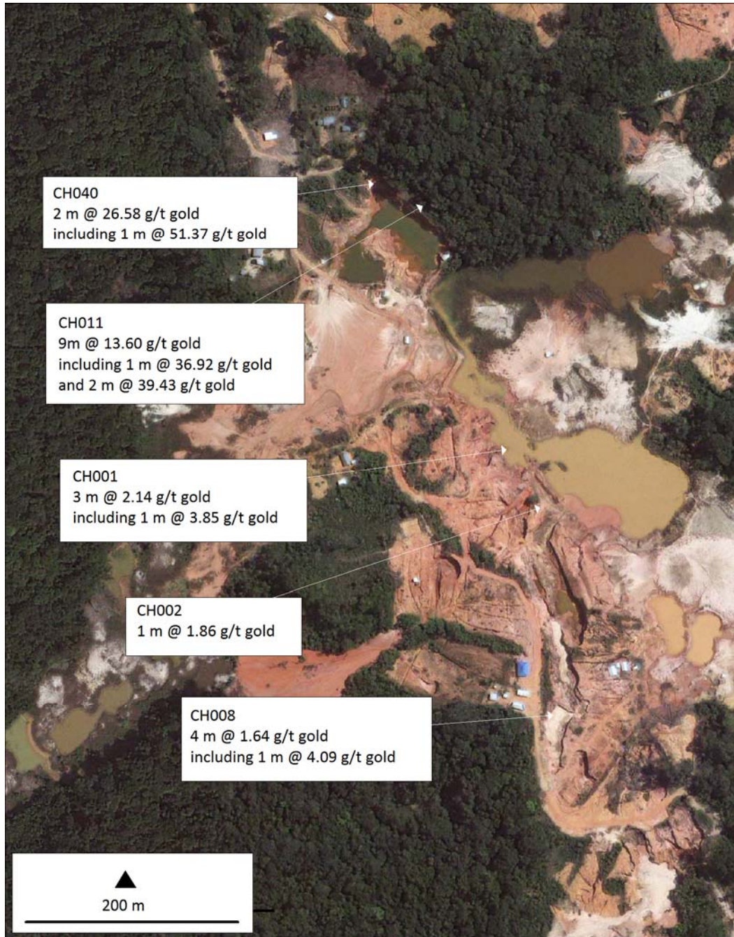
Figure 3: Cambior and select channel sample results.