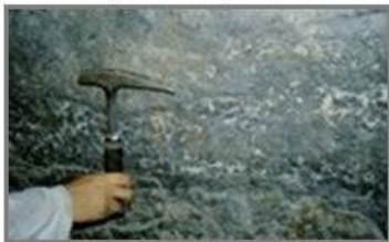
Merensky Reef, Rustenberg