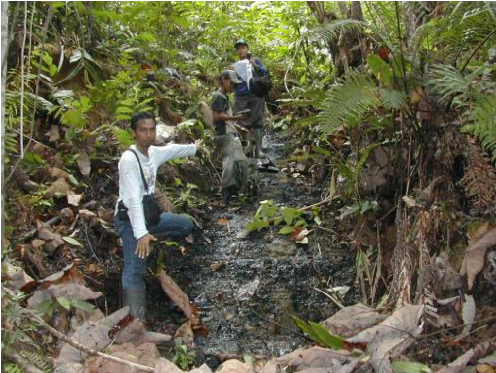
Coal Outcrop on PT.Indobara Pratama with thickness of 3.7 m