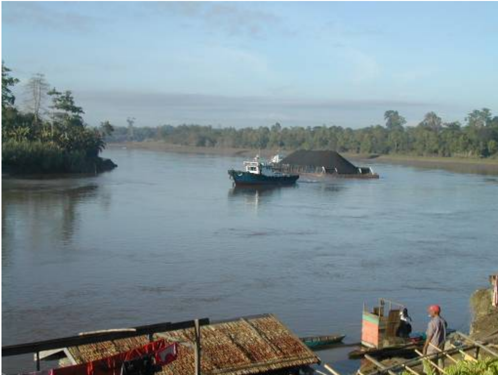
Jetty port is located in Belayan River with draft of 3-4 meter.