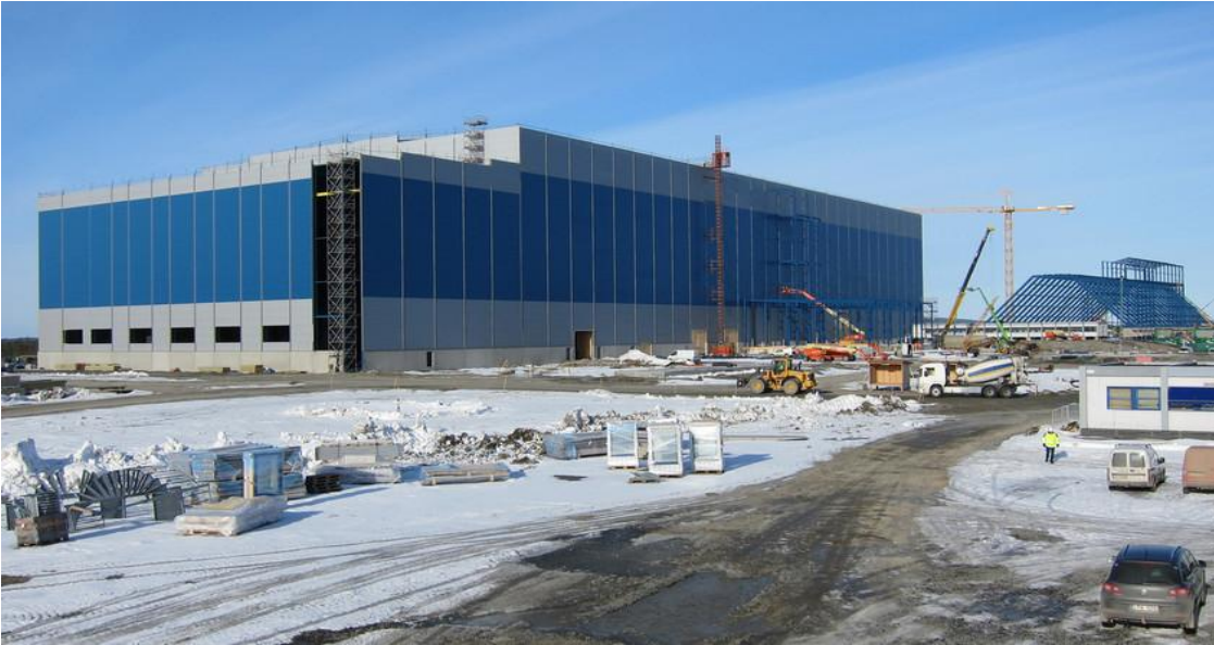
In the foreground, the Kaunisvaara Process Plant and behind it, the ore stock pile for ore from the Tapuli mine.