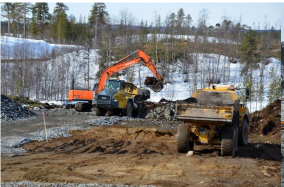
Construction work on the transloading terminal in Pitkäjärvi.