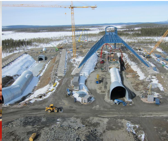
Construction of the Tapuli ore stock pile.