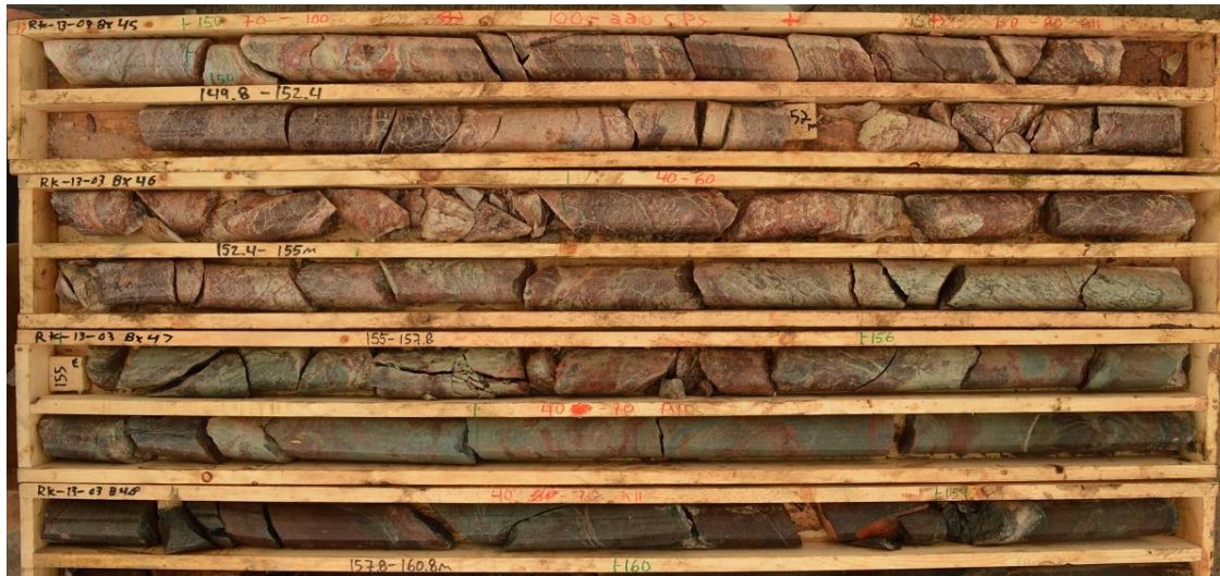
Fig 2 Highly Altered Haematised breccia zone, Rook 1 hole RK-13-03, 149-161m downhole,

PLS resistivity data from Fission 10 March 2013