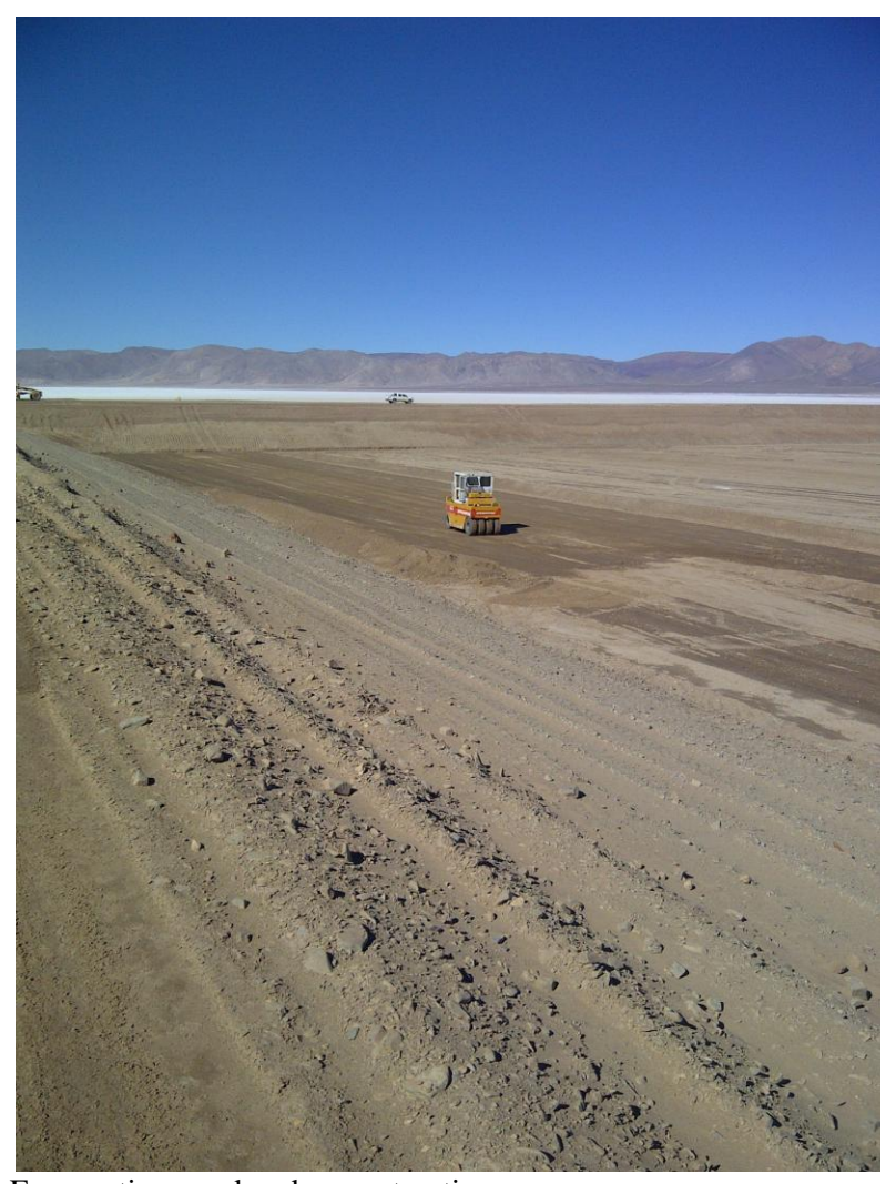
Evaporation pond under construction