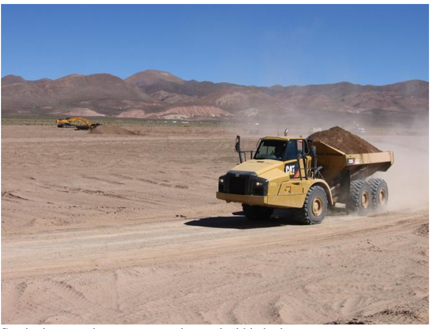
Continuing to make progress, on time and within budget