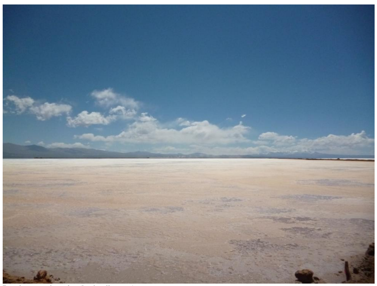
Road across the salar (in the distance)