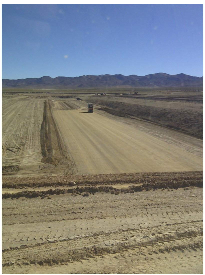
Evaporation pond under construction