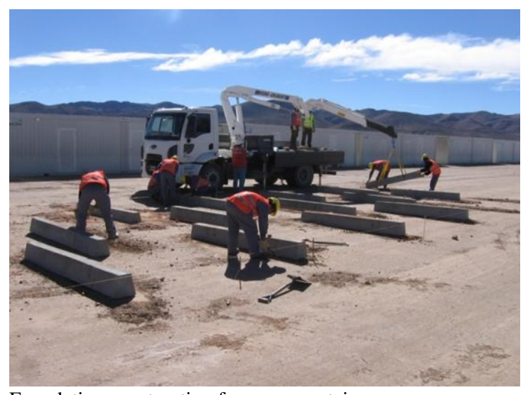
Foundation construction for camp containers