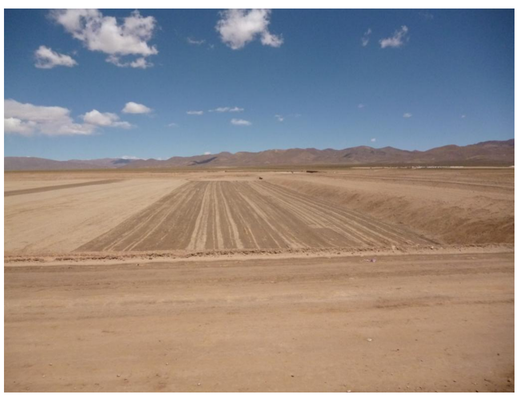
Evaporation pond under construction