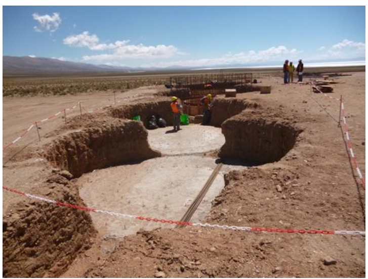
Foundations for Lime Plant Silos