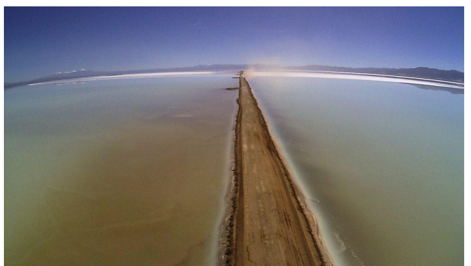
Road across the salar with the evaporation ponds in the distance